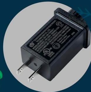
UL SAFETY CERTIFIED PLUG