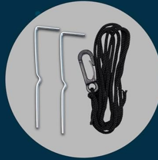
STAKES & STRINGS INCLUDED