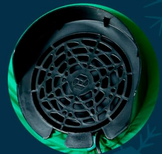
BUILT-IN IP44 AIR BLOWER