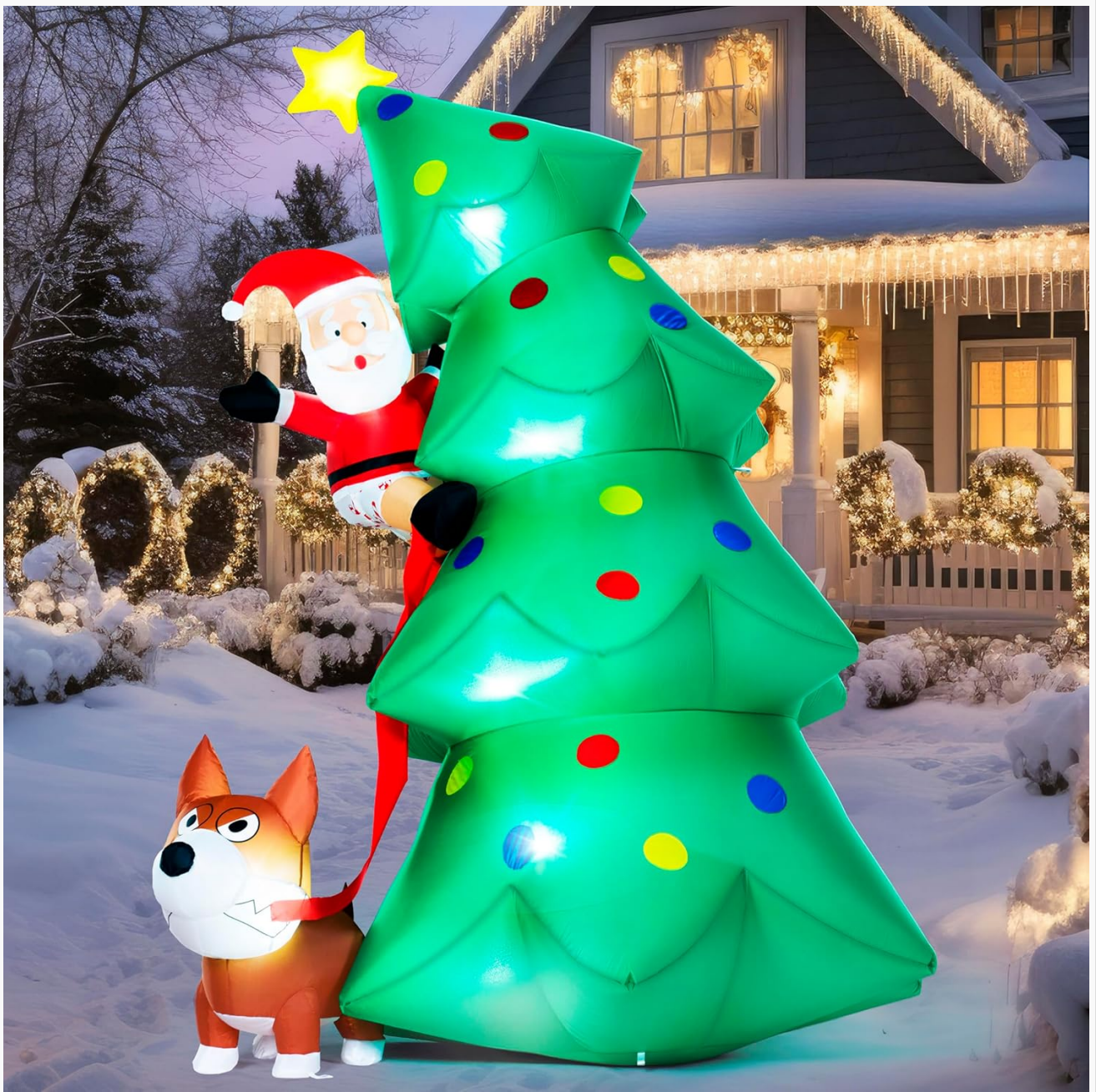
Image 1.1: The Joiedomi 6 FT Tall Christmas Tree Inflatable with Santa and Dog, illuminated in a snowy outdoor setting.