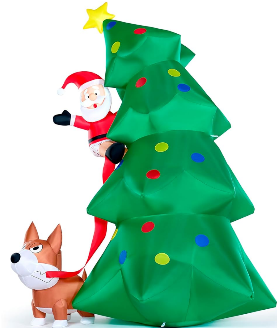
Image 2.1: Key features highlighting the product's weather resistance and quick inflation.