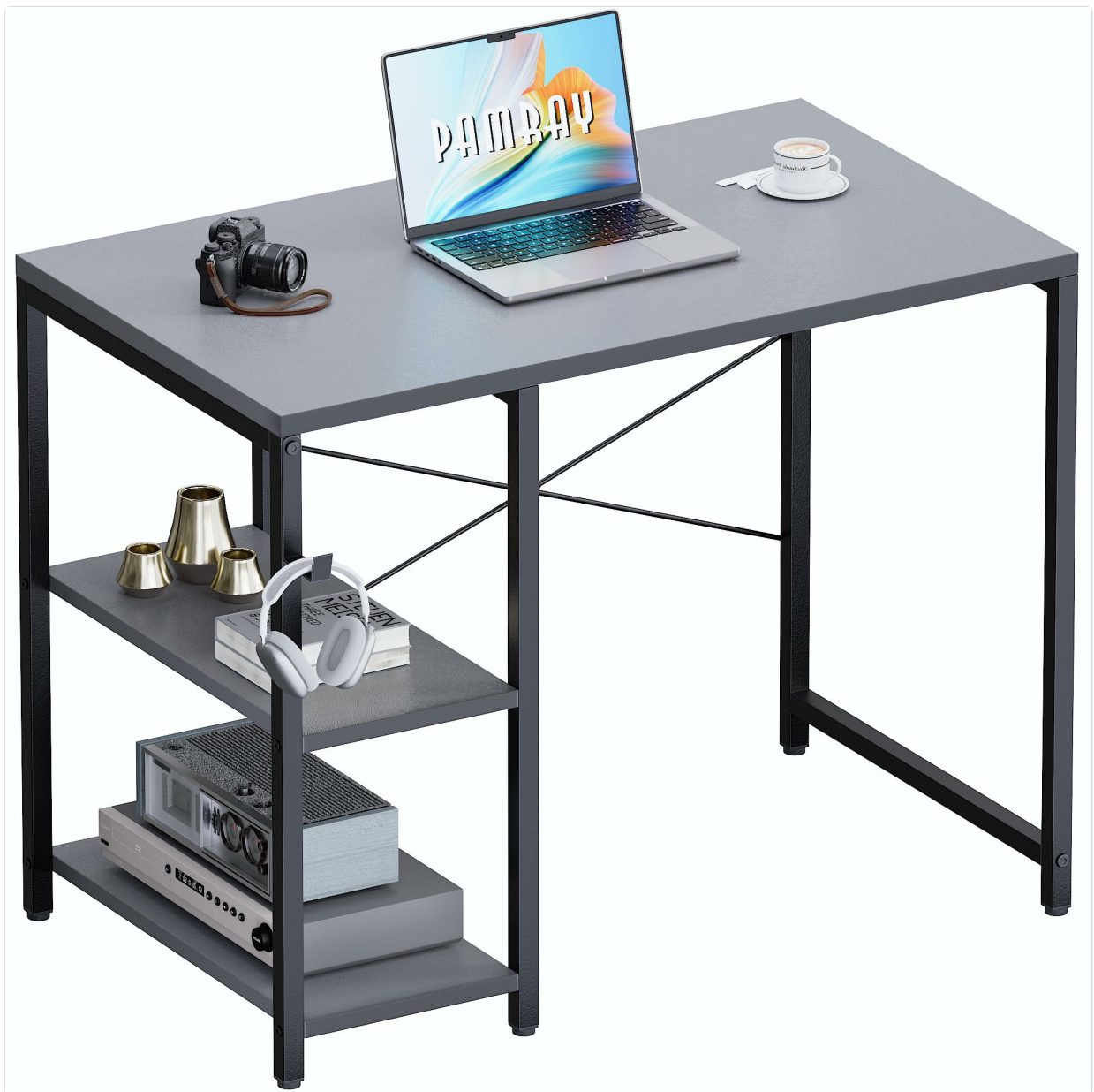
The Pamray 32 Inch Small Computer Desk with integrated shelves, shown in a grey finish.