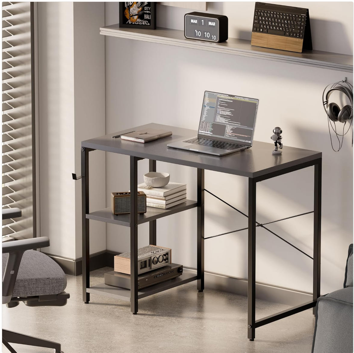
The X-shaped back brace provides structural integrity to the desk frame.