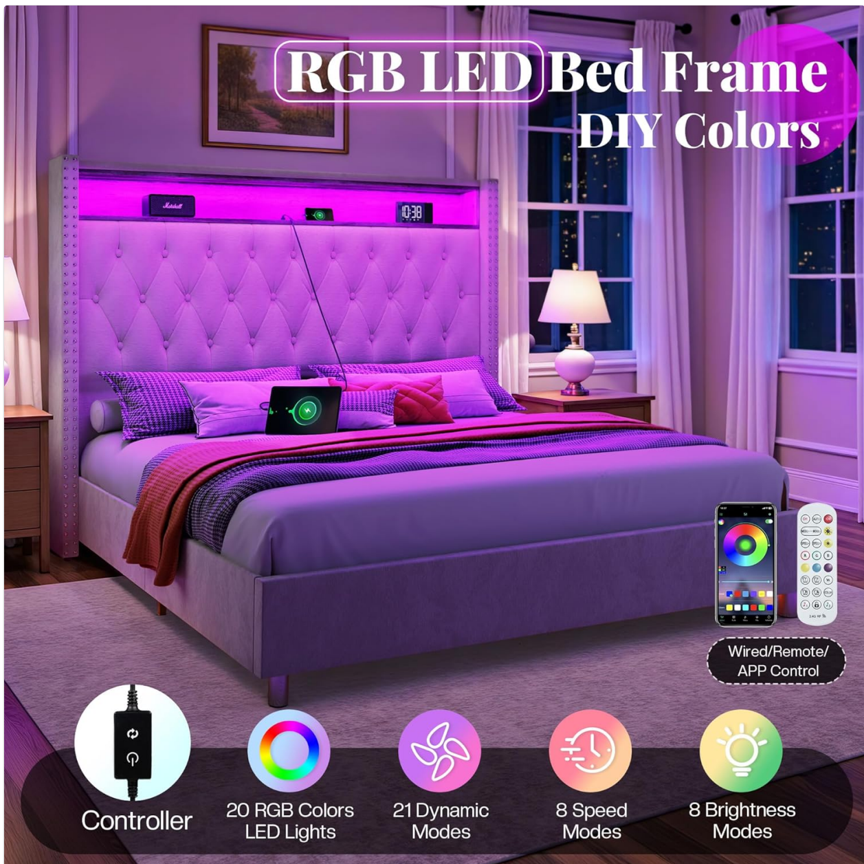
Image 5.1: This image illustrates the RGB LED lighting features, including the wired controller, remote control, and mobile app control options, along with the 20 RGB colors, 21 dynamic modes, 8 speed modes, and 8 brightness modes.