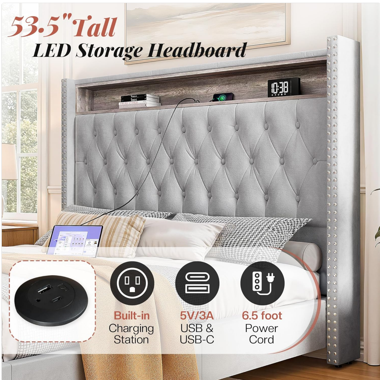
Image 5.2: A detailed view of the 53.5-inch tall headboard, highlighting the built-in charging station with USB and USB-C ports, the storage shelf, and the 6.5-foot power cord.