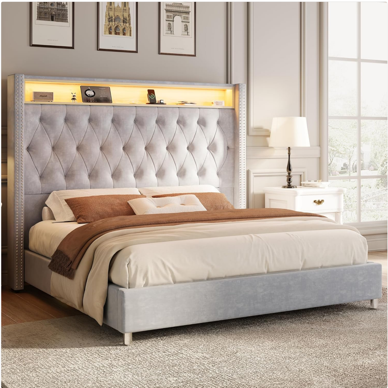
Image 1.1: The Jocisland King Size Bed Frame with its tall upholstered headboard, integrated LED lighting, and charging station.