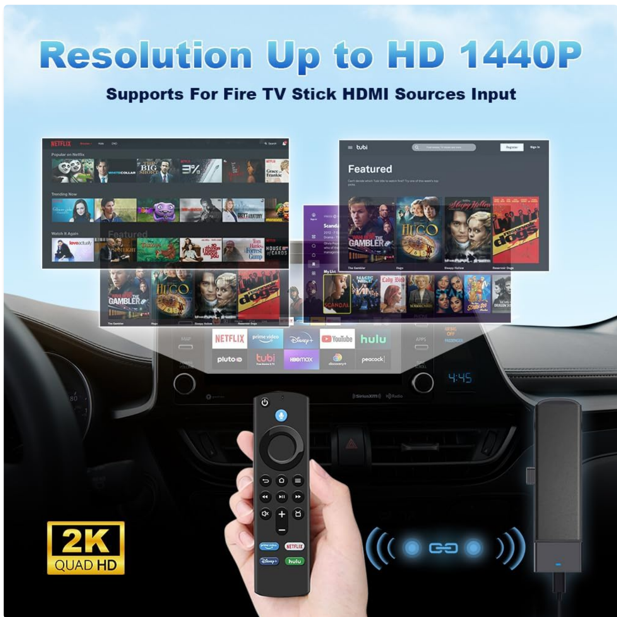
Figure 2: Displaying 2K Quad HD resolution support for Fire TV Stick.