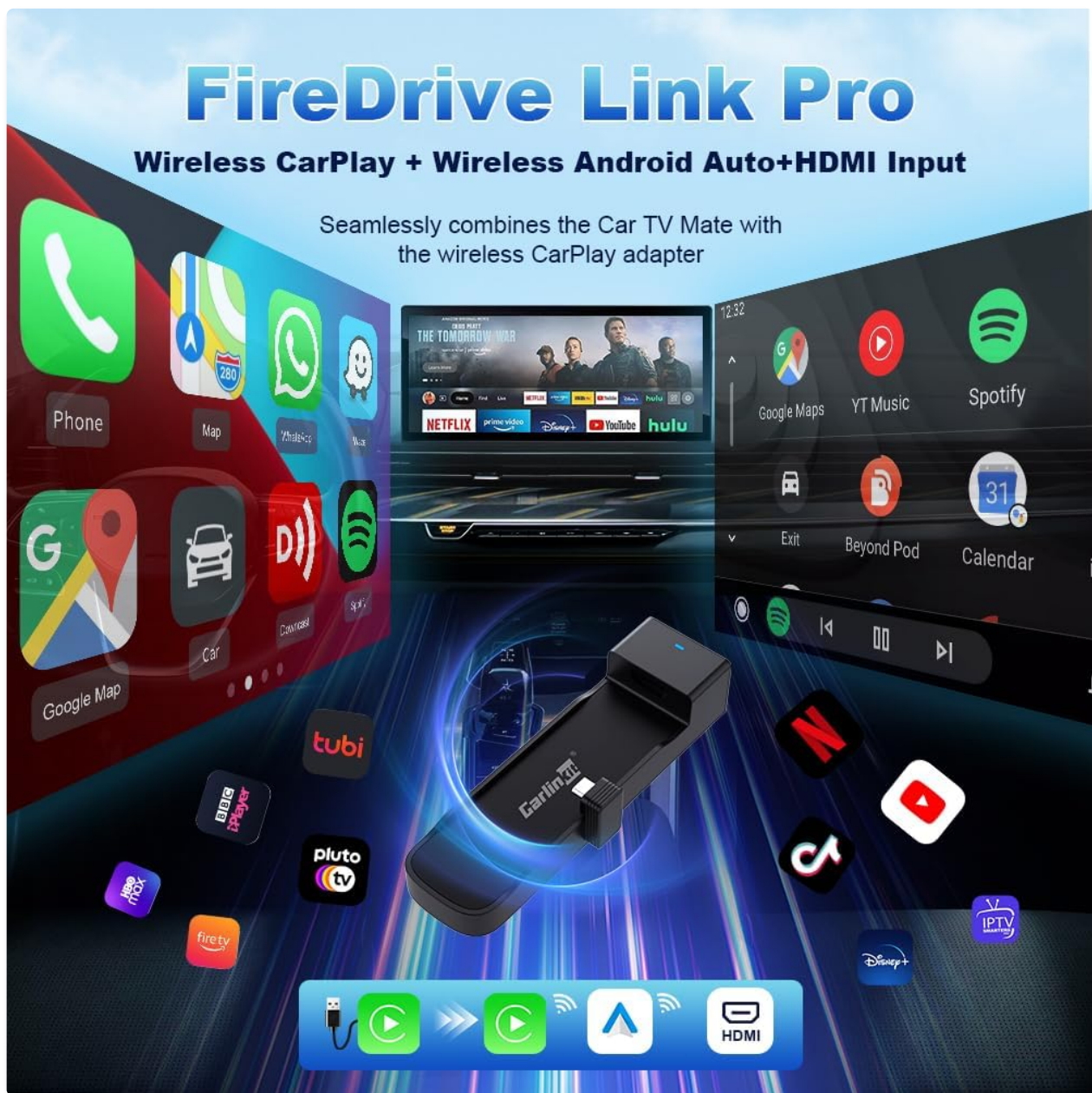
Figure 1: Carlinkit FireDrive Link Pro highlighting its multi-functionality.

The device supports high-definition resolution up to 1440P, specifically for Fire TV Stick HDMI sources. This ensures a clear and vibrant viewing experience on your car's display.