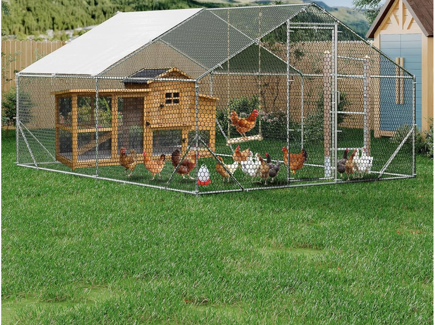
Image 5.2: The coop's weather protection features, including a PE-coated waterproof cover and galvanized iron pipe construction.