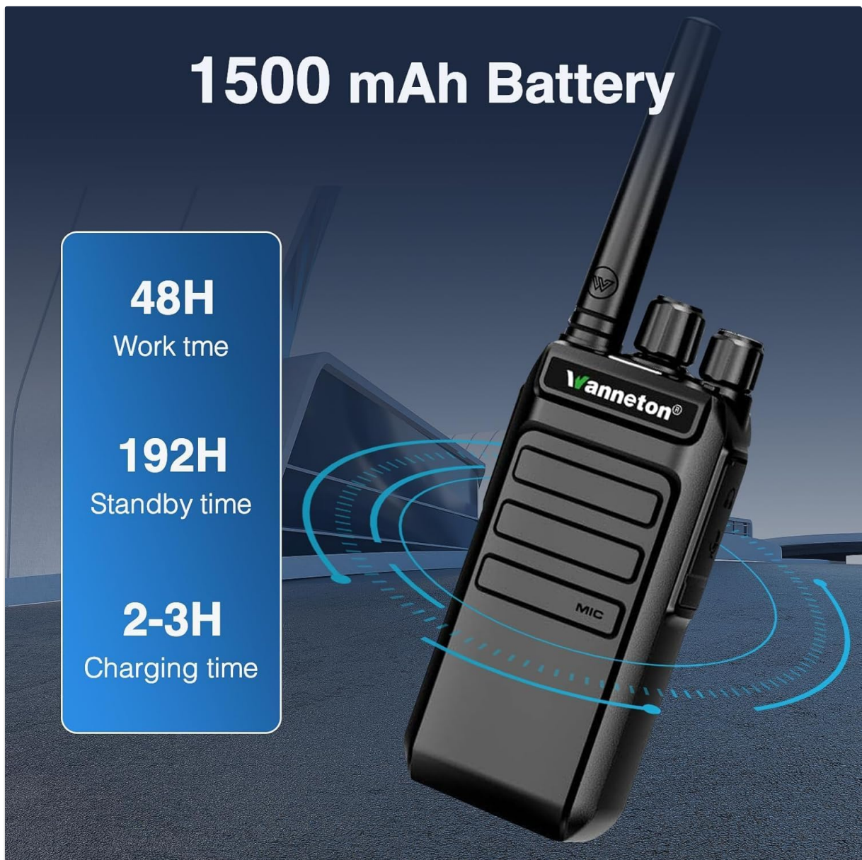
Figure 3: Battery specifications: 1500mAh capacity, approximately 48 hours work time, 192 hours standby time, and 2-3 hours charging time.