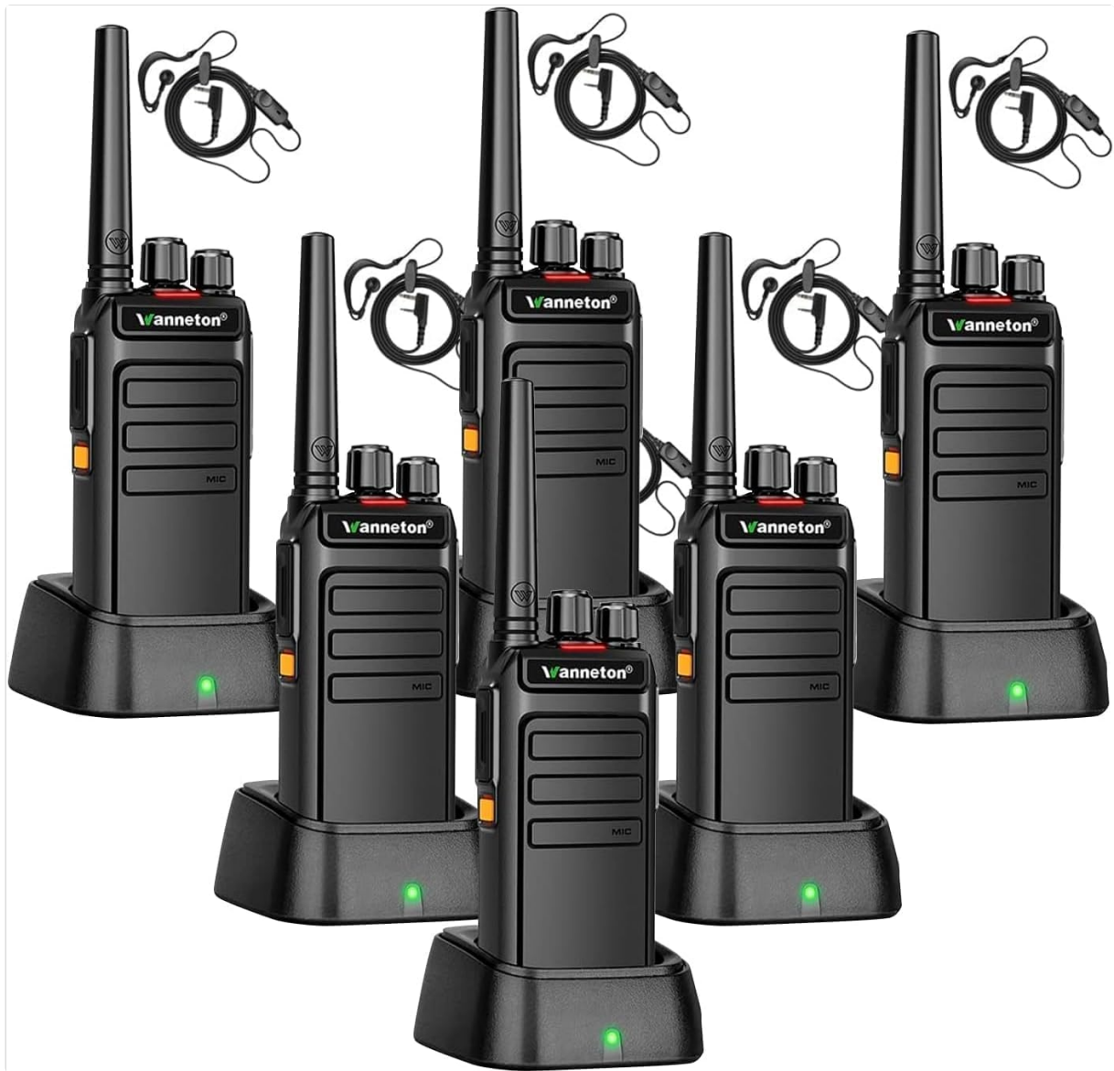
Figure 2: Six Wanneton New-F3-6PCS walkie talkies with antennas and charging docks.