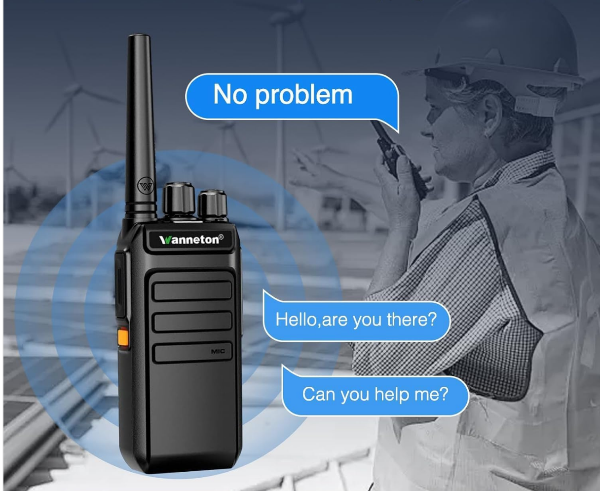
Figure 5: VOX hands-free operation allows communication without pressing the PTT button.