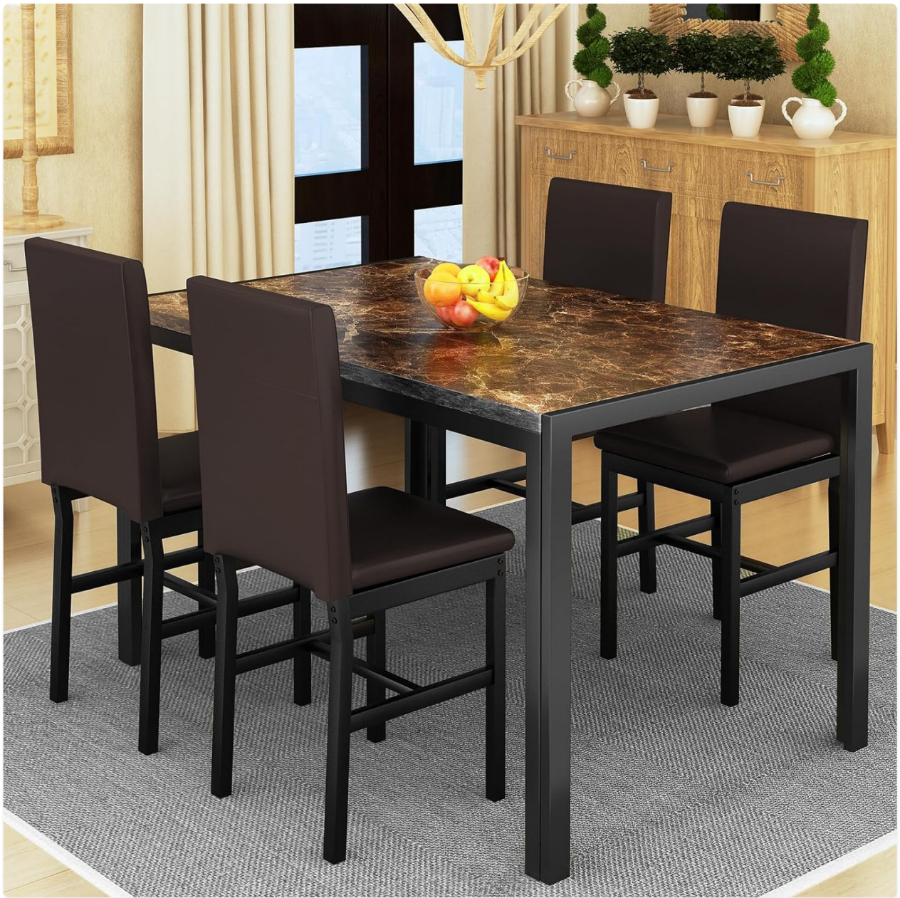
Image: The Recaceik 5 Piece Dining Table Set, featuring a dark brown faux marble table and four matching PU leather chairs, arranged in a modern dining area.