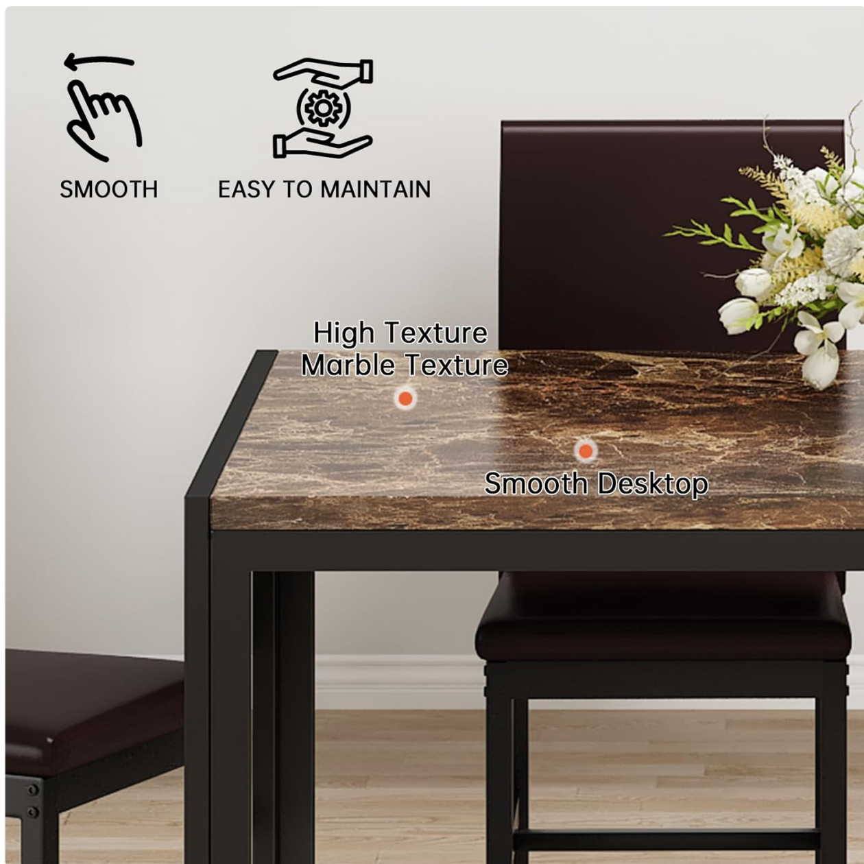
Image: A close-up view of the faux marble tabletop, highlighting its smooth texture and ease of cleaning.