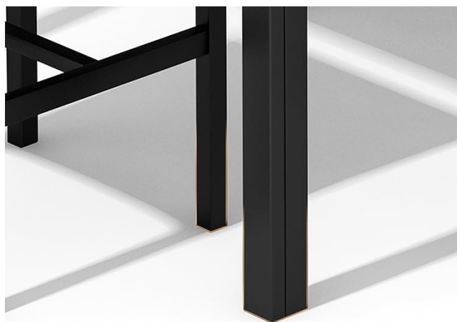
Image: Detail of the table leg showing non-slip floor protectors, designed to provide stability and protect flooring.

Easy to clean and maintain, just wipe it with a damp cloth. If stain occurs, please wipe it in time