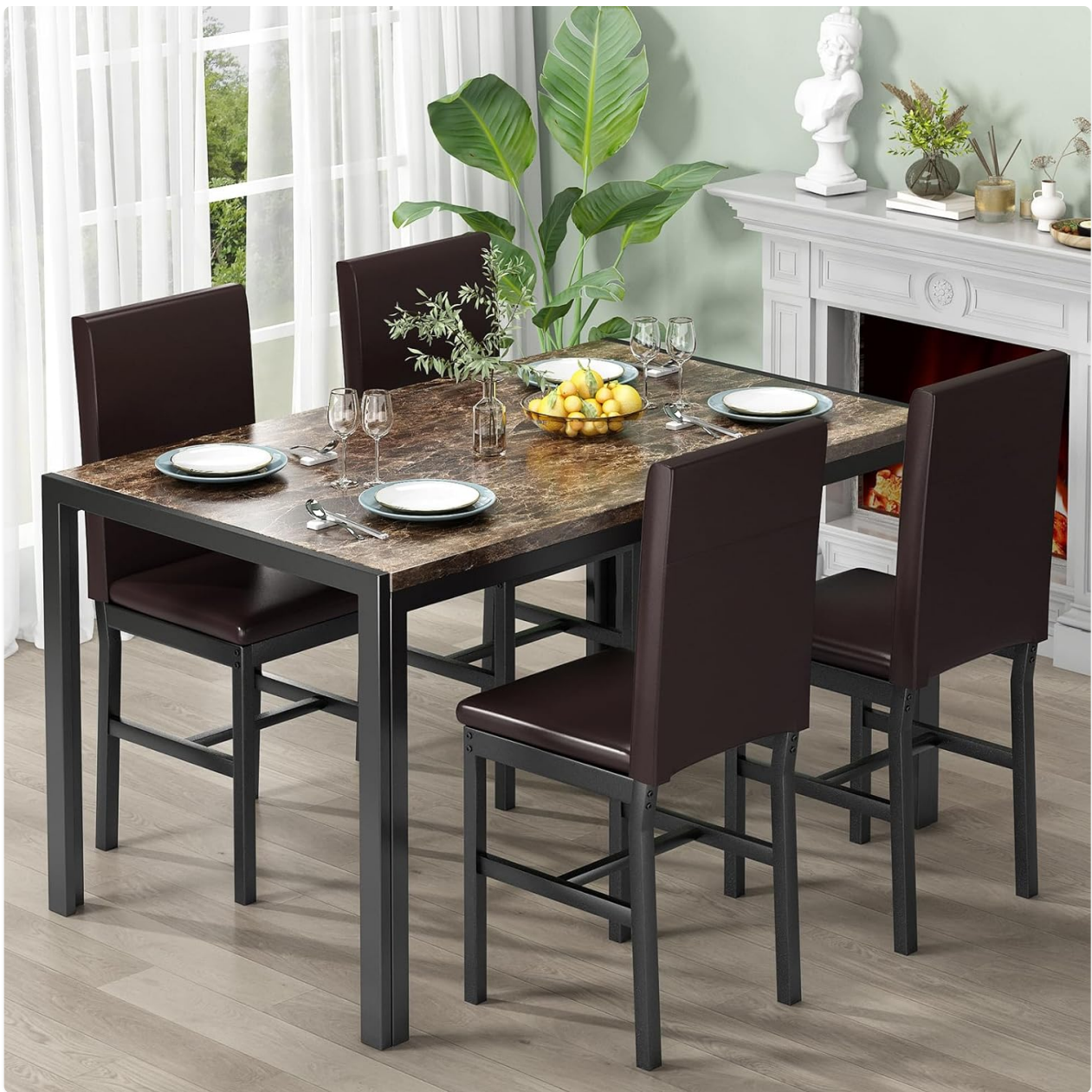
Image: A visual representation of the dining table and chair, indicating that the set includes one table and four chairs, along with their respective dimensions and weight capacities.