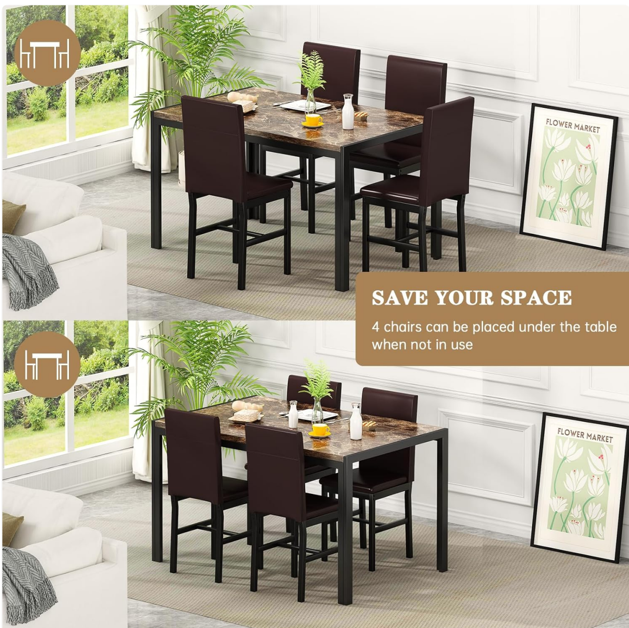
Image: The dining set demonstrating its space-saving capability, with all four chairs neatly tucked under the table when not in use.