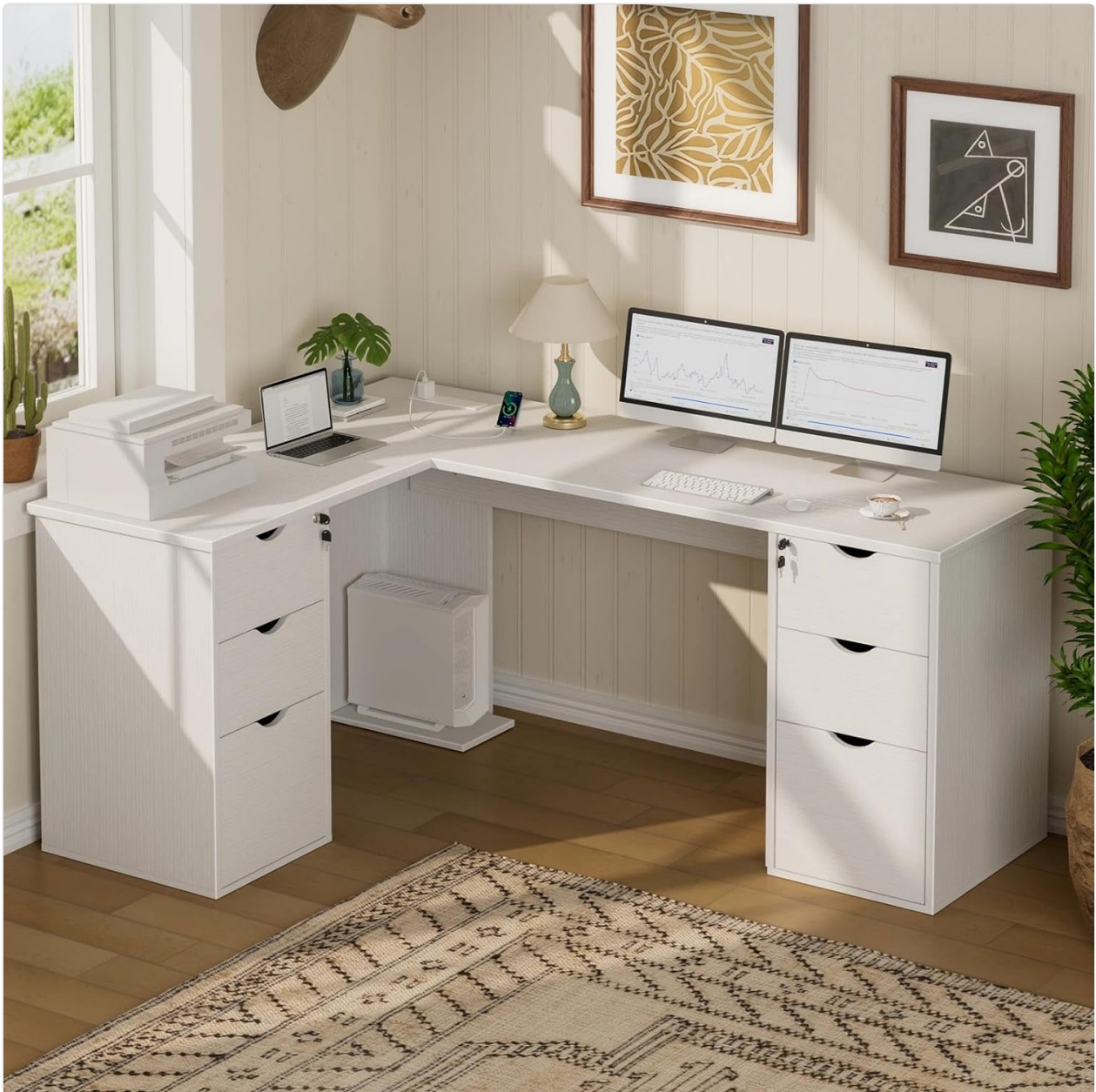
Figure 2: The L-shaped desk after main structural assembly.