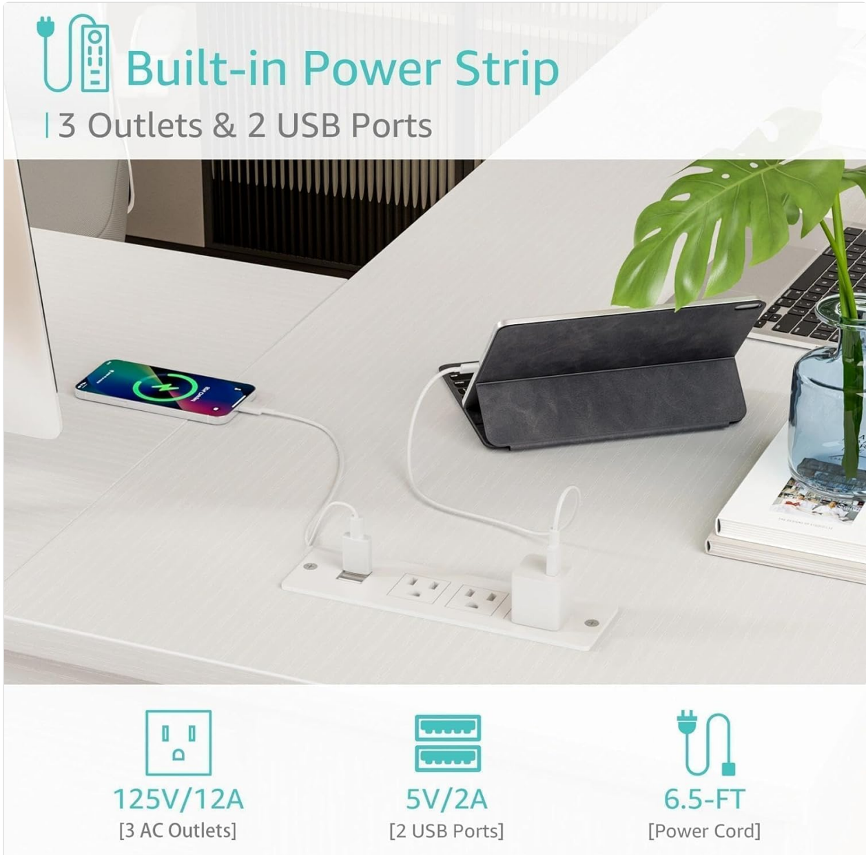
Figure 3: Integrated power outlet for convenient charging.