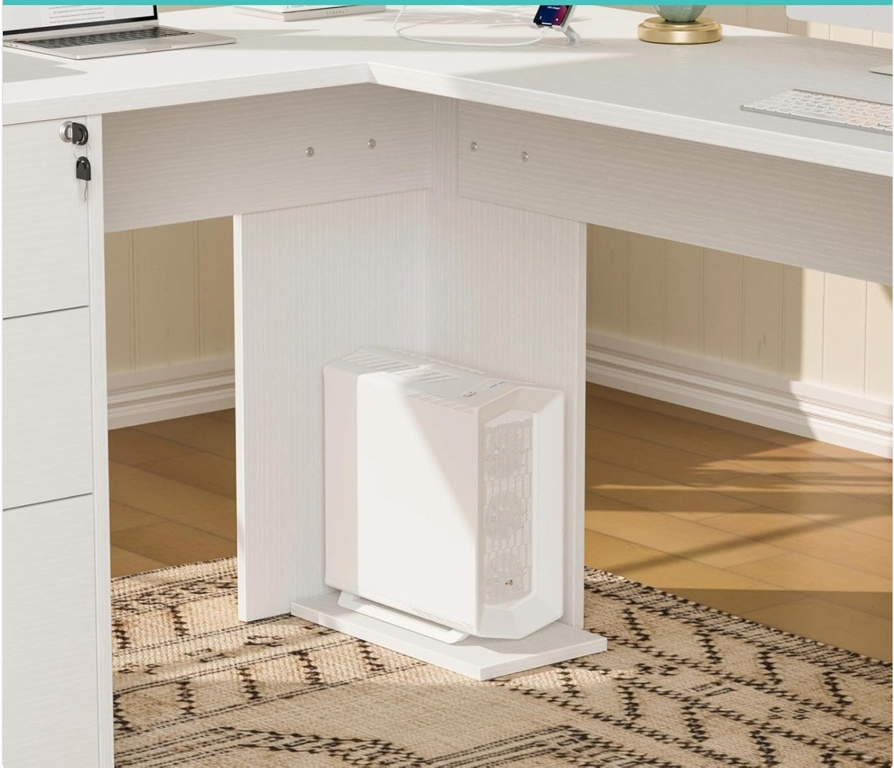
Figure 5: The mobile CPU platform for convenient computer placement.

Protects your PC from dust, kicks, and uneven floors