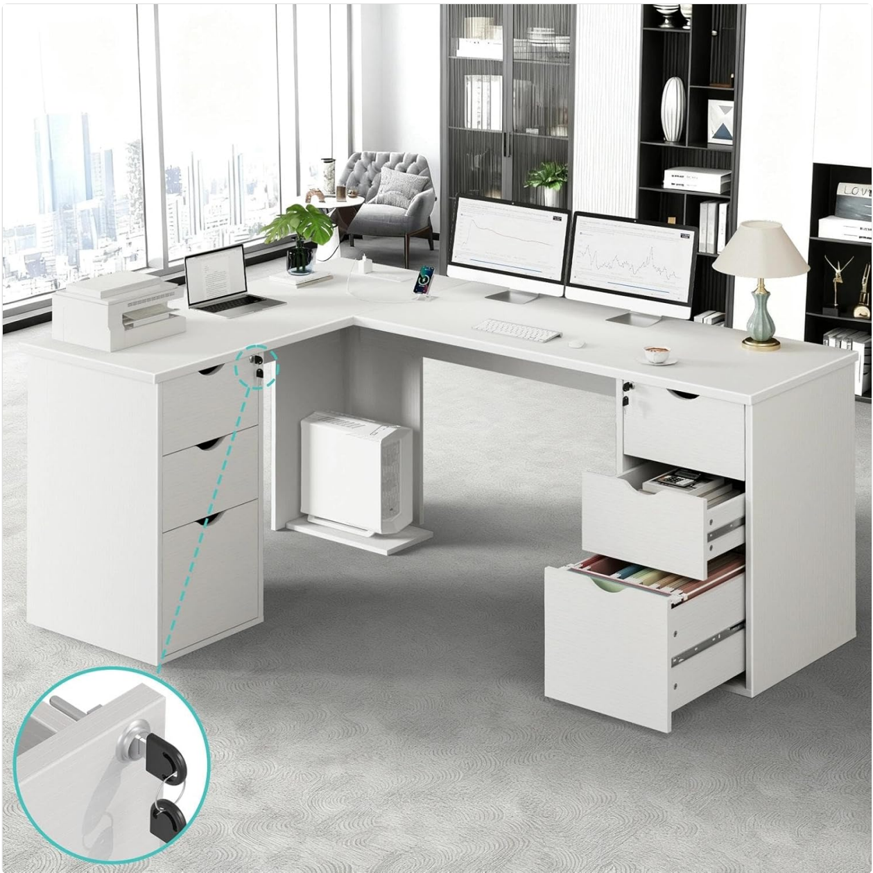
Figure 1: Fully assembled WINAZ L-Shaped Office Desk.