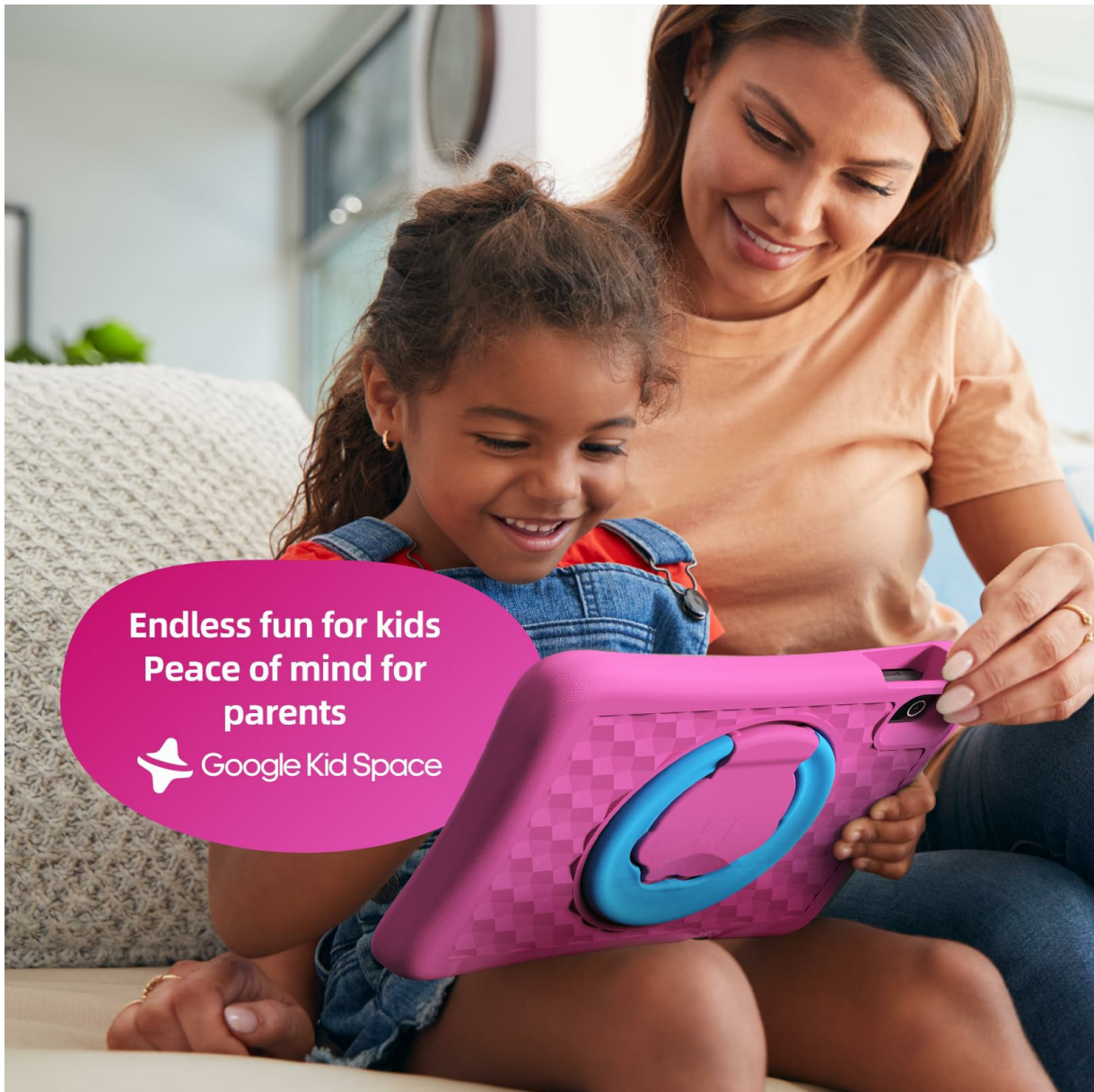
Image: A child engaging with educational content within Google Kids Space on the Plimpton Kids20 Tablet.