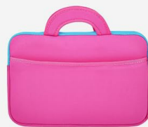
Tablet storage bag