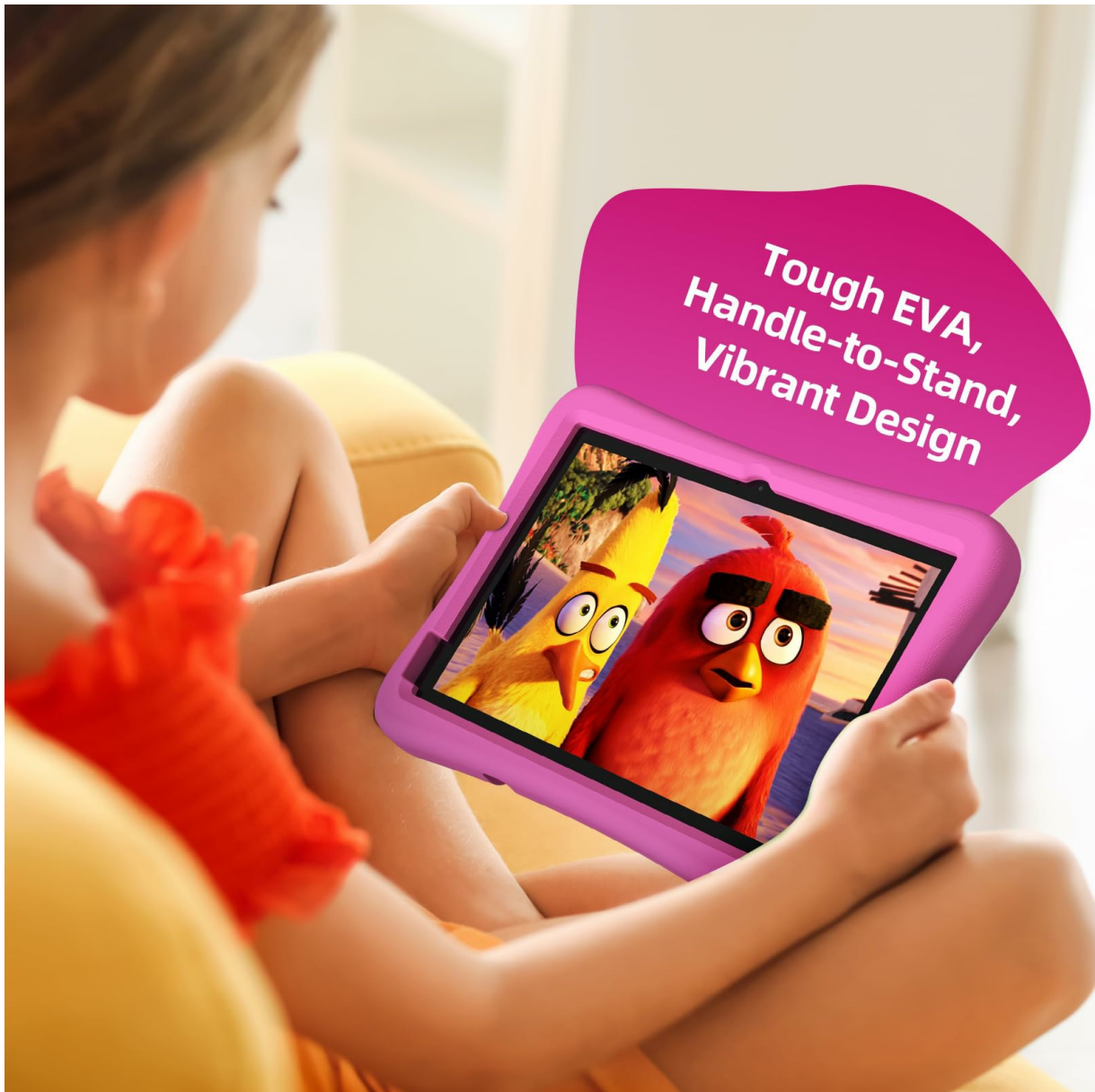
Image: Plimpton Kids20 Tablet in its EVA protective case, showcasing the 360-degree rotating stand.