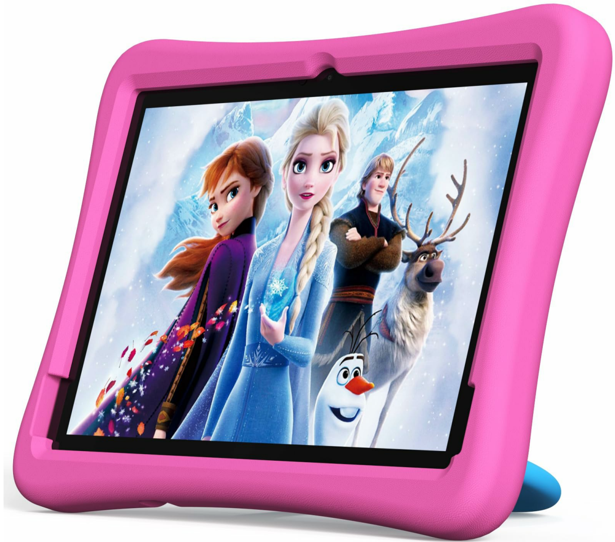
Image: Plimpton Kids20 Tablet with Pink Protective Case