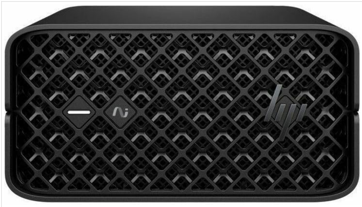
Figure 3: Side view of the HP Z2 Mini G1a Workstation, showing various input/output ports for connectivity.

The workstation is equipped with multiple USB ports for connecting external devices such as storage drives, printers, and other peripherals.