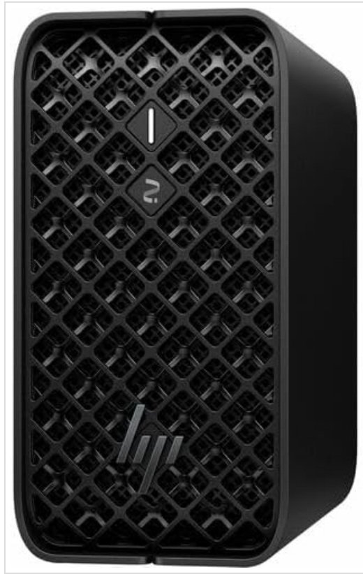
Figure 1: Front view of the HP Z2 Mini G1a Workstation, showcasing its compact design and ventilation grille.

Carefully remove the workstation from its packaging. Place the unit on a stable, flat surface with adequate ventilation. Avoid placing it in enclosed spaces or near heat sources.