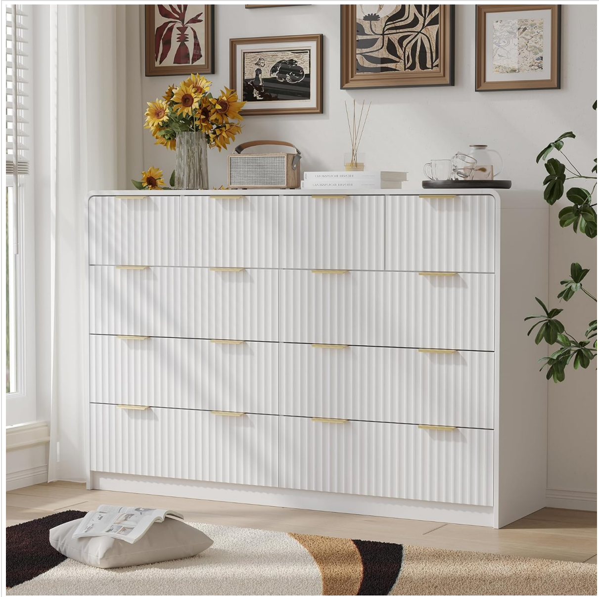
Image: The HOUROM 10-Drawer Fluted Dresser, showcasing its design and placement in a room.