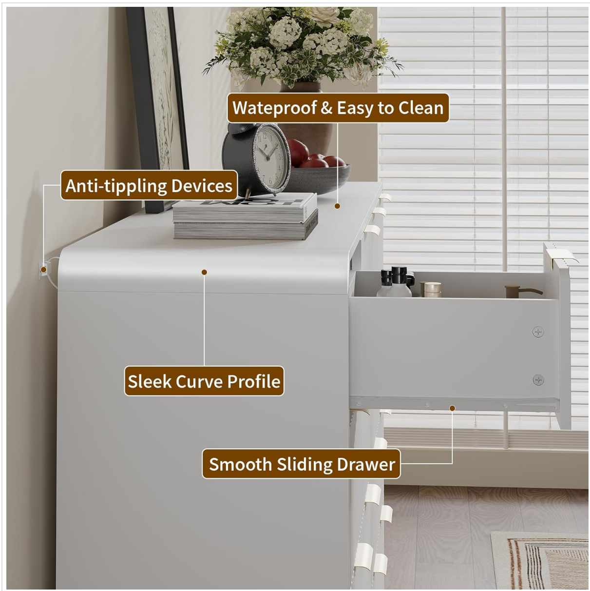
Image: Detail of the dresser's sleek curve profile and the anti-tipping device for enhanced stability.