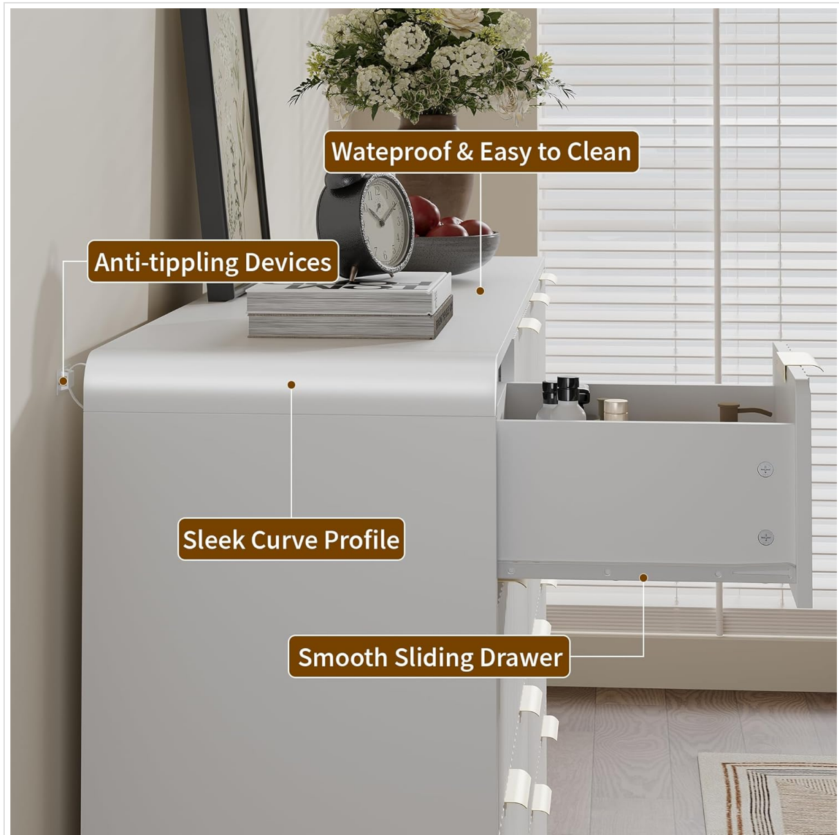
Image: A close-up of the dresser surface, indicating its waterproof and easy-to-clean properties.