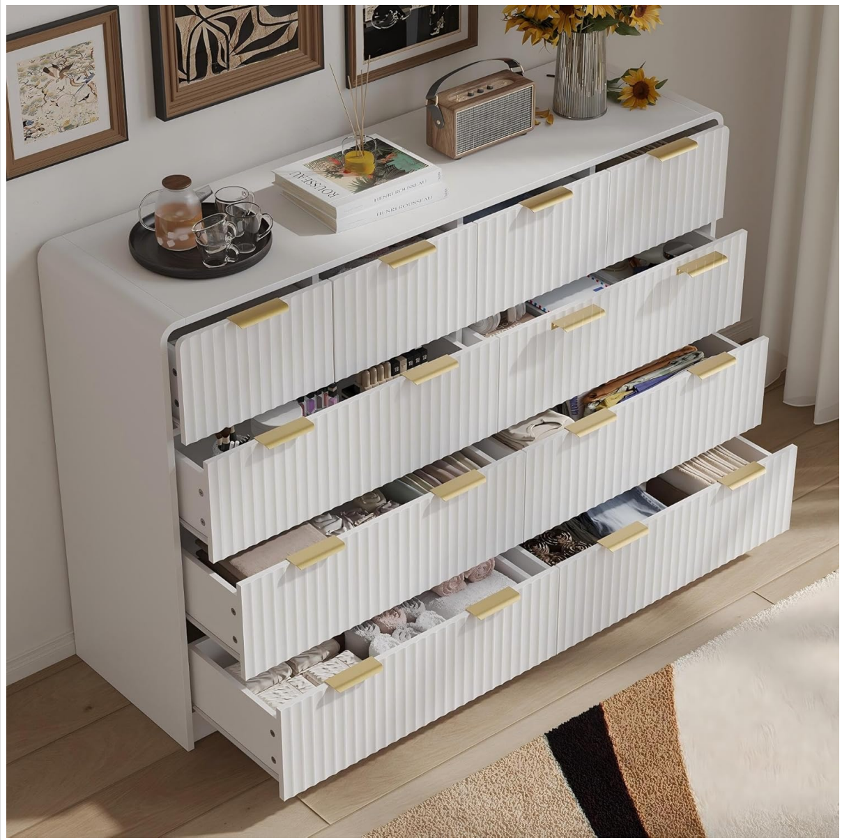
Image: An overhead view of the dresser with several drawers open, demonstrating the spacious interior for organized storage.