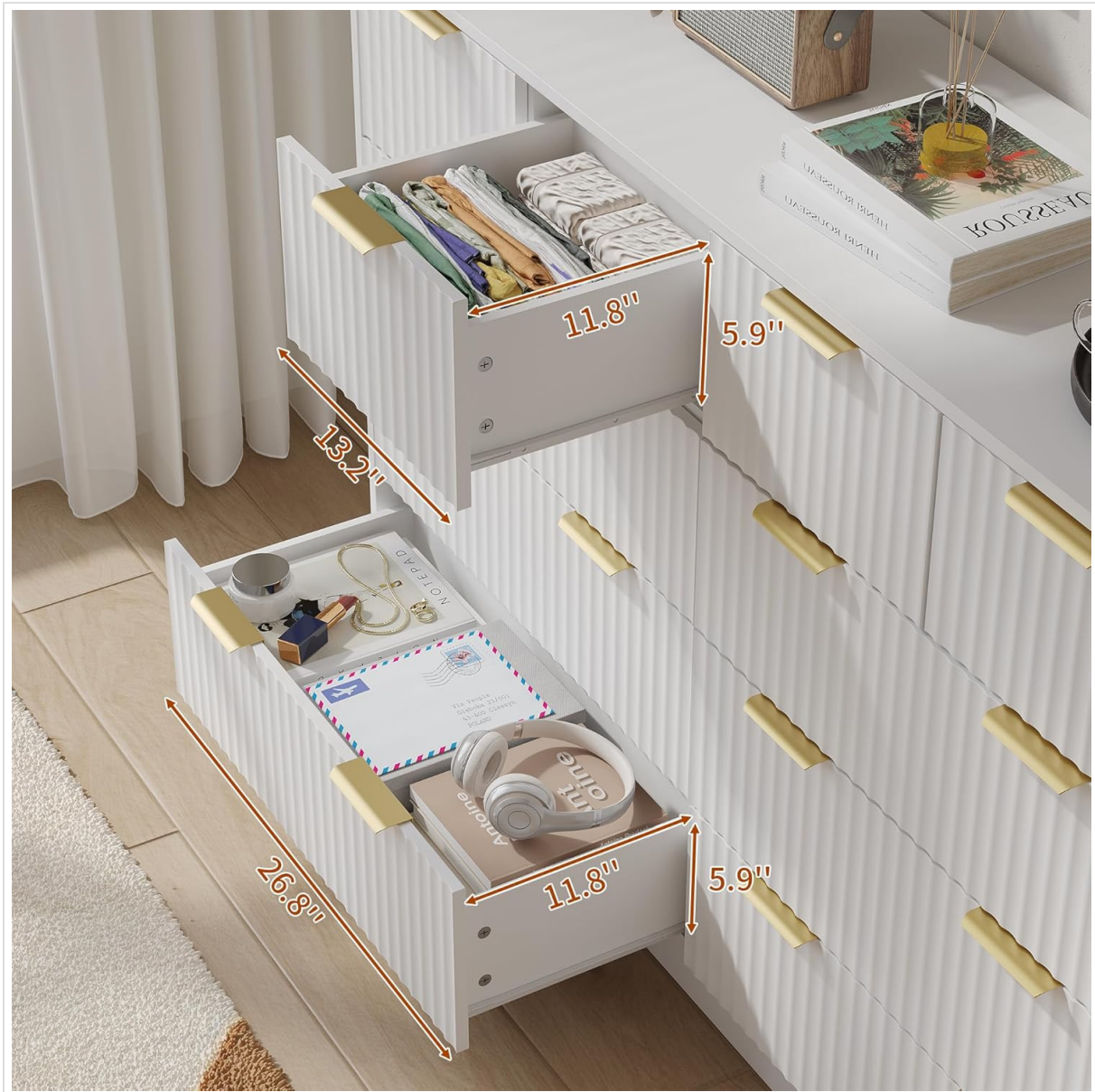
Image: The dresser with drawers partially open, showcasing its large storage capacity for various items.

The HOUROM 10-Drawer Fluted Dresser is designed for easy and efficient use. Each of the ten drawers features smooth-gliding rails and chic gold metal handles, allowing for effortless opening and closing. The ample storage space is ideal for organizing clothing, accessories, linens, and other personal items.