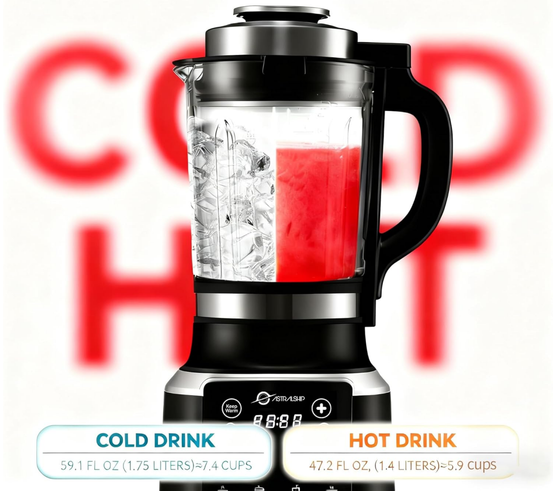
Image: The ASTRALSHIP ASH01-B Blender demonstrating its ability to handle both cold drinks (59.1 fl oz) and hot drinks (47.2 fl oz), highlighting its versatility.