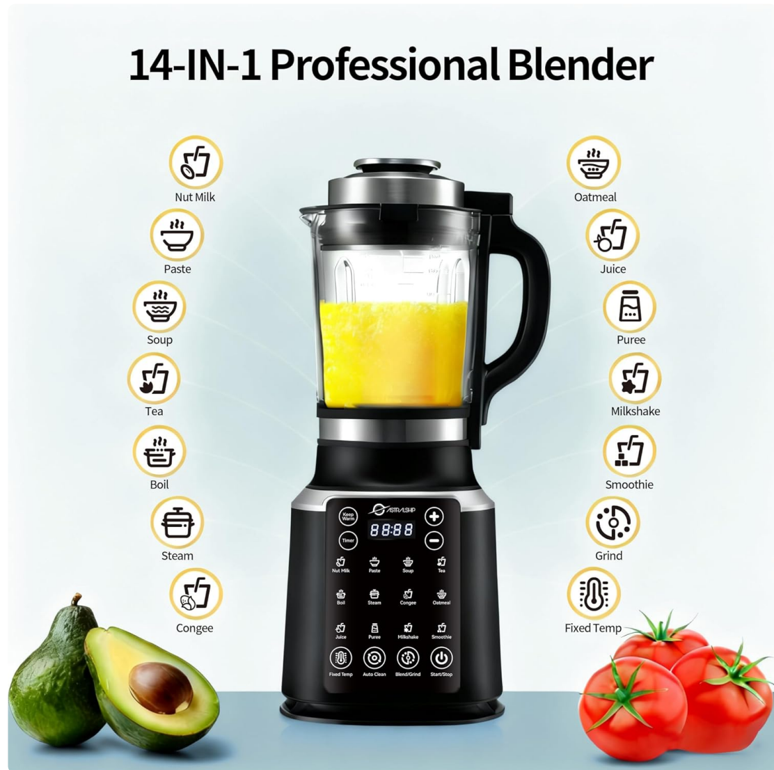
Image: The control panel of the ASTRALSHIP ASH01-B Blender displaying various preset functions like Nut Milk, Paste, Soup, Baby Food, Boil, Steam, Congee, Oatmeal, Juice, Puree, Milkshake, and Smoothie.

The ASTRALSHIP ASH01-B Blender features a touch control panel with 14 preset programs and adjustable manual speeds (P1-P9).