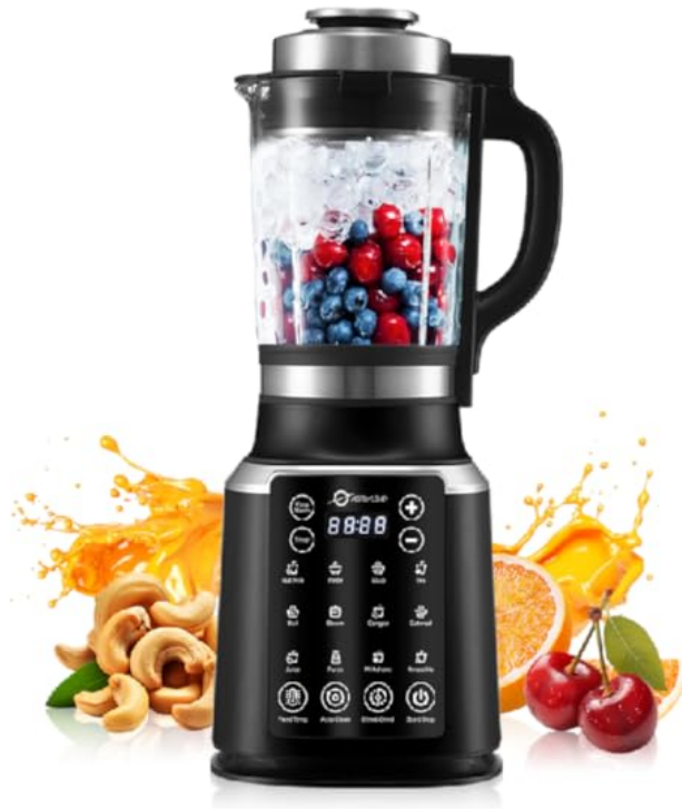
Image: The ASTRALSHIP ASH01-B Blender with its tamper, used for pushing down ingredients during blending, especially for thick or frozen recipes.