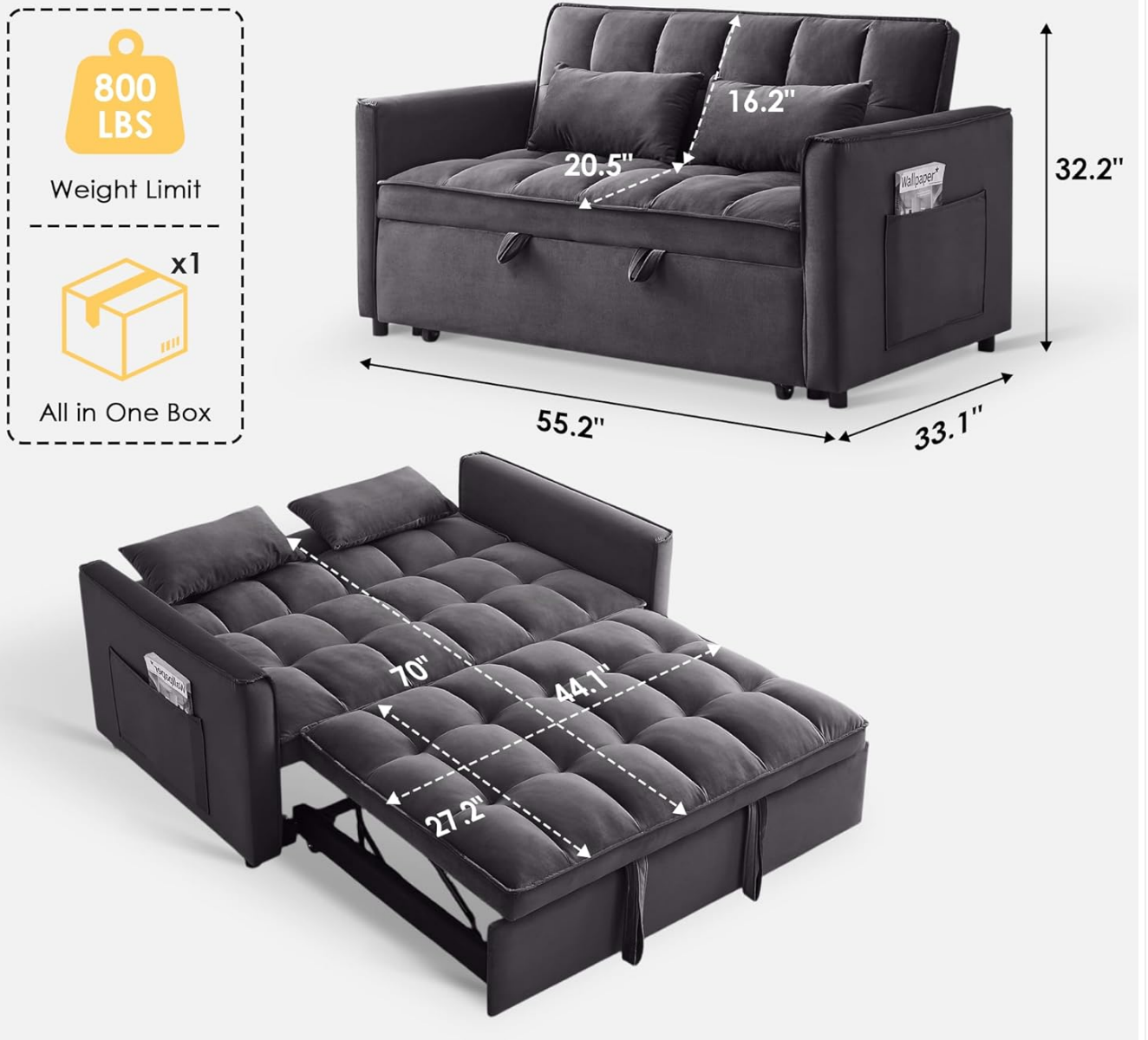
Image 4.1: Product dimensions for planning placement and assembly.