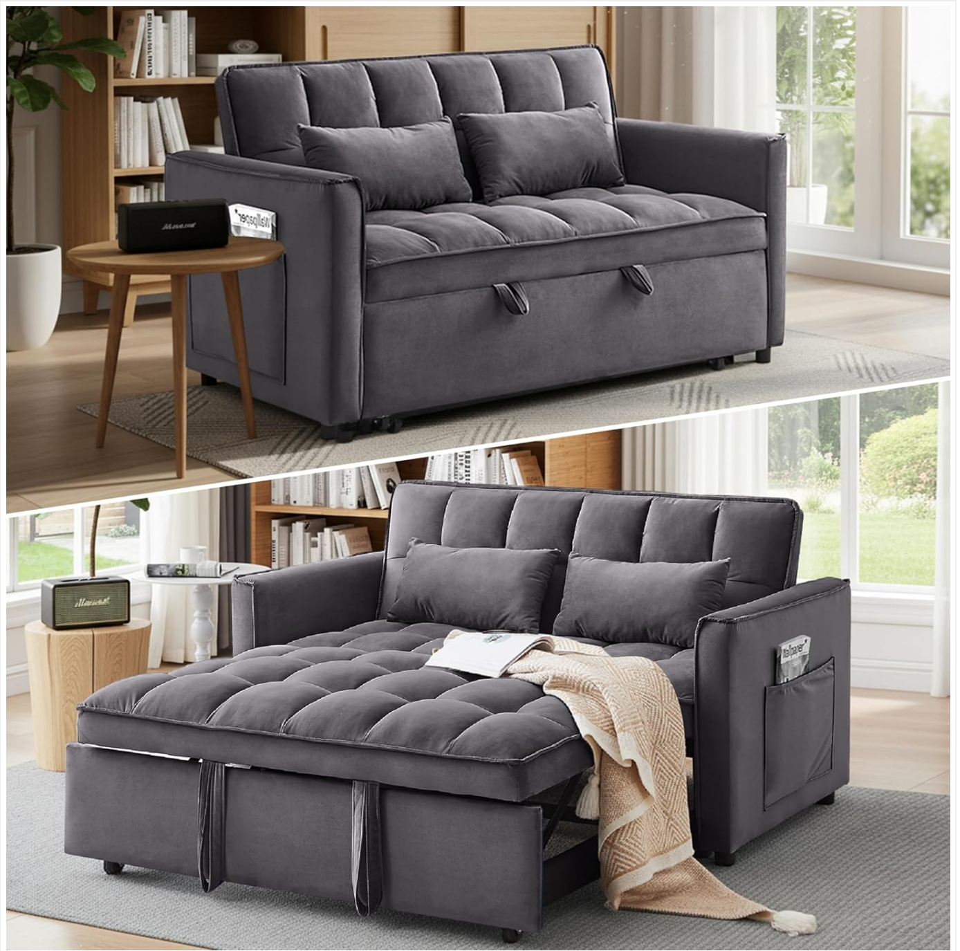
Image 1.1: The Dreamzie Convertible Sleeper Sofa Bed shown as a sofa and extended into a bed.