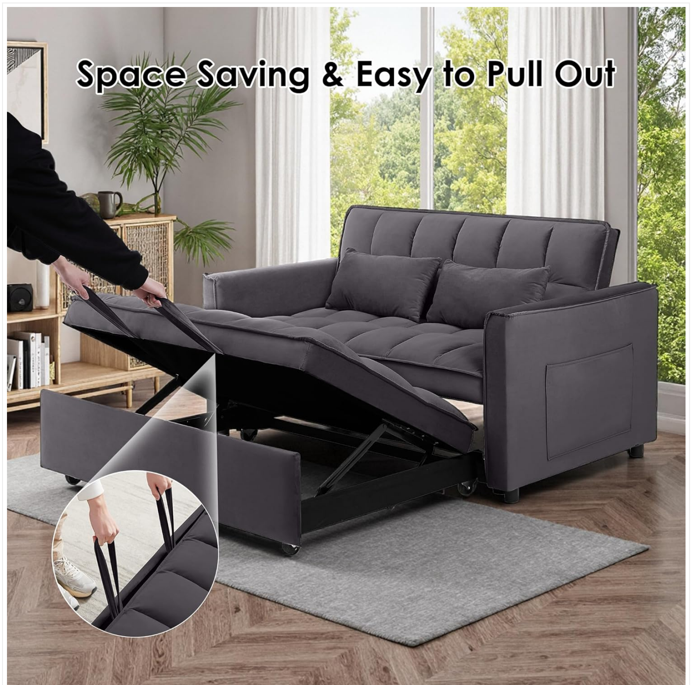
Image 5.1: Extending the sofa into a bed using the pull-out mechanism.