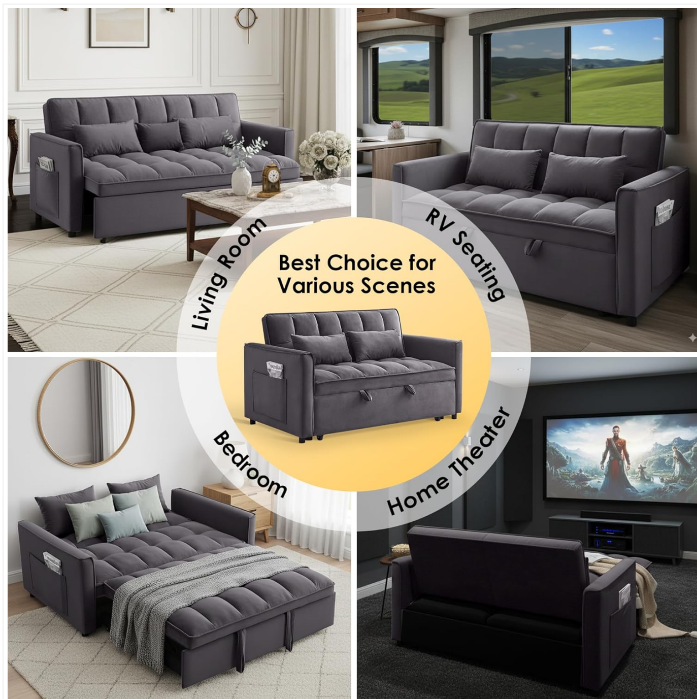
Image 5.3: Side storage pocket for convenient access to small items.