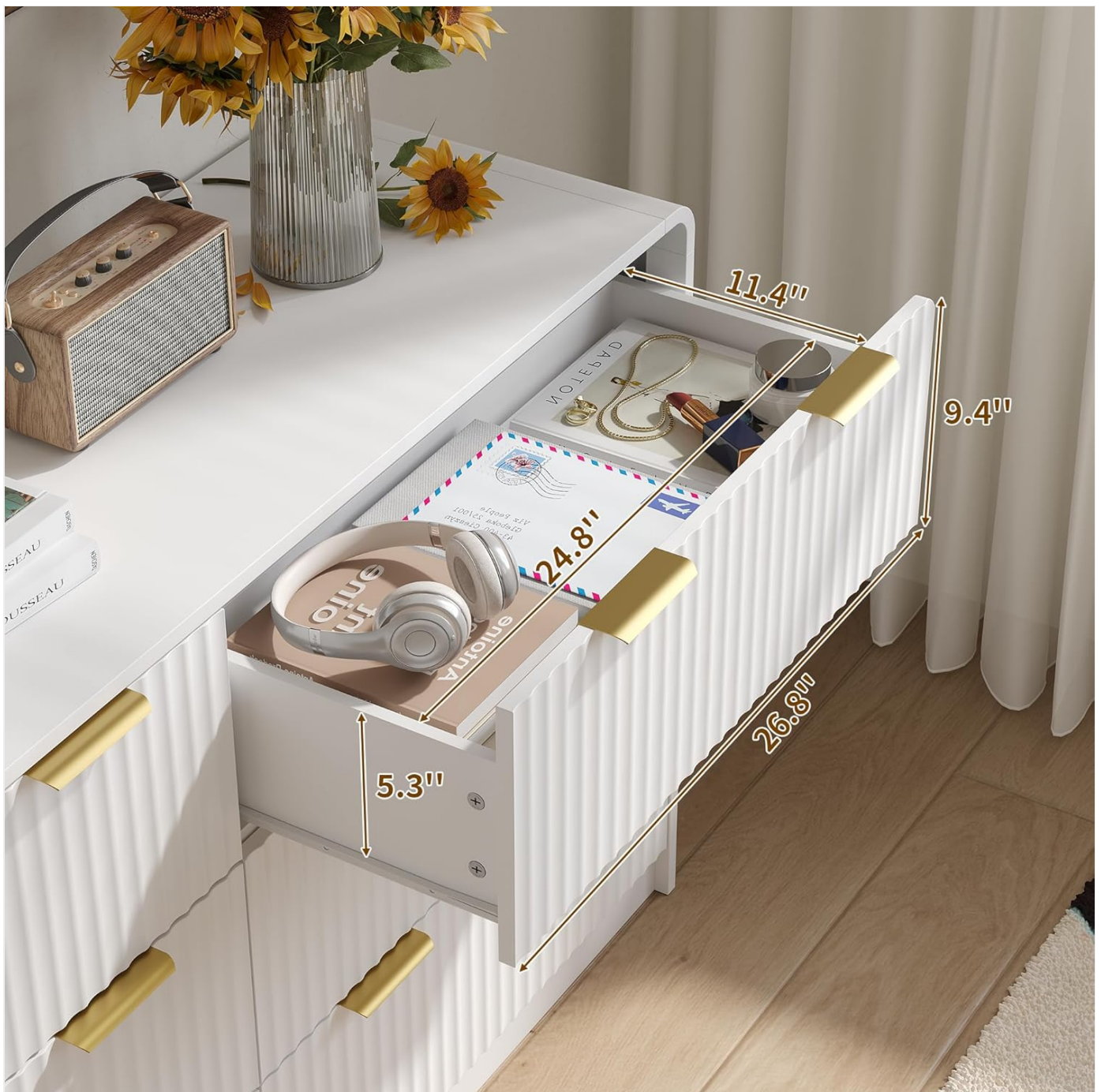
Figure 5: Detailed view of drawer interior dimensions.