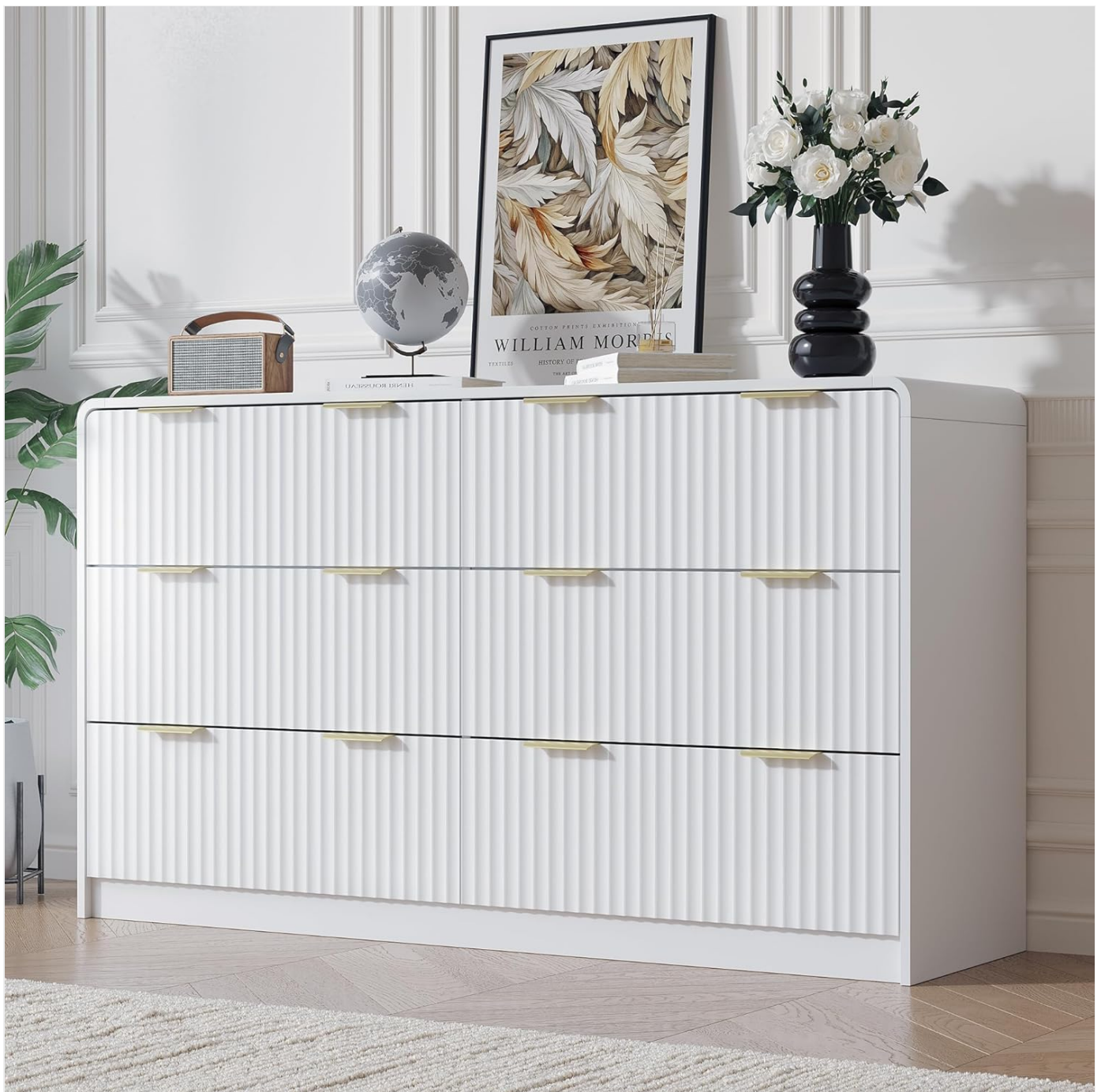
Figure 6: The HOUROM dresser in a typical room setting.