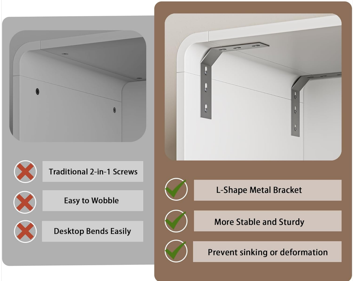
Figure 2: Illustration of the L-shape metal bracket design for improved stability.