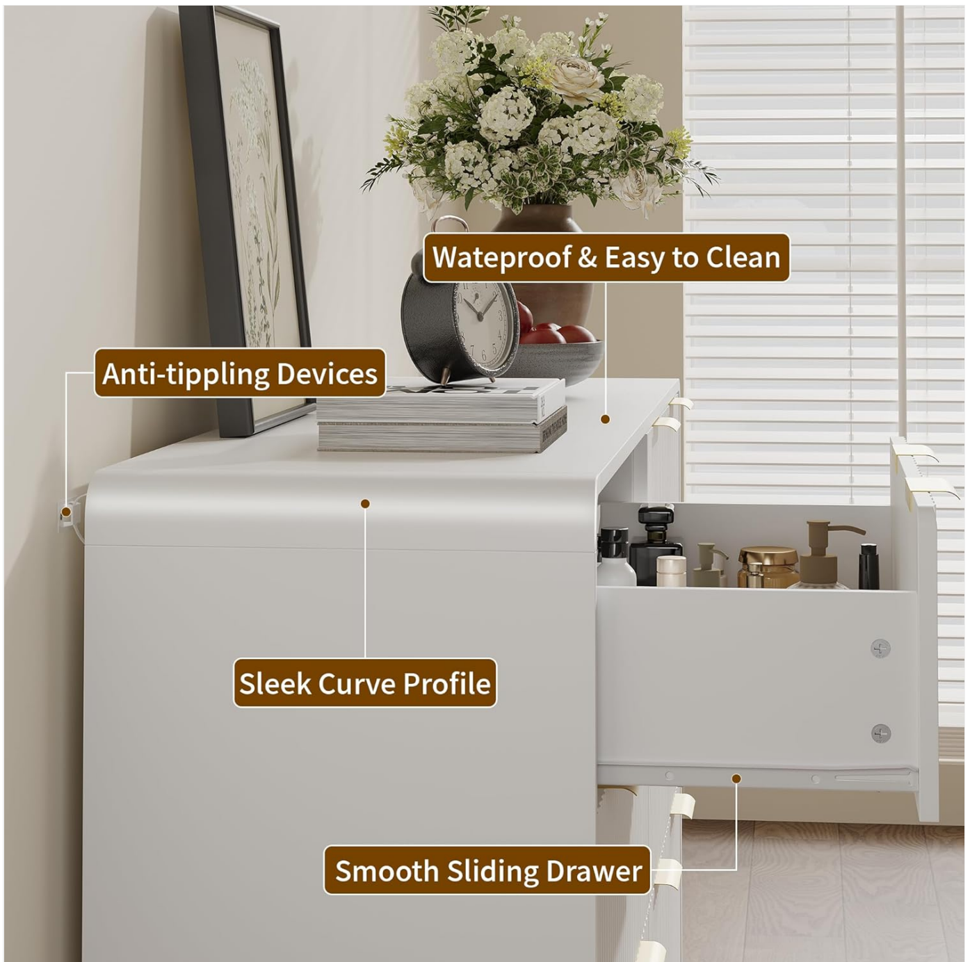
Figure 1: Key features including the anti-tipping device for enhanced safety.