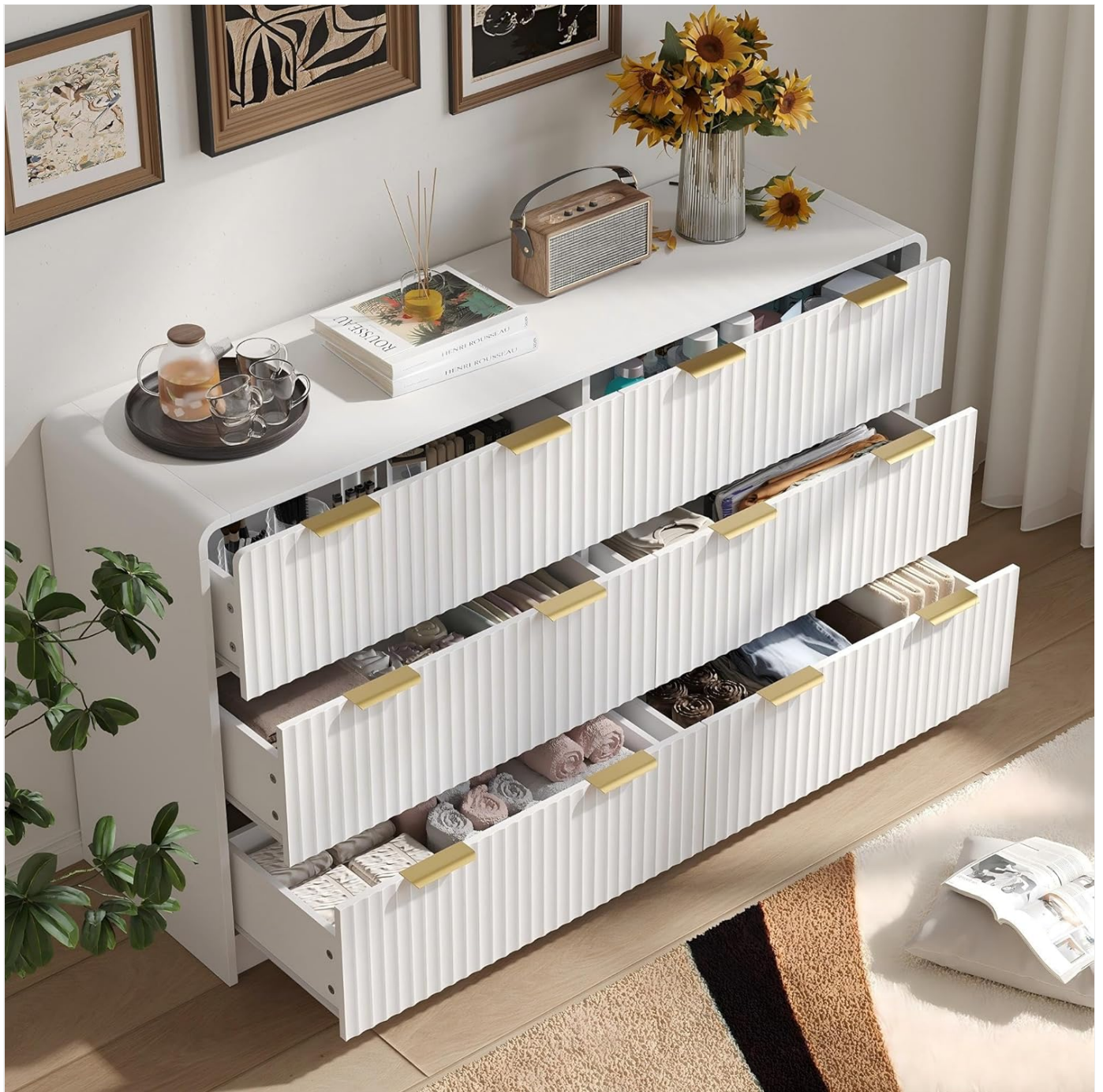
Figure 4: Dresser with drawers open, demonstrating storage capacity.