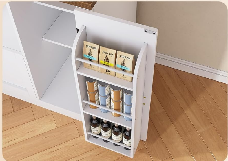
Figure 7: Sliding drawer and door shelves for convenient storage.