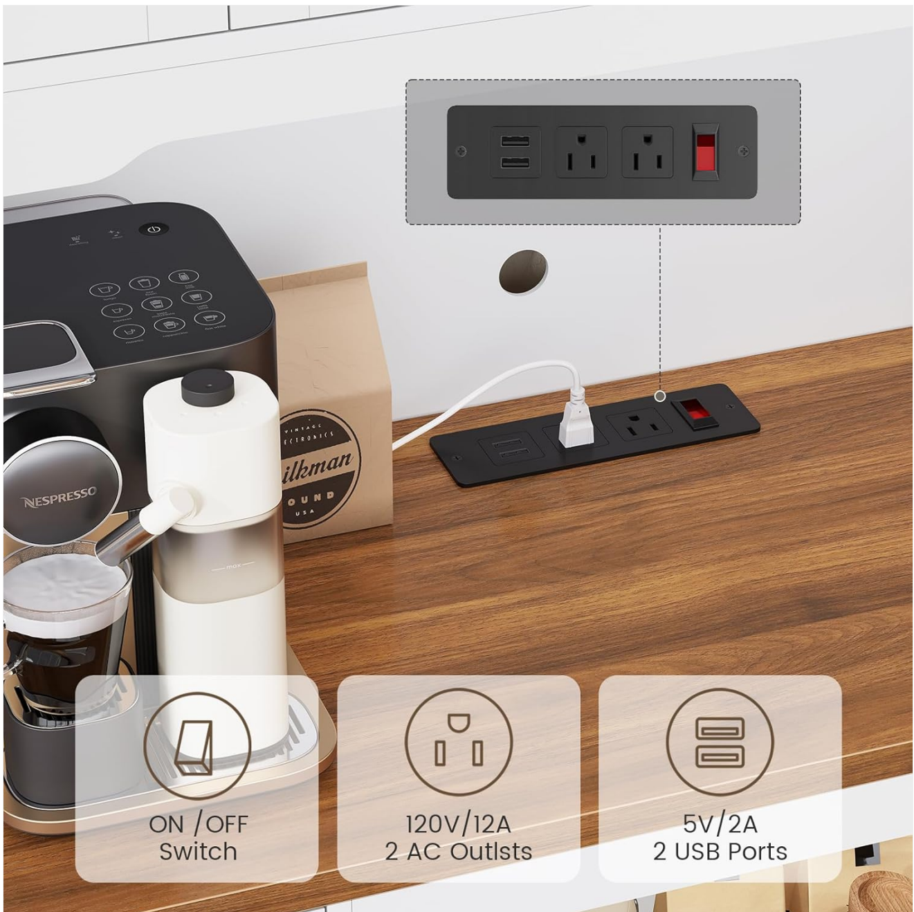
Figure 4: Integrated charging station with power outlets and USB ports.