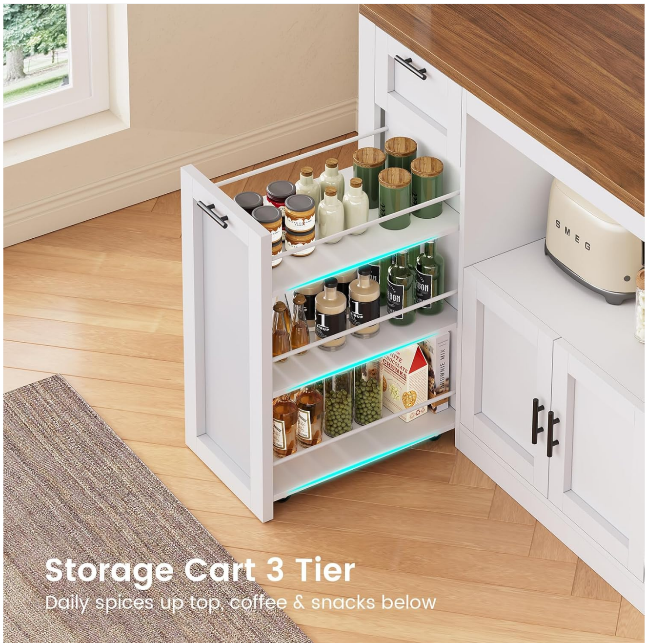
Figure 6: The mobile 3-tier storage cart.