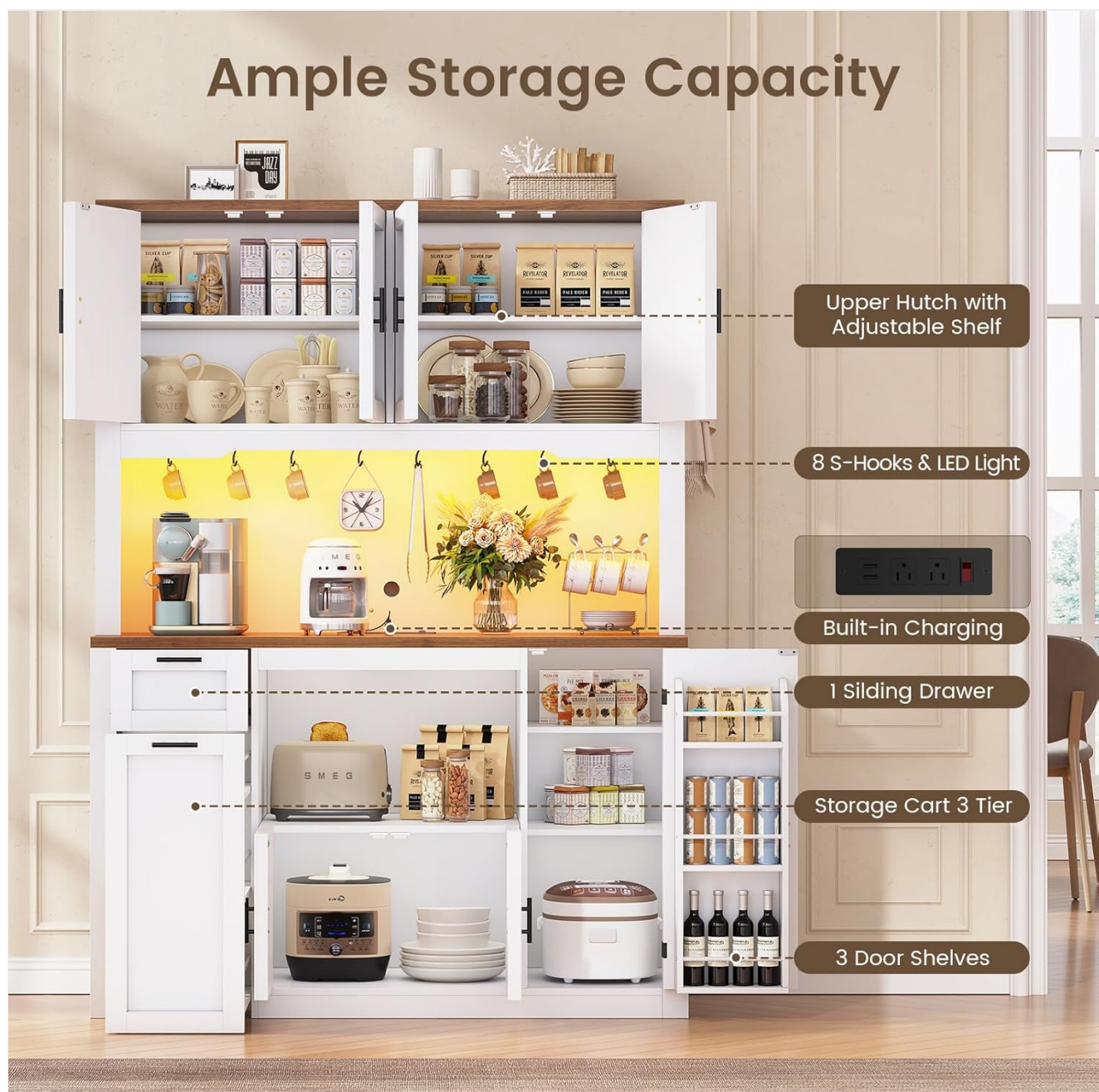
Figure 2: Key storage features of the pantry cabinet.