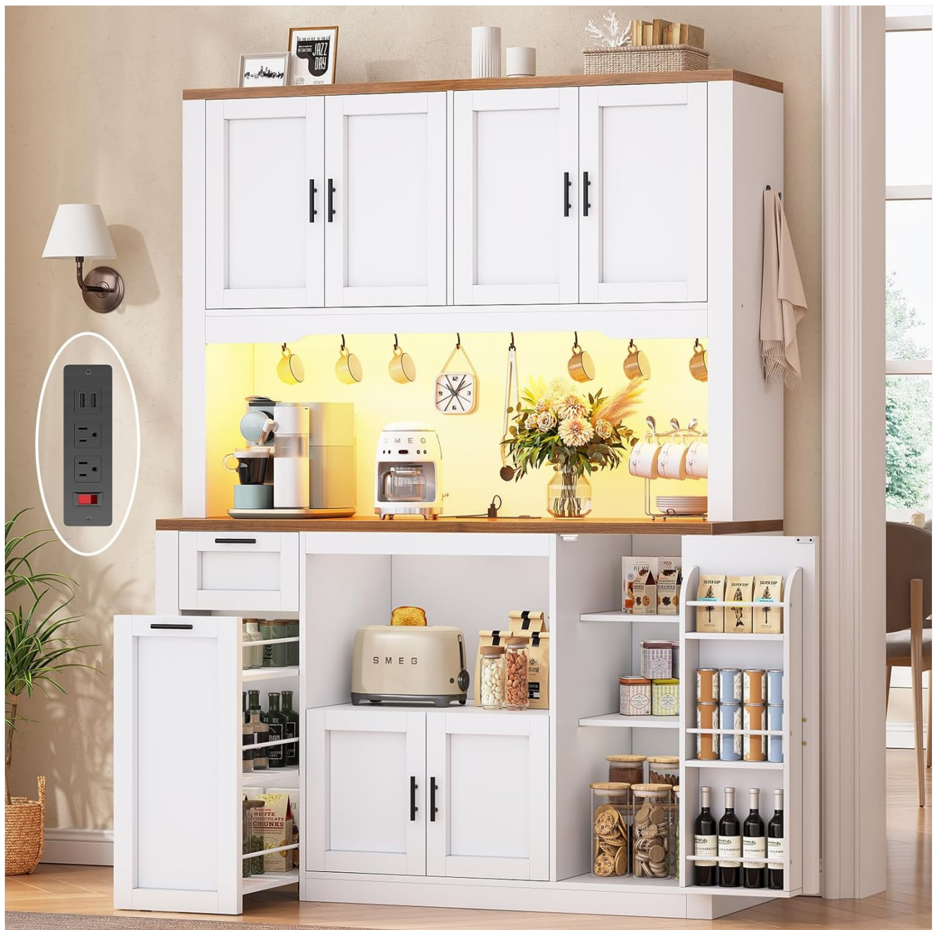
Figure 1: Overview of the Itaar 71-inch Pantry Cabinet.