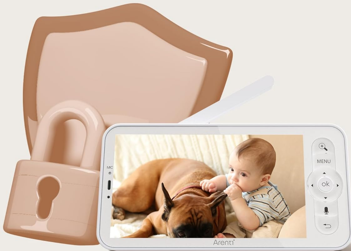
Image: An illustration highlighting secure encrypted transmission, featuring an AES 128 Security Chip, encrypted backup, and access records viewing.