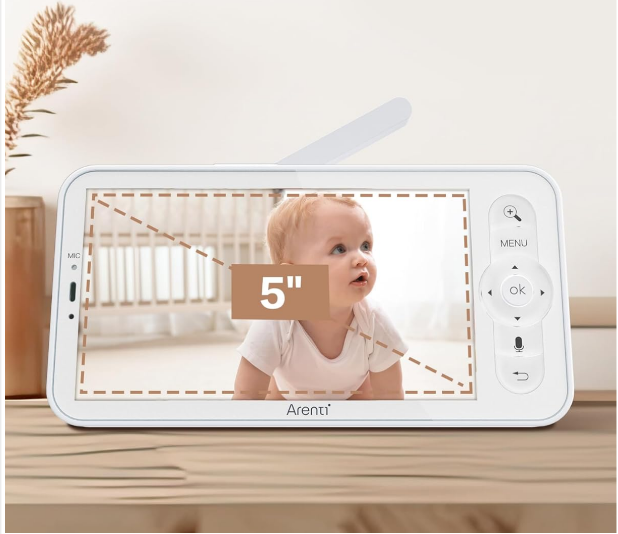
Image: The 5-inch LCD screen of the ARENTI B2 Baby Monitor, highlighting its size for detailed viewing.