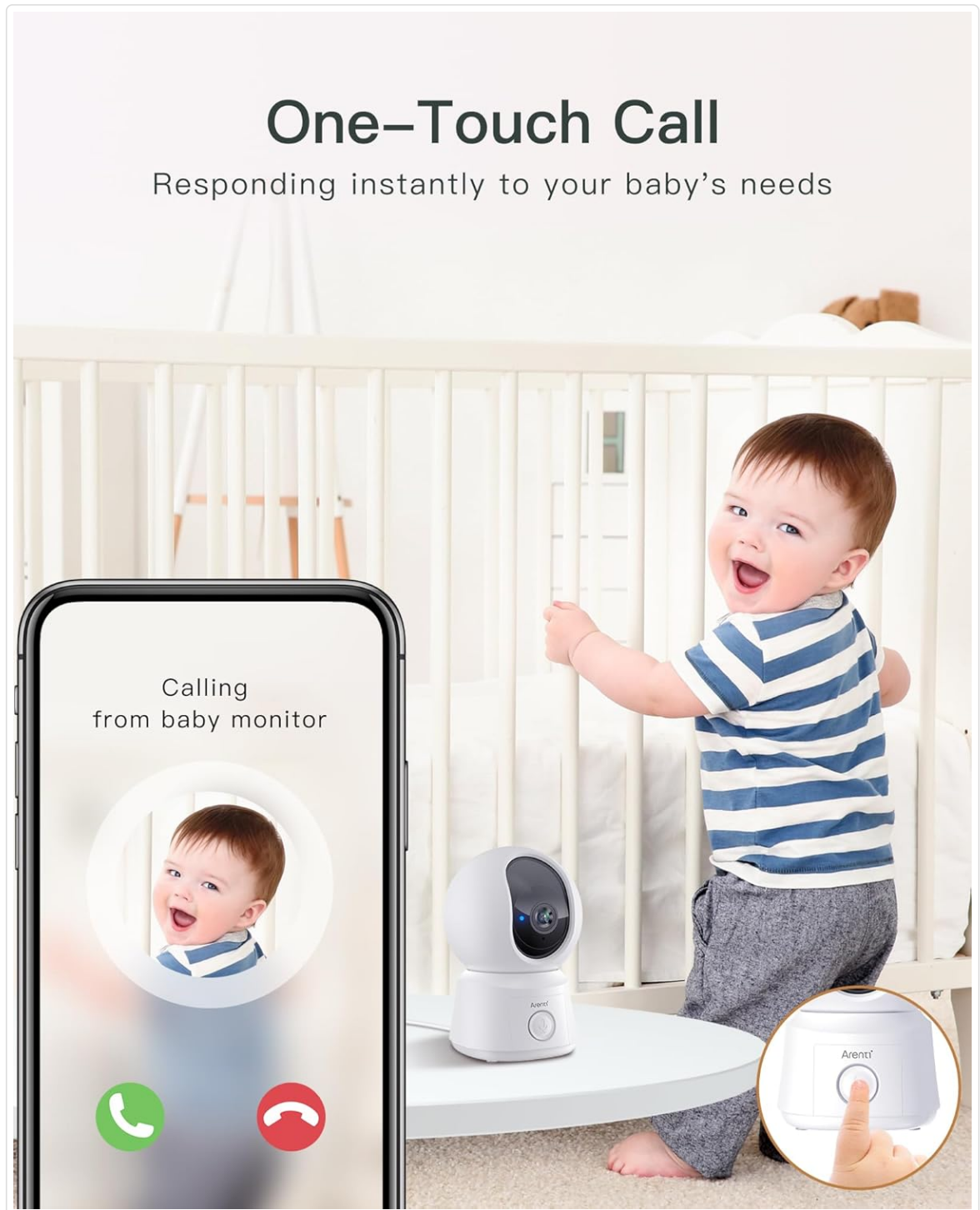
Image: A smartphone displaying an incoming call from the baby monitor, illustrating the One-Touch Call feature.