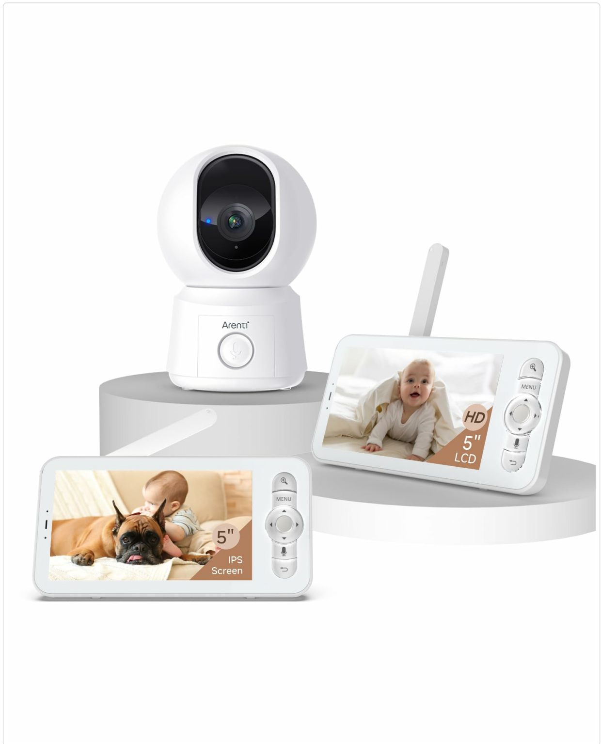
Image: The ARENTI B2 Baby Monitor camera and screen, illustrating features like temperature sensing, lullabies, and white noise for enhanced care.