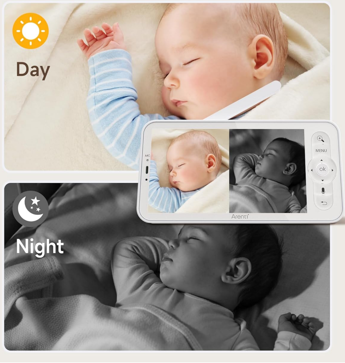
Image: The monitor displaying both day (720P HD) and night vision views of a baby, demonstrating clear visibility in all lighting conditions.