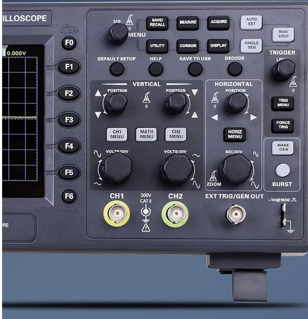
Figure 4.5: Close-up of the Hantek DSO2D15 control panel, highlighting the "SAVE/RECALL" and "SAVE TO USB" buttons for saving settings, waveforms, reference waveforms, CSV images, and other data formats.

Save settings, waveforms, reference waveforms, CSV images, and other data formats