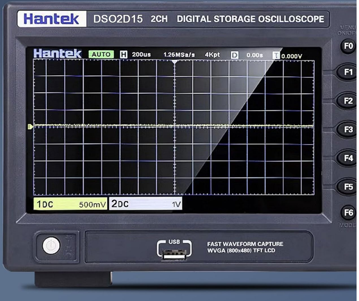
Figure 4.4: The Hantek DSO2D15 screen showing the results of 32 automatic measurement and statistical functions, providing real-time statistics such as maximum, minimum, and standard deviation.

32 automatic measurement and statistical functions, real-time statistics of maximum, minimum, standard deviation, and other statistical information