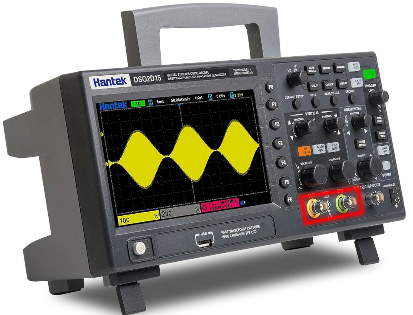
Figure 4.2: Display illustrating the dual-channel capability of the Hantek DSO2D15, with independent knob control for each channel.