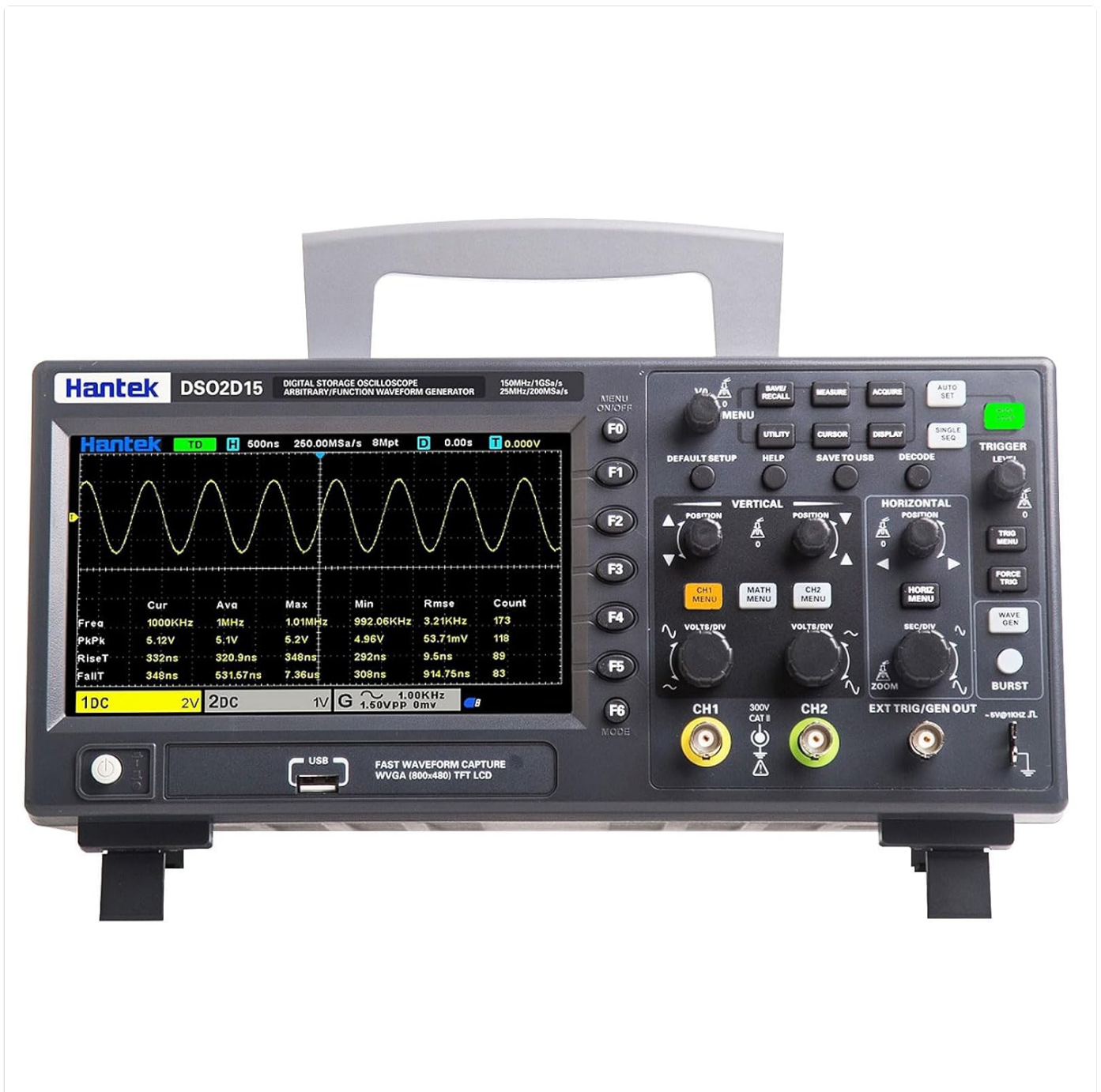
Figure 1.1: Front view of the Hantek DSO2D15 Digital Oscilloscope, showing the display, control panel, and input ports.