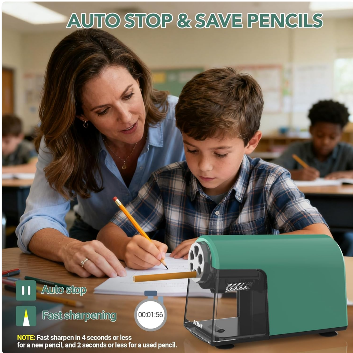
Image: The sharpener in action, highlighting its speed and auto-stop function.