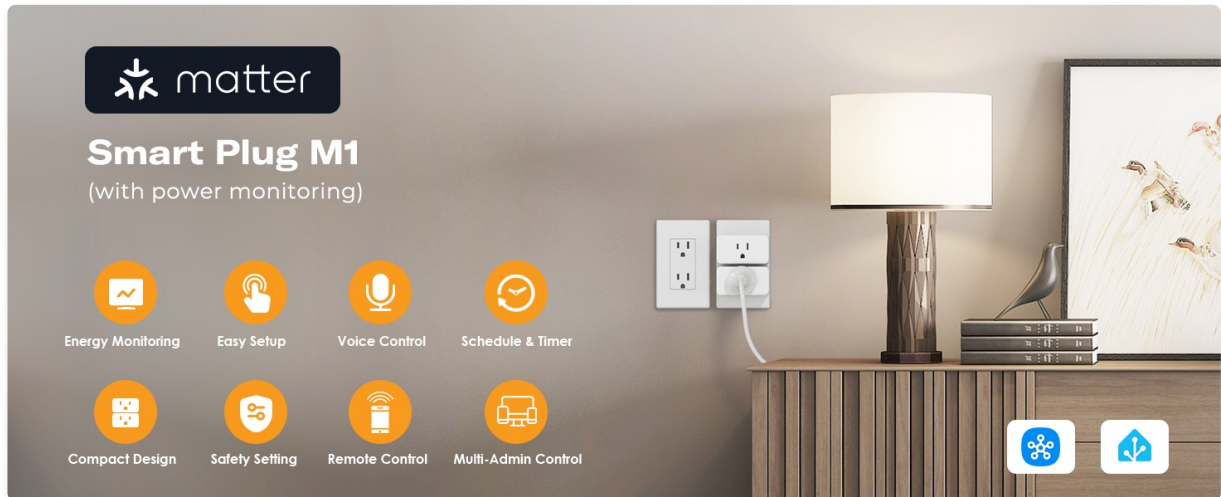
Image: Overview of Matter certification benefits including wide compatibility and enhanced security.

The THIRDREALITY Smart Plug M1 is a Matter-certified smart outlet designed for seamless integration into your smart home ecosystem. It offers real-time energy monitoring, a compact design, and broad compatibility with various smart home platforms. This manual provides detailed instructions for setting up, operating, and maintaining your Smart Plug M1.