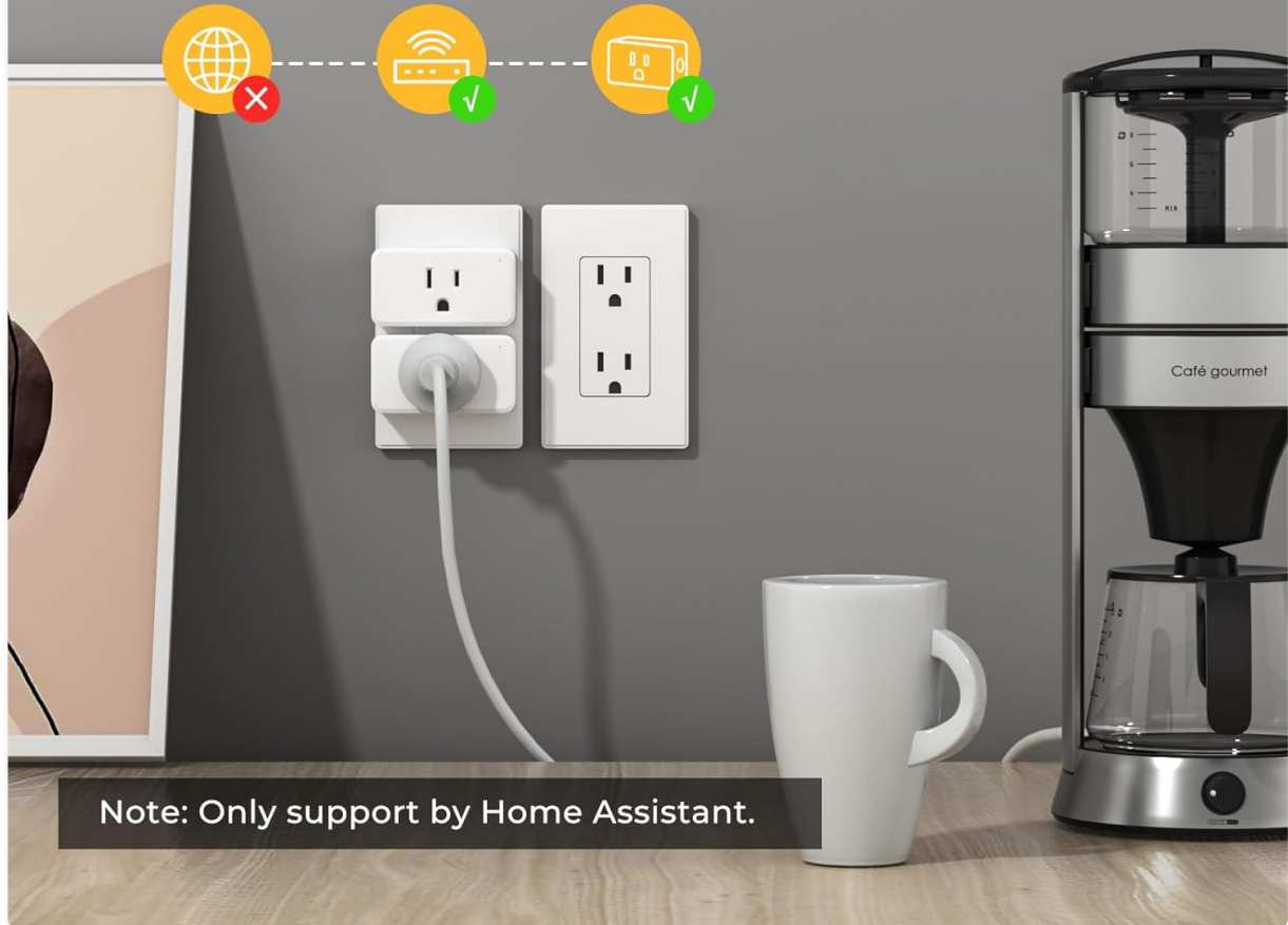
Image: The compact Smart Plug M1 being plugged into an outlet, designed not to block adjacent outlets.

Reliable Local Control Works seamlessly even the network is offline