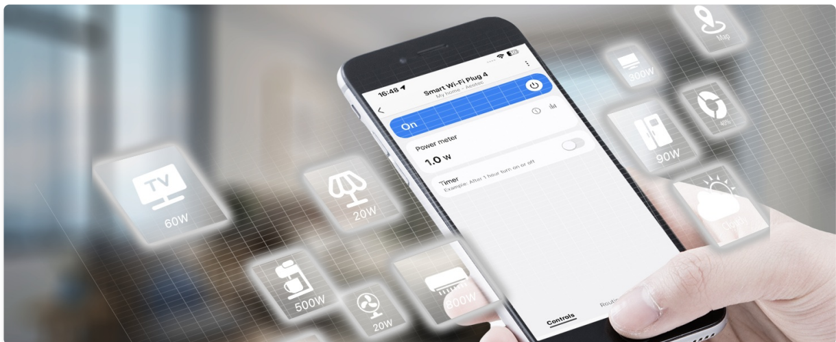
Image: Local control functionality, allowing operation even without an internet connection (Home Assistant only).

Powered by Matter over Wi-Fi, the Smart Plug M1 executes commands instantly through your local network. For Home Assistant users, this means control functions can operate even without an internet connection. Remote access is available from anywhere via your smartphone app or voice control through Matter admin to smart speakers (Alexa/Google Assistant/Siri).