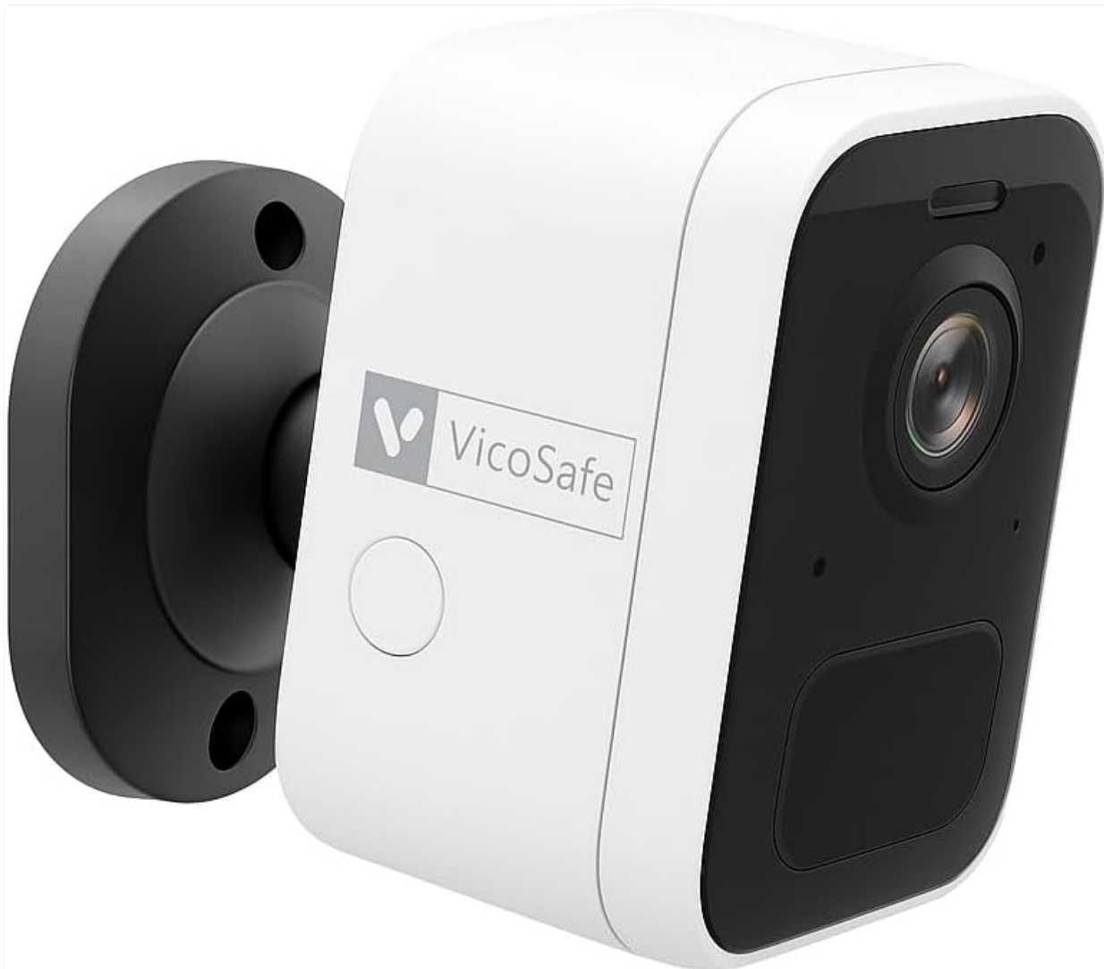
Front view of the VicoHome BC1 camera, showing the lens, PIR sensor, and status LED.

Familiarize yourself with the various parts of your VicoHome BC1 camera.