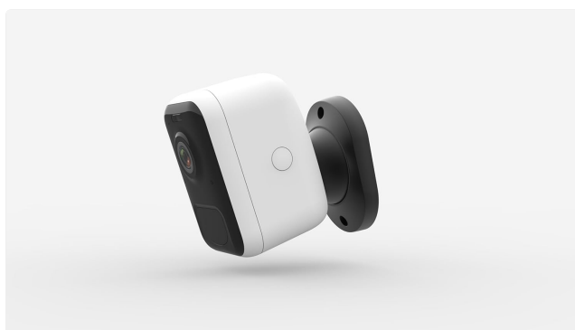
The VicoHome BC1 camera securely mounted to a wall, demonstrating its outdoor placement capability.