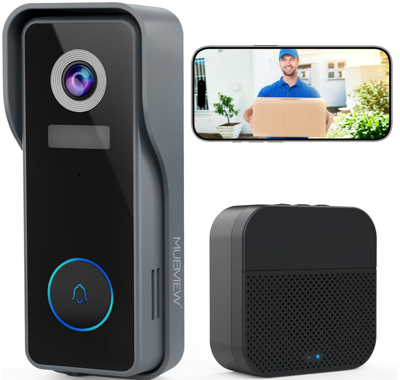
Image: Front view of the MUBVIEW Bell J7 doorbell and chime.