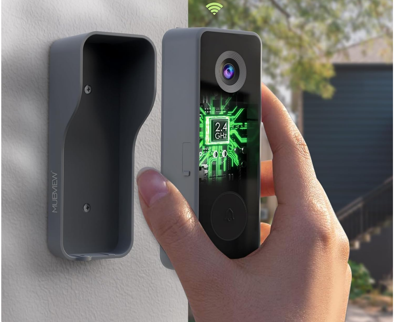
Image: Installation of the MUBVIEW Bell J7 doorbell camera onto its mounting bracket.

No Wires Needed Smooth 2.4GHz Connection