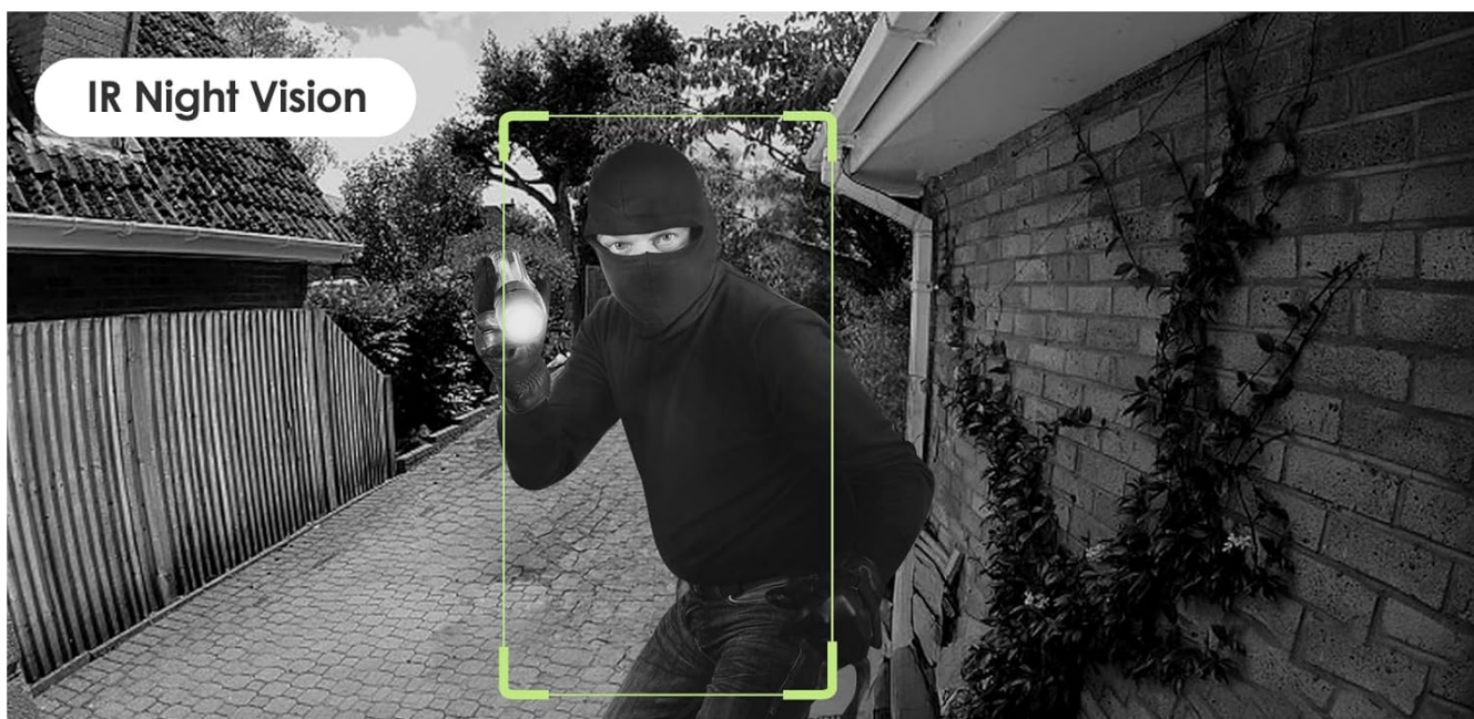
Image: Day and night vision capabilities of the MUBVIEW Bell J7 doorbell.