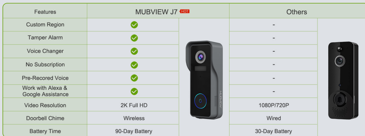
Image: Overview of MUBVIEW Bell J7 features.