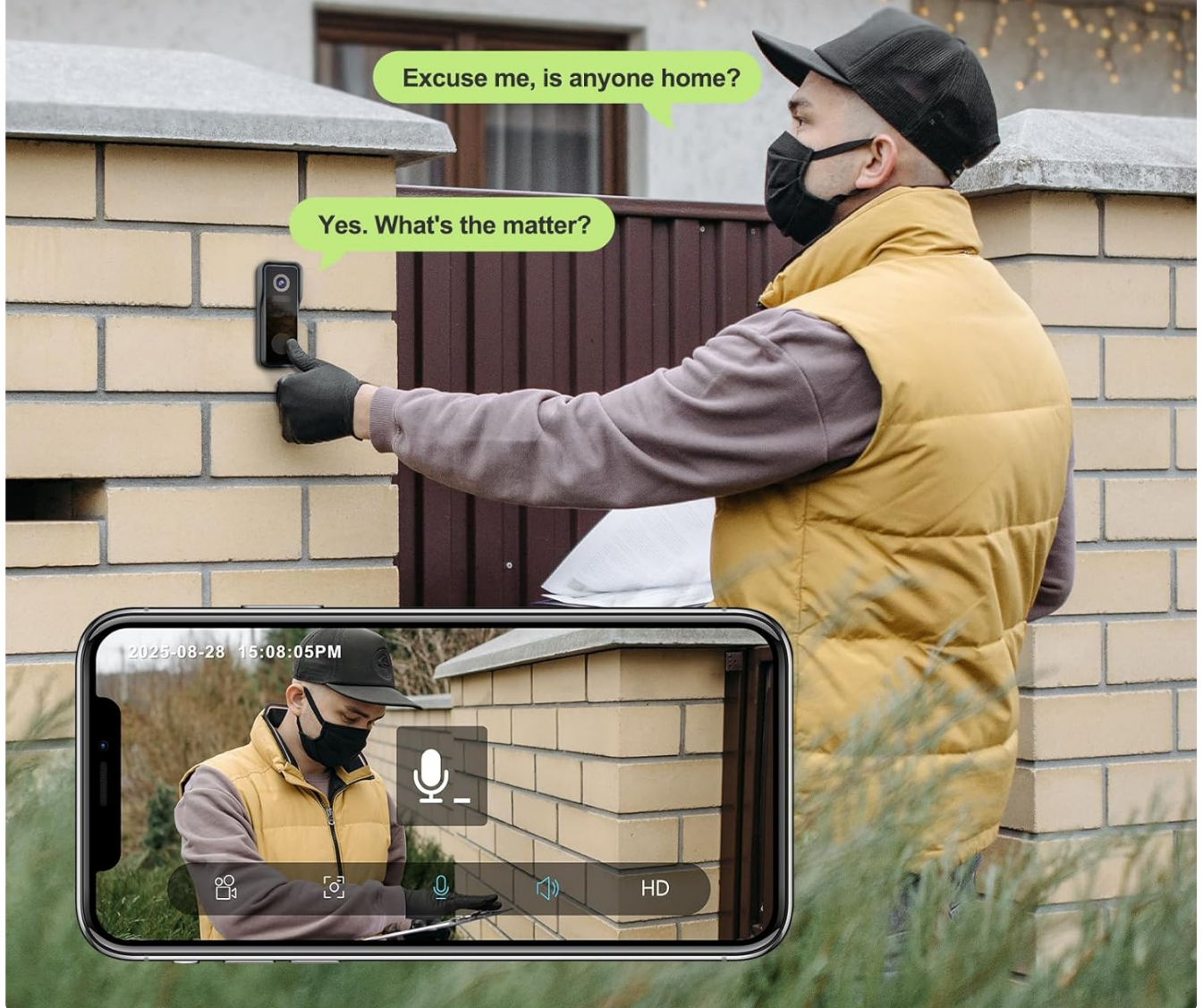
Image: Demonstrating two-way audio and voice message functionality via the app.