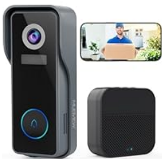
Image: MUBVIEW Customer Service details.

For detailed contact information, please visit the official MUBVIEW website or refer to the contact details provided in the product packaging.