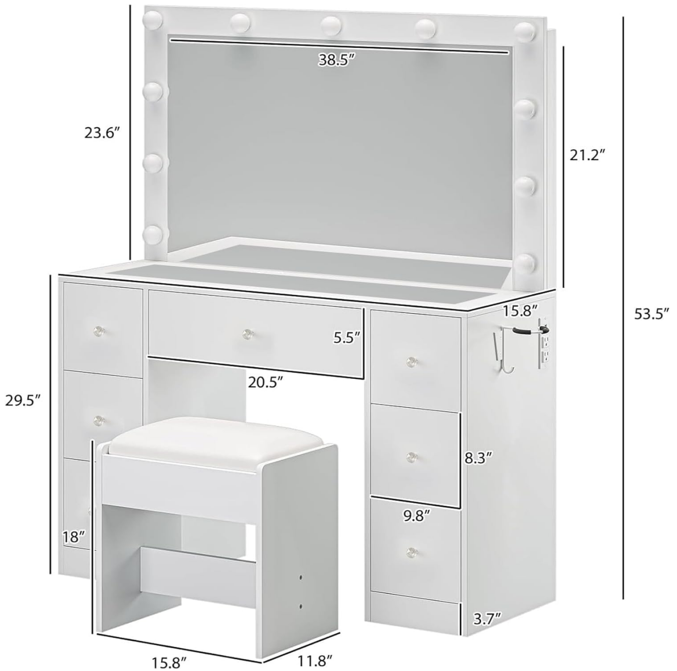
Image: Detailed dimensions of the vanity desk, mirror, and stool, indicating overall height of 53.5 inches, desk width of 43.3 inches, and depth of 15.8 inches.