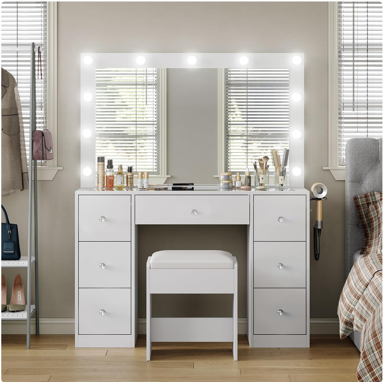
Image: The CollaredEagle Vanity Desk with Mirror, featuring a large mirror with Hollywood-style lights, a transparent tabletop, and multiple drawers, accompanied by a cushioned stool.