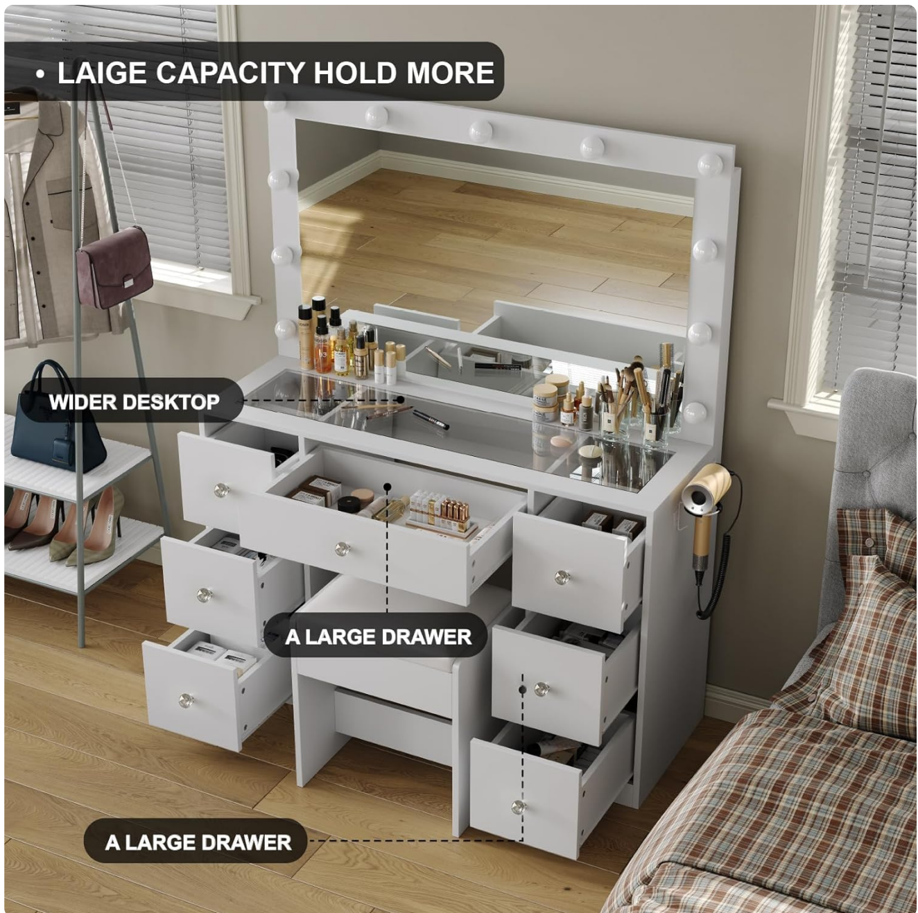
Image: The vanity desk with several drawers pulled open, showcasing the ample storage capacity for various items like cosmetics, brushes, and personal accessories.