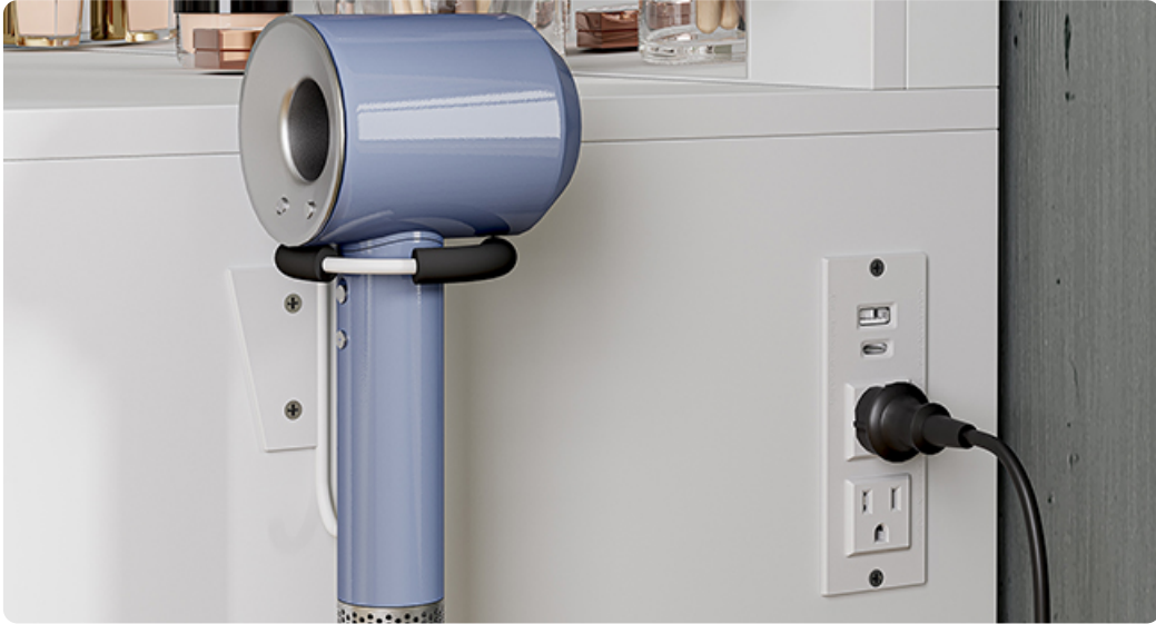
Image: Close-up view of the integrated power outlet on the side of the vanity, showing two AC sockets, a USB port, and a Type-C port, alongside a mounted hair dryer holder.