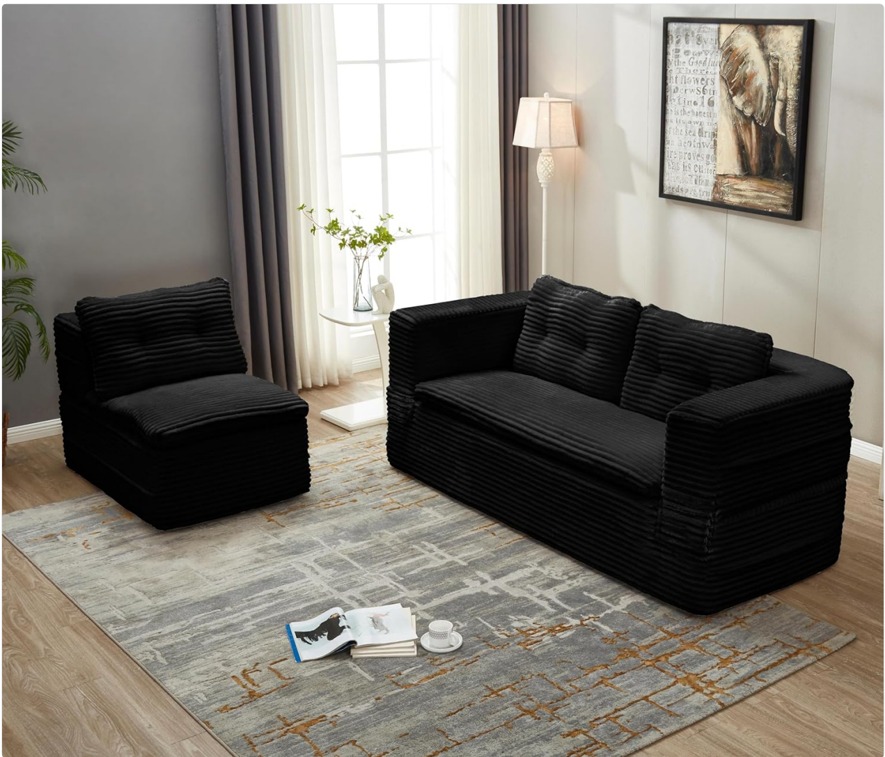
Image: The Polibi Convertible Sofa Bed and independent chaise in a living room setting.