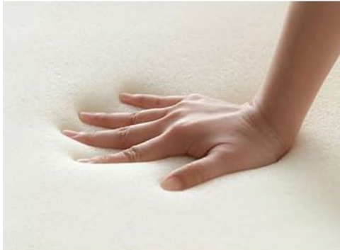
Fully silent high-resilience sponge

Made of velvet fabric and 100% high-density sponge for one-piece filling - no springs, no pressure, balanced support, completely silent design, no spring creaking when getting up or turning over, no disturbance to family sleep.