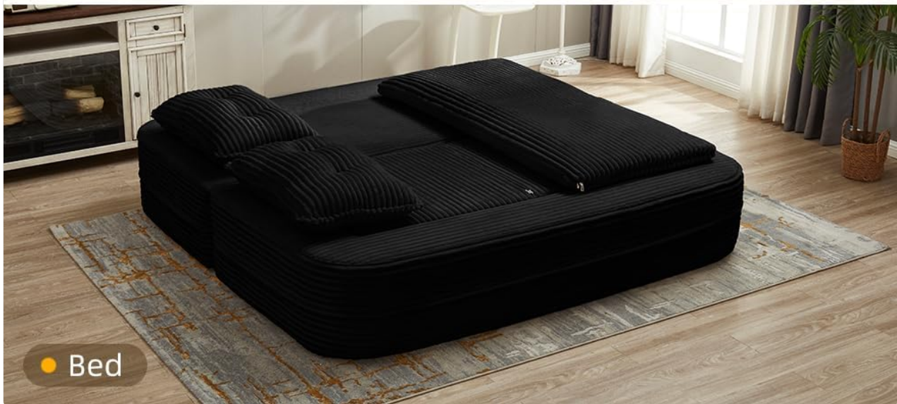
Image: The sofa and chaise configured as a sectional sofa and then transformed into a king-size bed.

Your browser does not support the video tag.