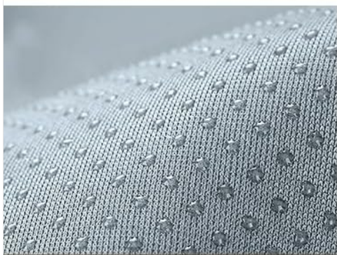
Non-slip base - stays securely in place