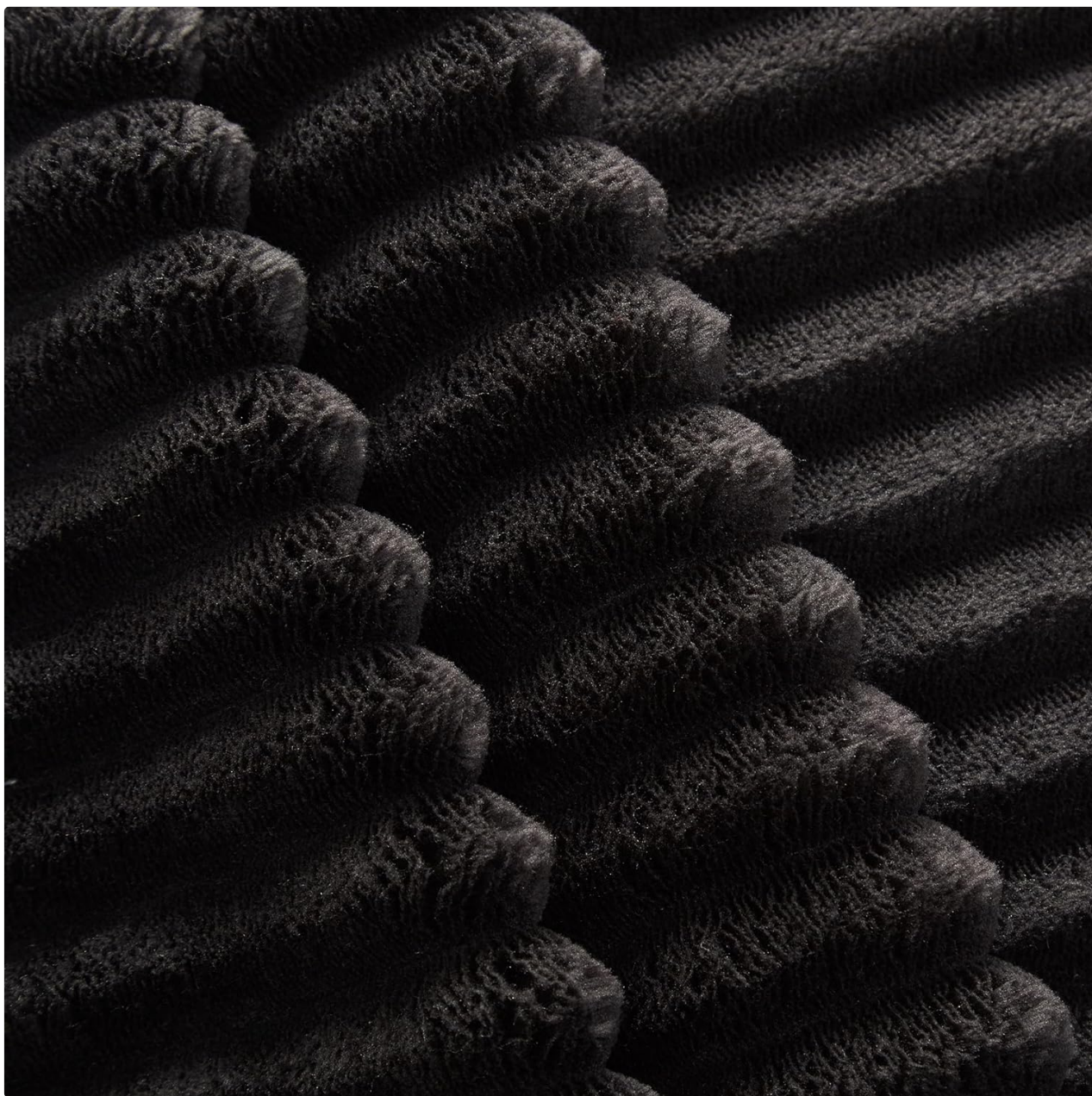
Image: A close-up view of the plush corduroy fabric texture.