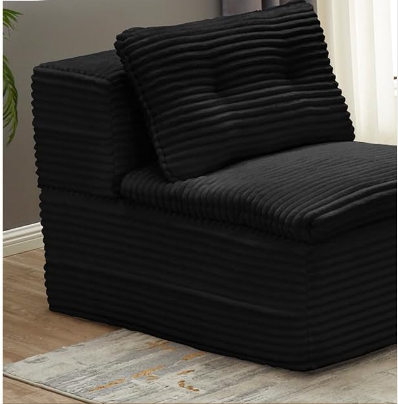
High-density and high-resilience sponge

Image: Details on the high-rebound sponge for comfort and the non-slip base for stability.