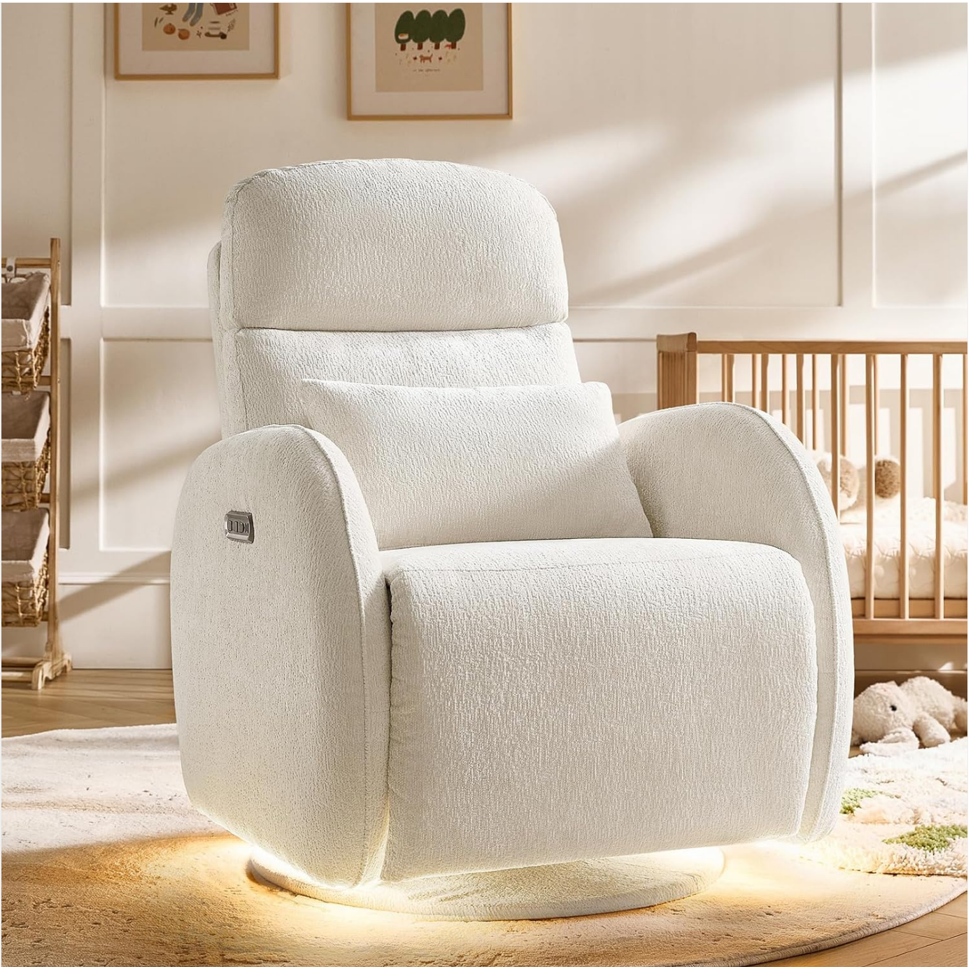
Image: The HULALA HOME RCAL1374 Power Nursery Glider Recliner, showcasing its design and white fabric in a nursery environment.