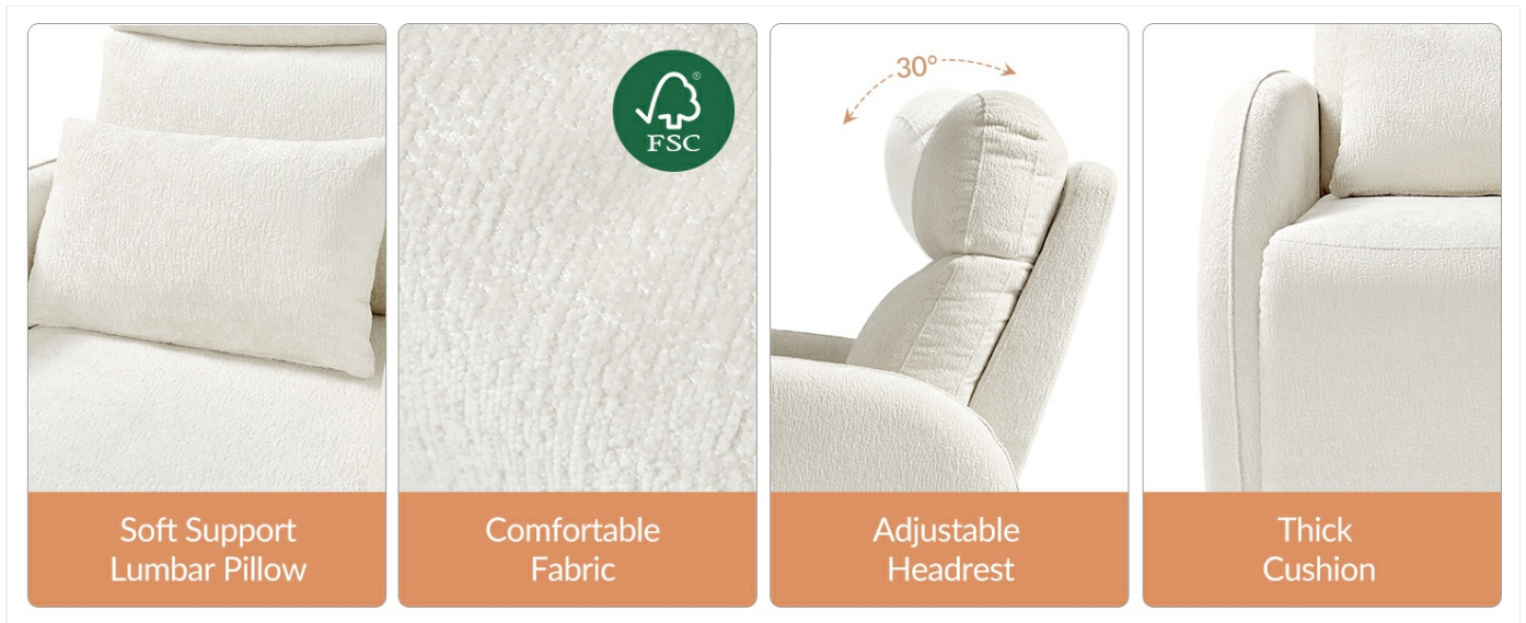
Image: Details of the recliner's features, including the adjustable headrest, comfortable fabric, soft lumbar pillow, and thick cushioning.