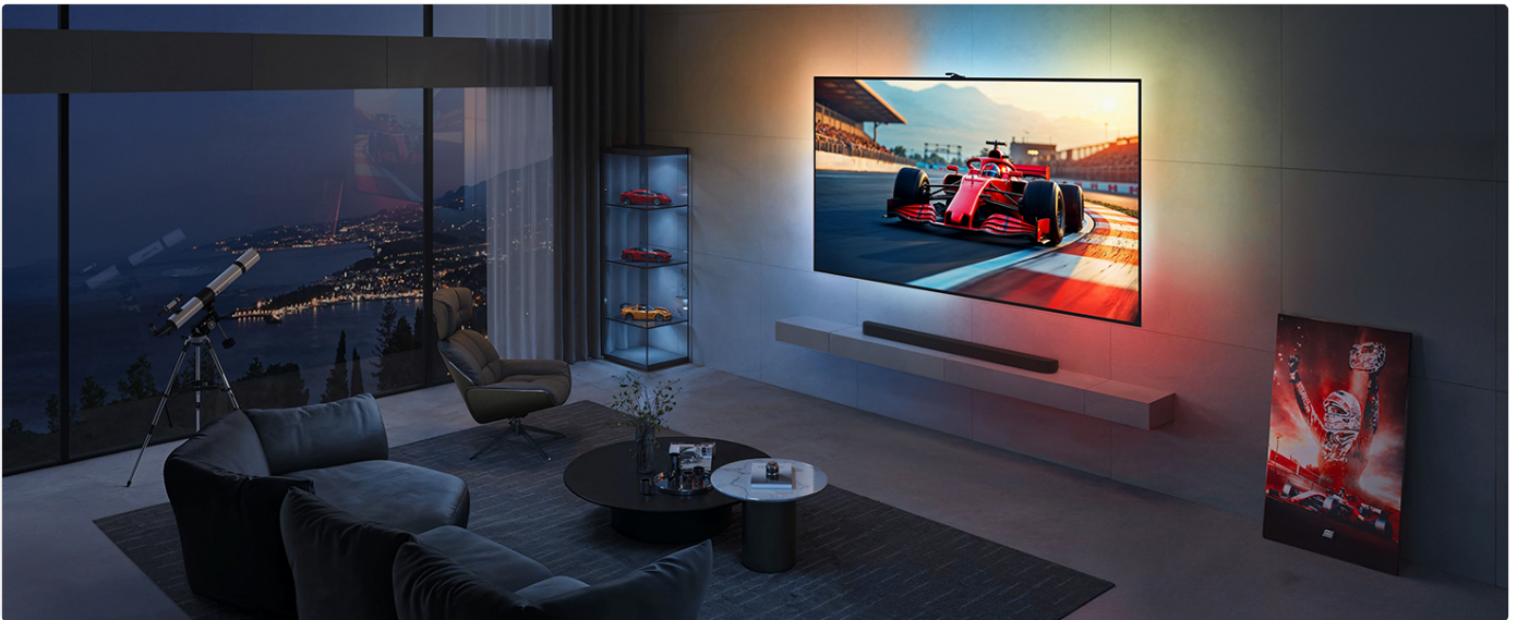
Image: Three versatile zoning modes for customized viewing.