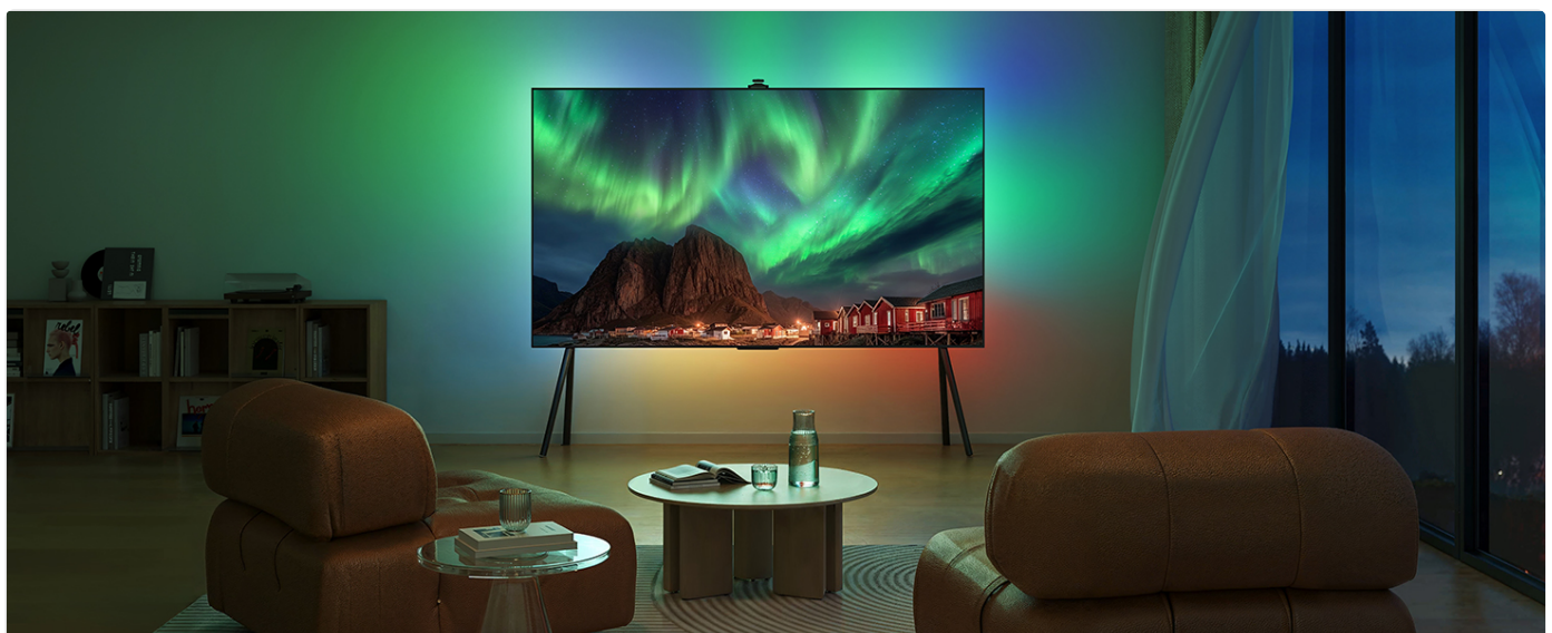
Image: RGBWWIC 5-Way Control for versatile white light.