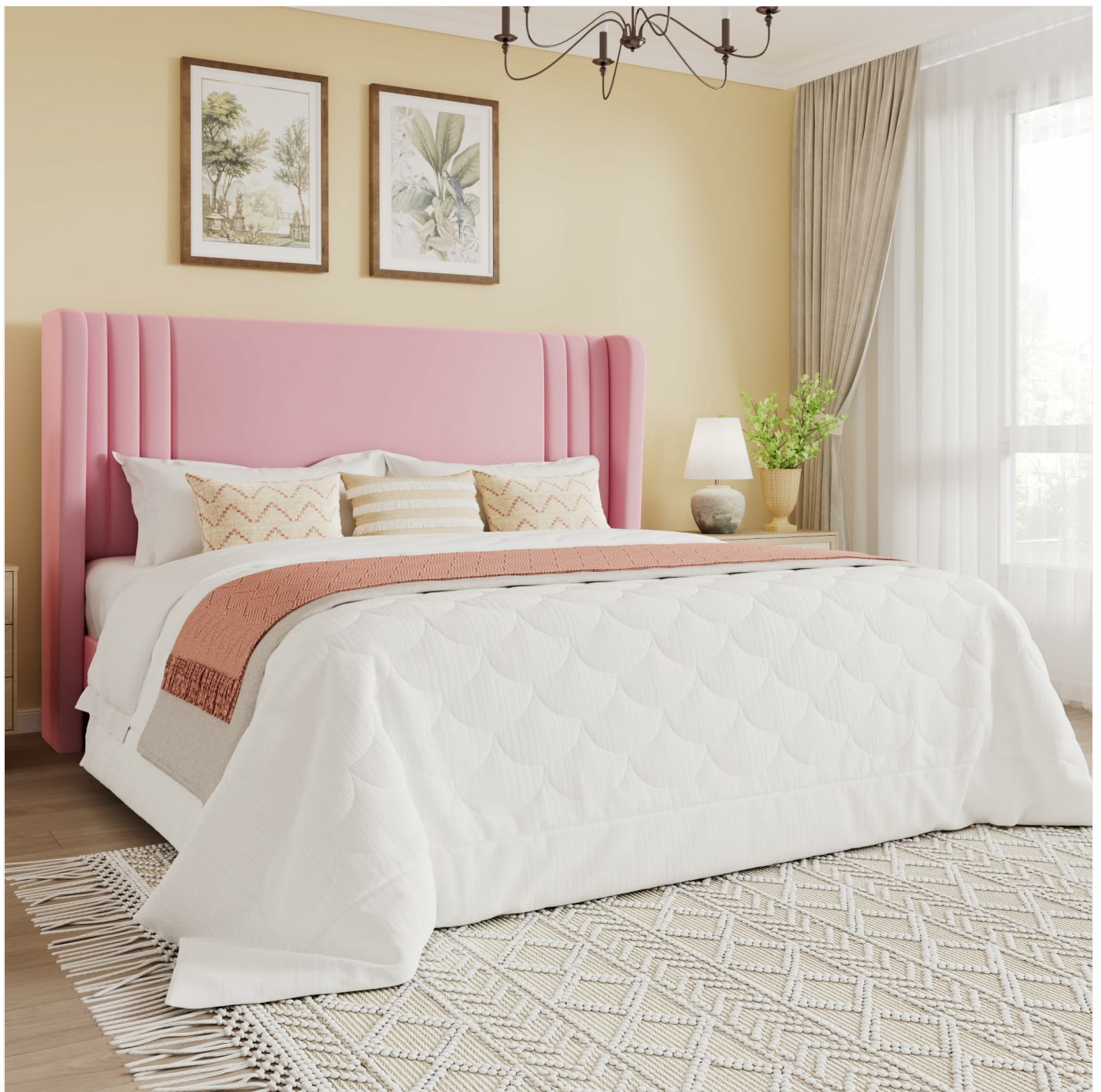
Image: Fully assembled SHA CERLIN Queen Size Velvet Platform Bed Frame with a wingback headboard, shown in a bedroom.