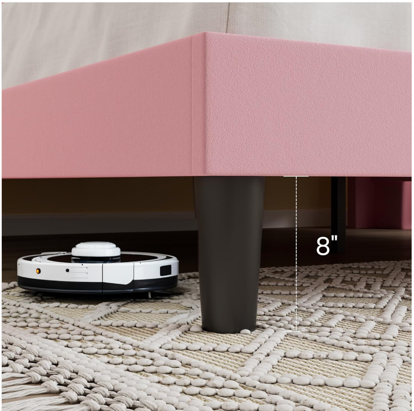
Image: Demonstration of the 8-inch under-bed clearance, suitable for storage or robot vacuum operation.