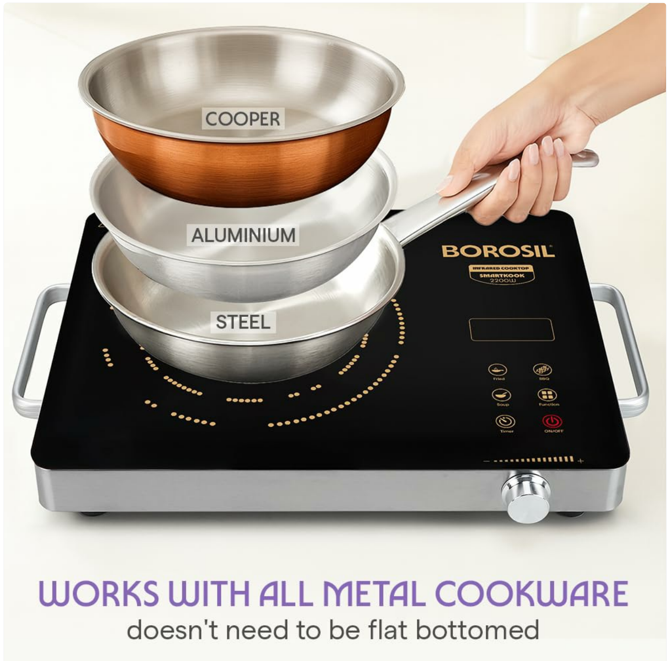
Image illustrating the Borosil Smart Kook Infrared Induction Cooktop's compatibility with various metal cookware types, including copper, aluminum, and steel. The image shows different pots placed on the cooktop.

Unlike traditional induction cooktops, the Borosil Smart Kook Infrared Cooktop works with all types of metal cookware. This includes pots and pans made of copper, aluminum, and steel. Flat-bottomed cookware is not a requirement for this appliance.