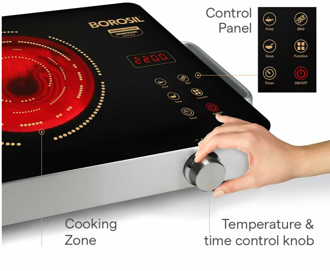
Image showing the Borosil Smart Kook Infrared Induction Cooktop's control panel, cooking zone, and the temperature and time control knob. The control panel features touch buttons for Fried, BBQ, Soup, Function, Timer, and ON/OFF.