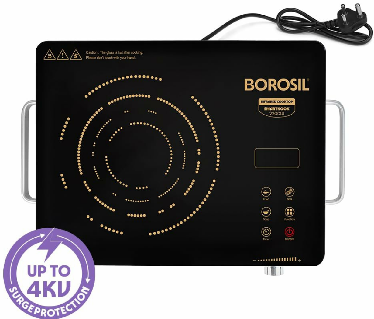
Image of the Borosil Smart Kook Infrared Induction Cooktop highlighting its 'Up to 4KV Surge Protection' feature, ensuring electrical safety.