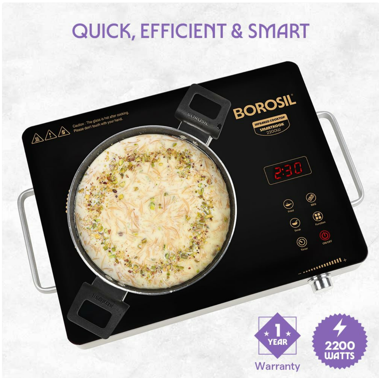
Image of the Borosil Smart Kook Infrared Induction Cooktop in operation, displaying a dish being cooked in a pan. The digital display shows '2:30', indicating a timer or cooking duration. The image also highlights the 1-year warranty and 2200W power.