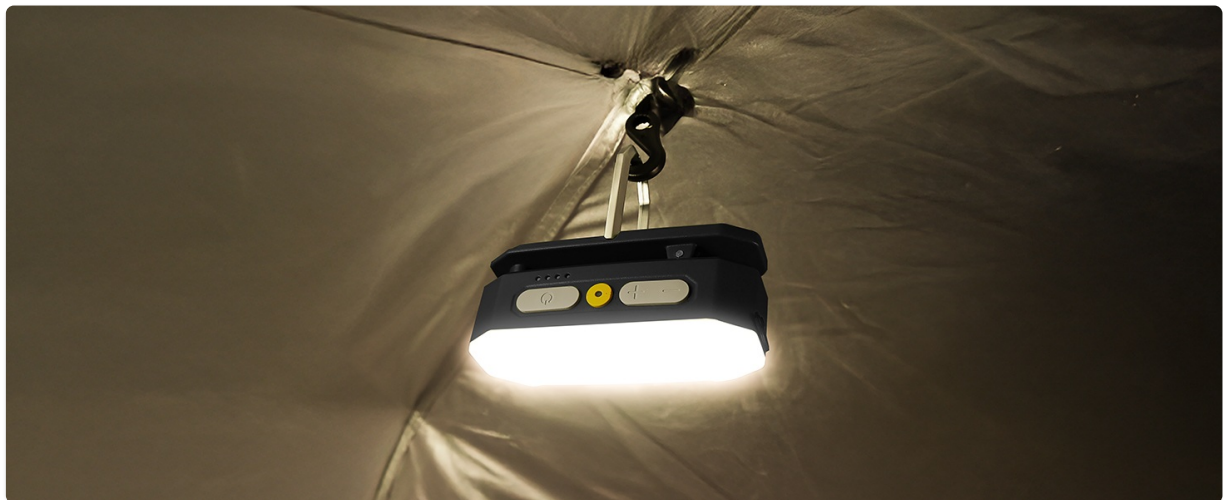
Image: The BougeRV Movable Area Light CL02 illustrating its adaptable design for hands-free convenience, showing it being hung, mounted magnetically, clipped, and used as a handheld light.

The CL02 offers multiple ways to position it for optimal lighting: