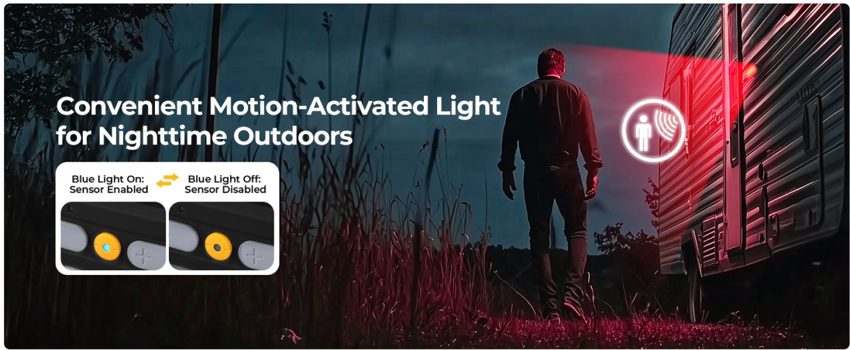
Image: The BougeRV Movable Area Light CL02 demonstrating its motion-activated feature, providing convenient illumination for nighttime outdoor use, such as near a camper.

To activate the motion sensing mode, short press the Mode Button until the blue indicator light next to the yellow button illuminates. In this mode, the light will automatically turn on when motion is detected and turn off after a period of inactivity. This is useful for pathways, tents, or emergency exits.