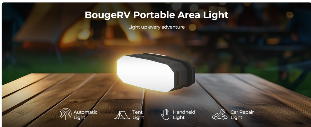
Image: The BougeRV Movable Area Light CL02 showcasing its three adjustable color temperatures: Cool (6500K), Warm (2500K), and Red (1000K), suitable for various activities like work, reading, or not disturbing others.

Short press the Mode Button (Yellow button) to cycle through the following lighting modes: