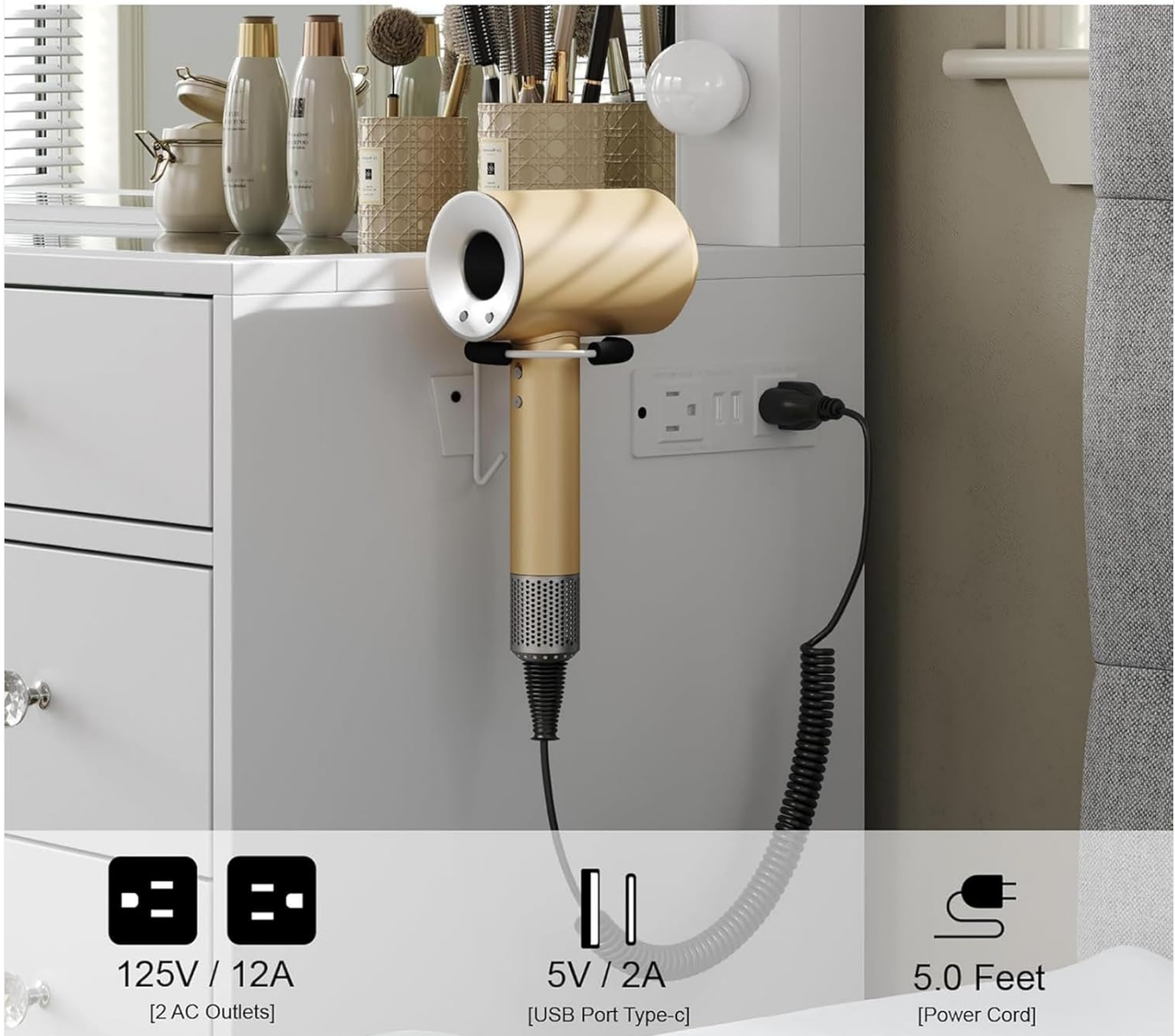
Image Description: A detailed view of the integrated power strip on the side of the vanity desk. It features two standard AC outlets (125V/12A), one USB port (5V/2A), and one Type-C port. A hair dryer is shown plugged into one of the AC outlets, illustrating its practical use.

Convenient for phone charging & hair dryer use