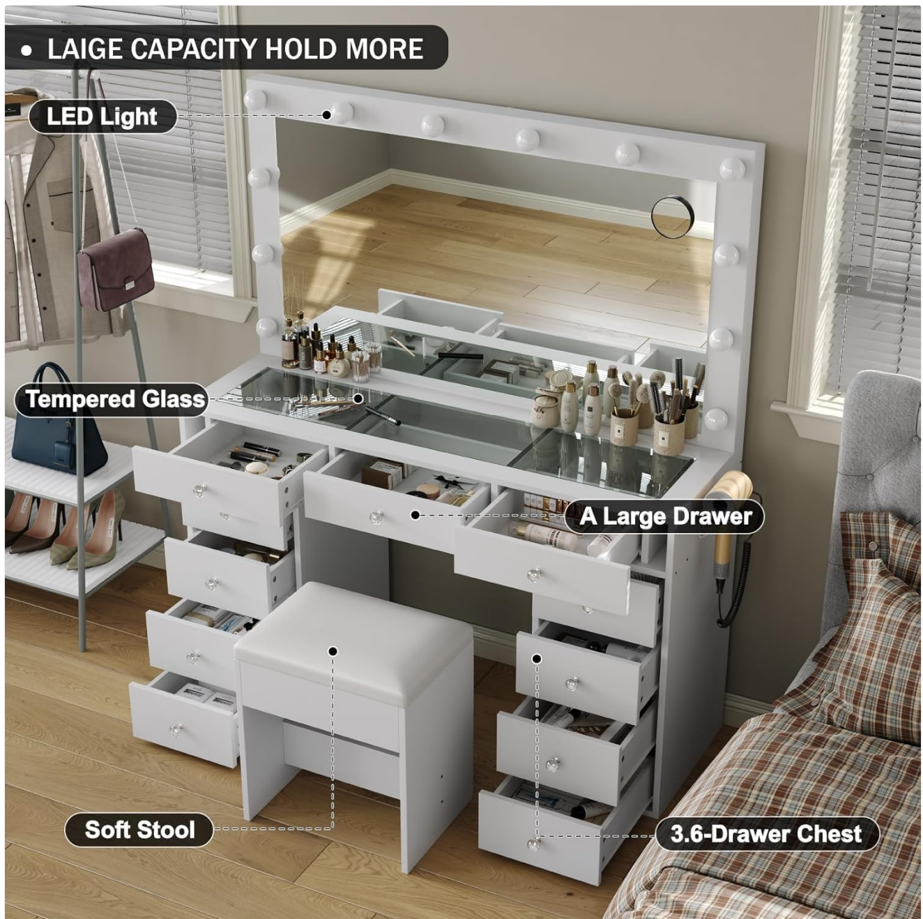
Image Description: An aerial perspective of the vanity desk with several drawers pulled open, revealing their interior space. The image highlights the three main drawers with a tempered glass top for visible storage and the eight deep side drawers for concealed organization. A cushioned stool is positioned beneath the central desk area.