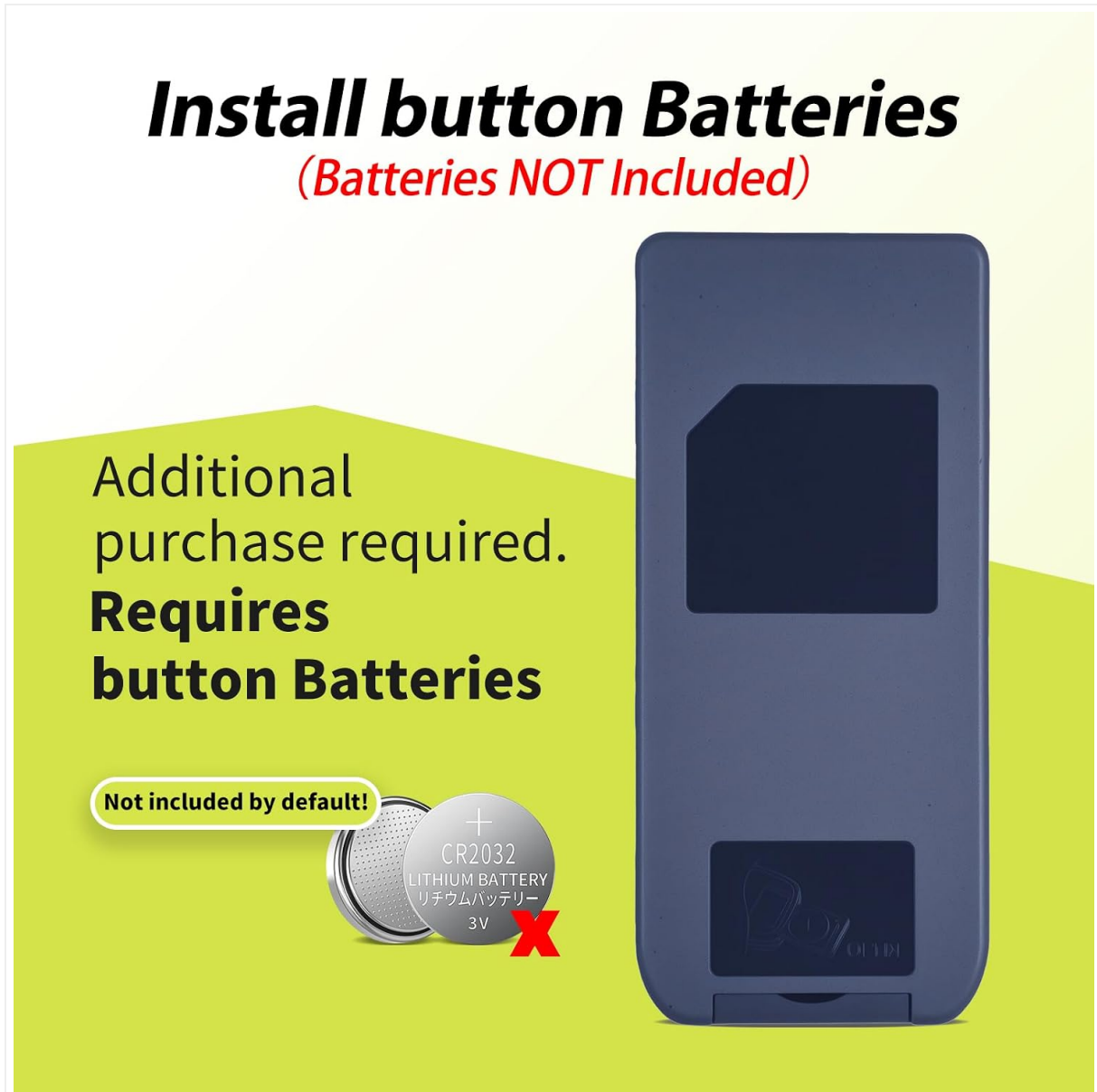
Figure 2: Illustration of battery installation. This image shows the back of the remote control with an open battery compartment and a CR2032 button battery, indicating that batteries are not included.

No setup or pairing is required. The remote will function directly once batteries are installed.