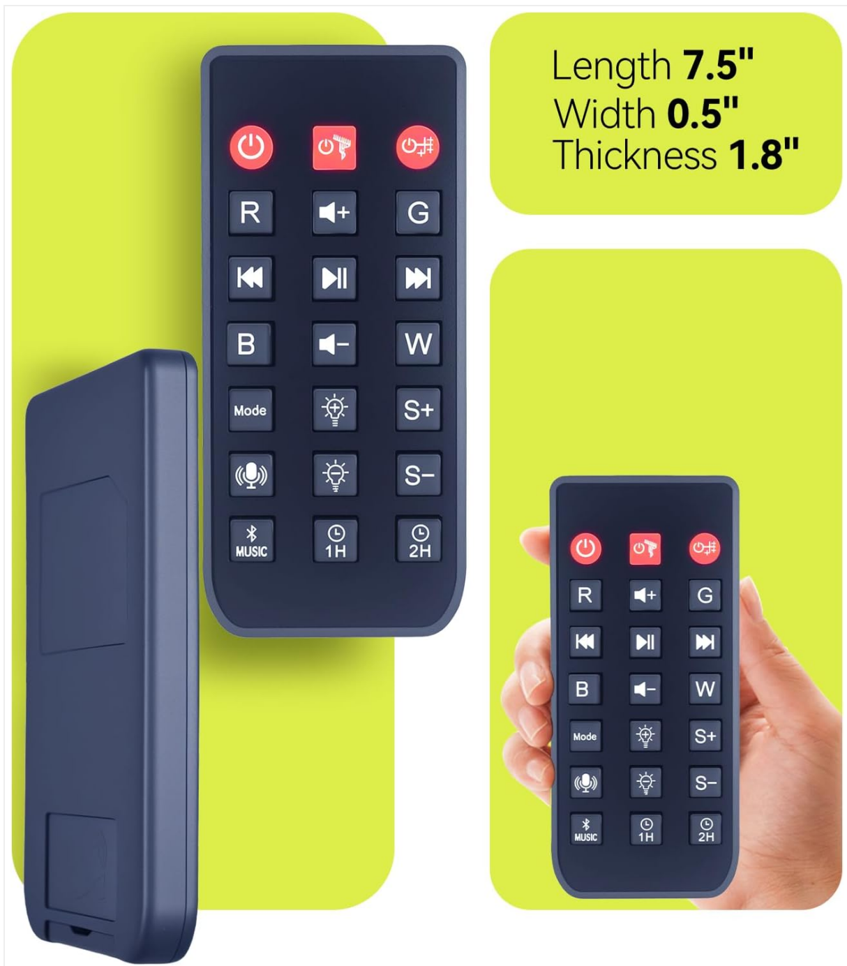
Figure 6: Remote control dimensions. This image provides the physical measurements of the remote: Length 7.5 inches, Width 0.5 inches, Thickness 1.8 inches.