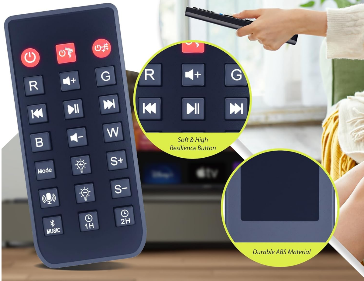
Figure 5: Premium remote control features. This image highlights the soft and high-resilience buttons and the durable ABS material used in the remote's construction.