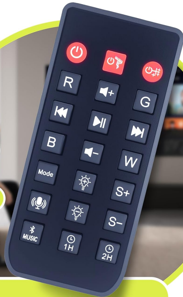
Figure 3: Features for direct use. This image highlights that the remote uses an infrared link, requires no pairing, and is simple and convenient to use.