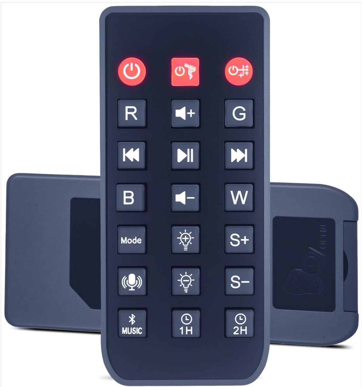
Figure 1: RYQIF Replacement Remote Control. This image displays the front view of the black remote control with various function buttons, including power, volume, mode, and timer controls.