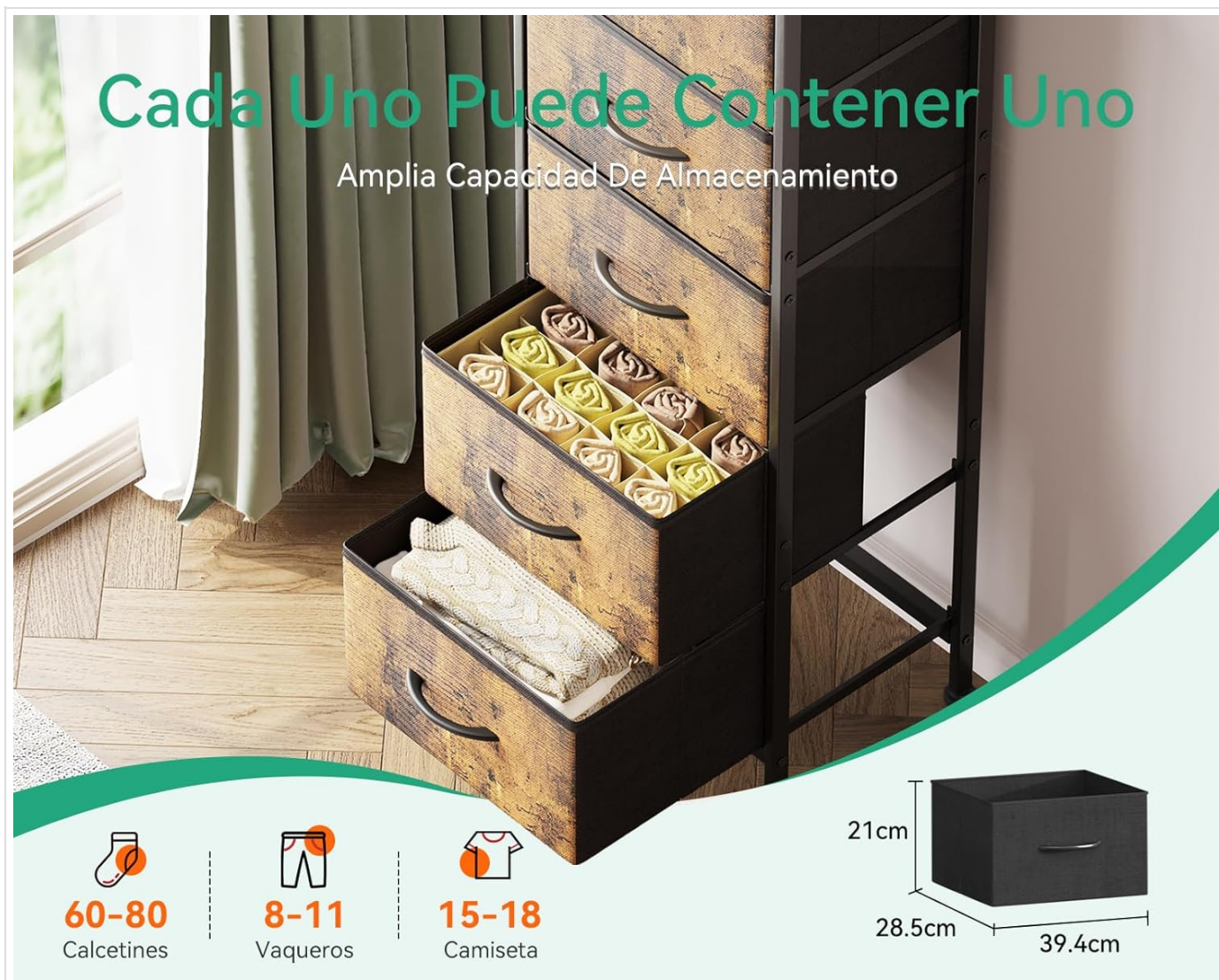
Image: Open fabric drawers demonstrating ample storage capacity for various items.