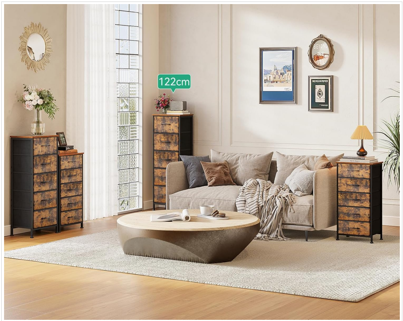
Image: The dresser positioned in a living room, demonstrating its versatility.