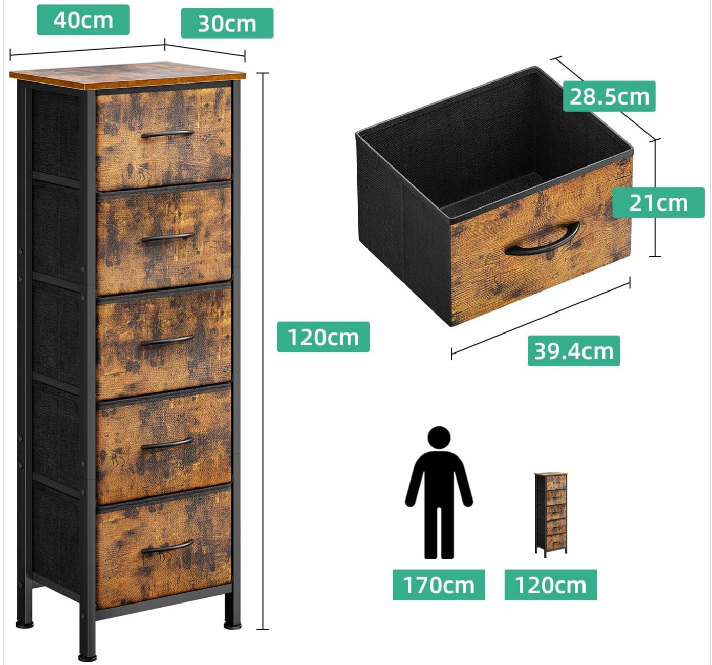
Image: Detailed product dimensions for the dresser and individual drawers.