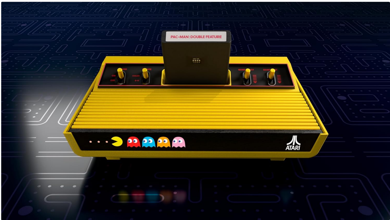
Image 2.1: The Atari 2600+ console with the PAC-MAN: Double Feature cartridge inserted into the slot.