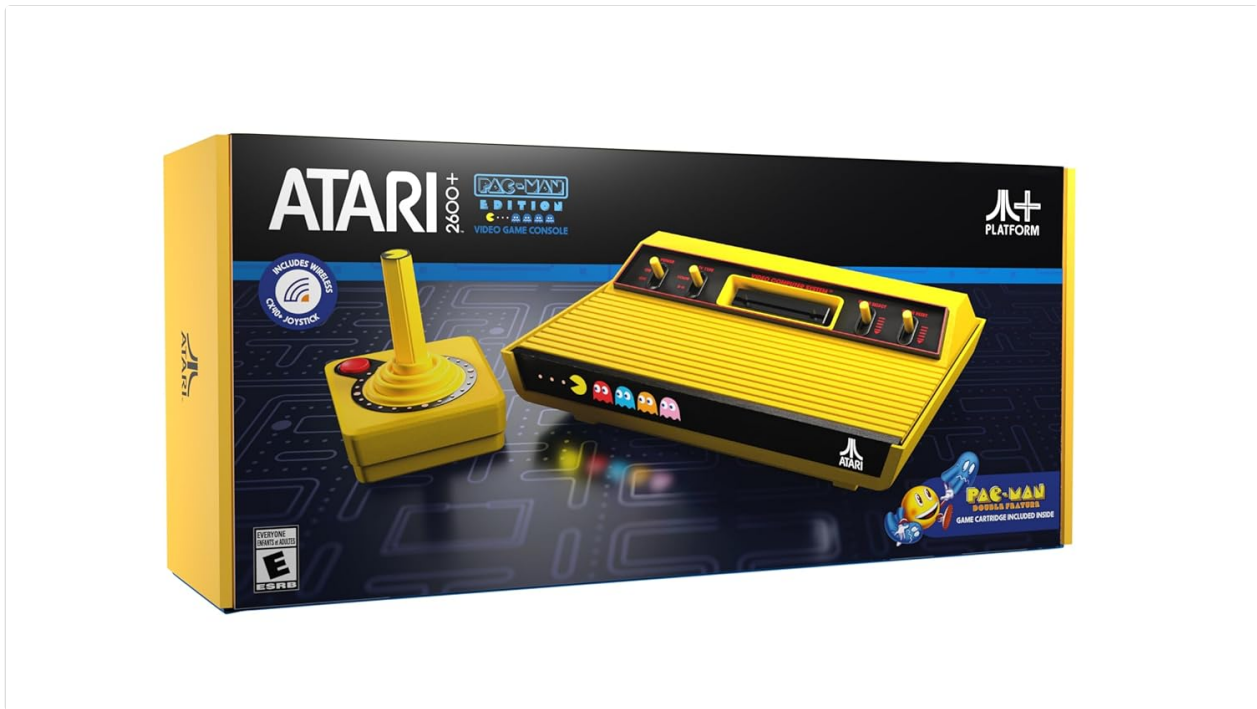
Image 1.1: The Atari 2600+ PAC-MAN Edition Console packaging, displaying the console, wireless joystick, and game cartridge.