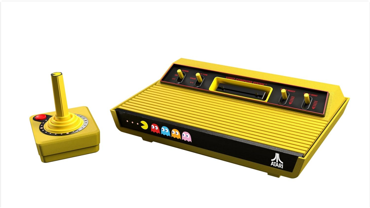
Image 3.1: The Atari 2600+ console alongside its wireless CX-40+ joystick.