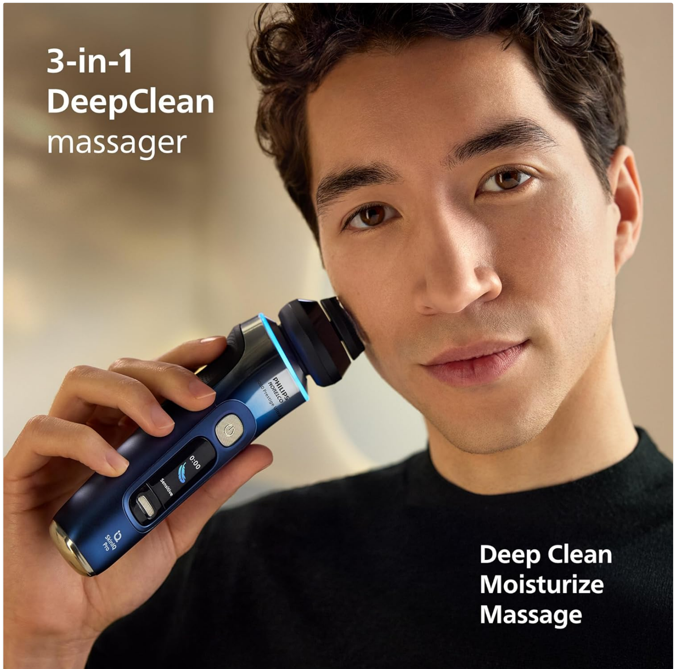
Figure 3: Shaver display showing SenseIQ Pro Technology features and shaving modes.