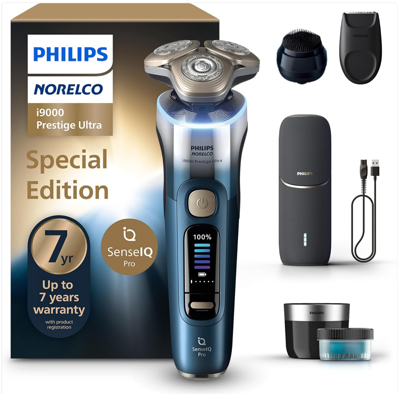
Figure 1: Philips Norelco Shaver i9000 Prestige Ultra with included accessories.