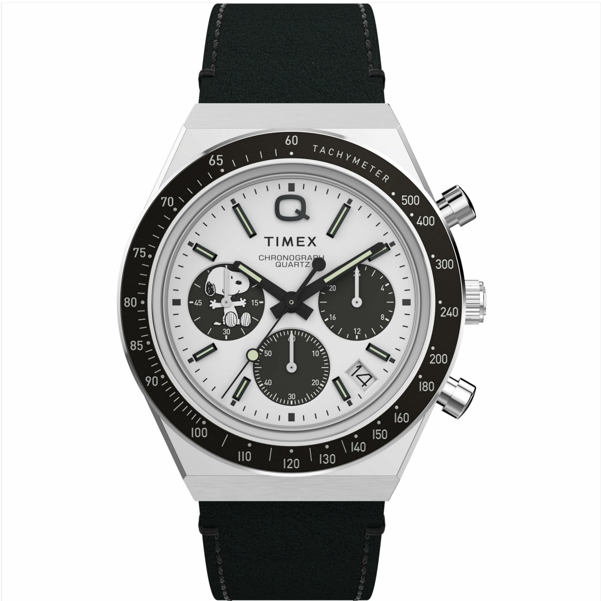
Figure 2.1: Front view of the Timex Men's Q 40mm Watch, showcasing the white dial, hands, and stainless steel case.