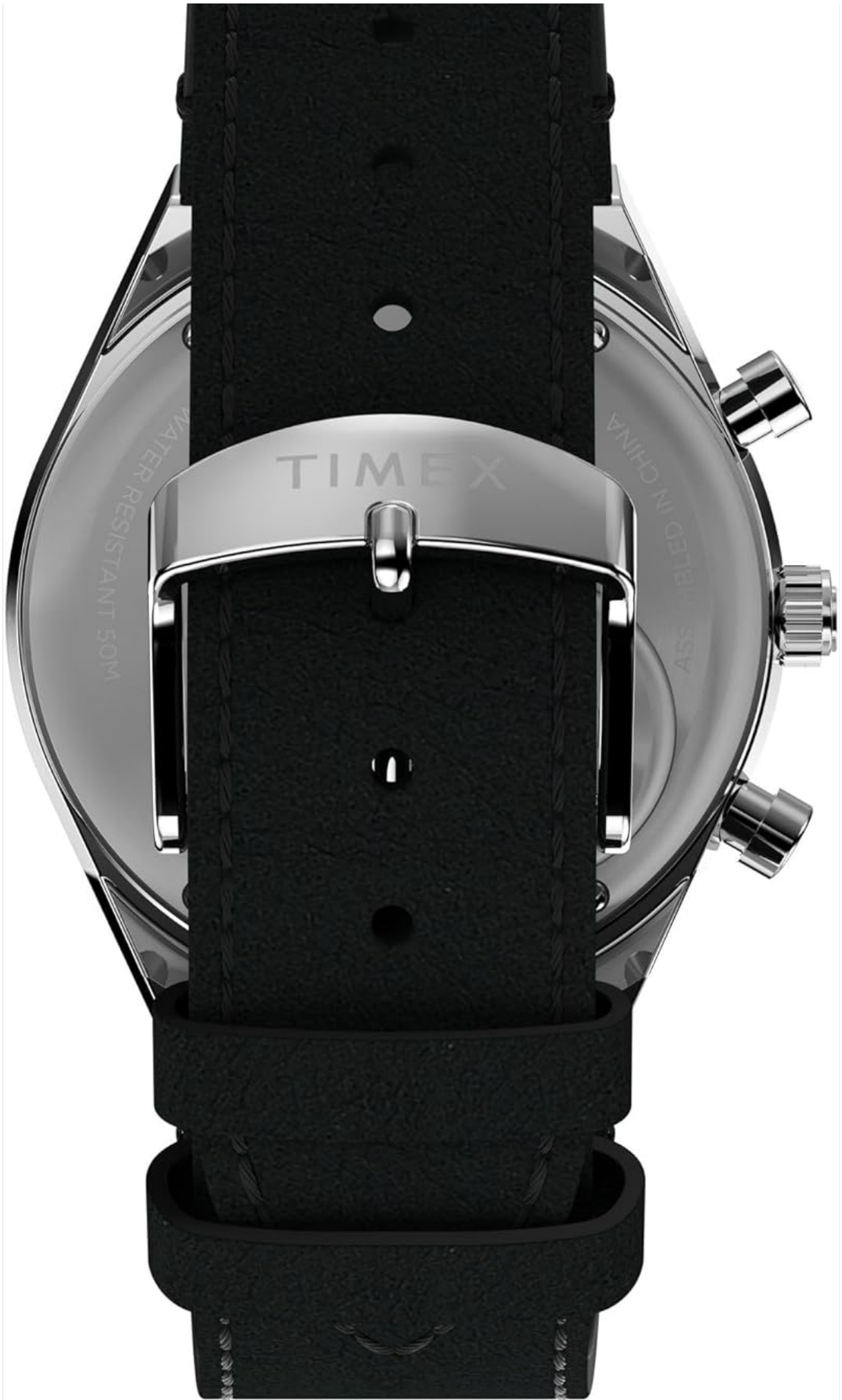
Figure 3.1: Back view of the watch, showing the strap and buckle mechanism.