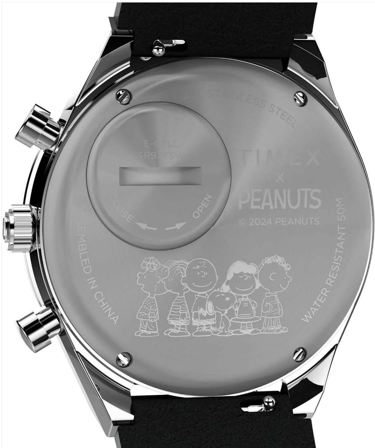
Figure 5.1: Close-up of the watch case back, showing the battery compartment with 'OPEN' and 'CLOSE' indicators.