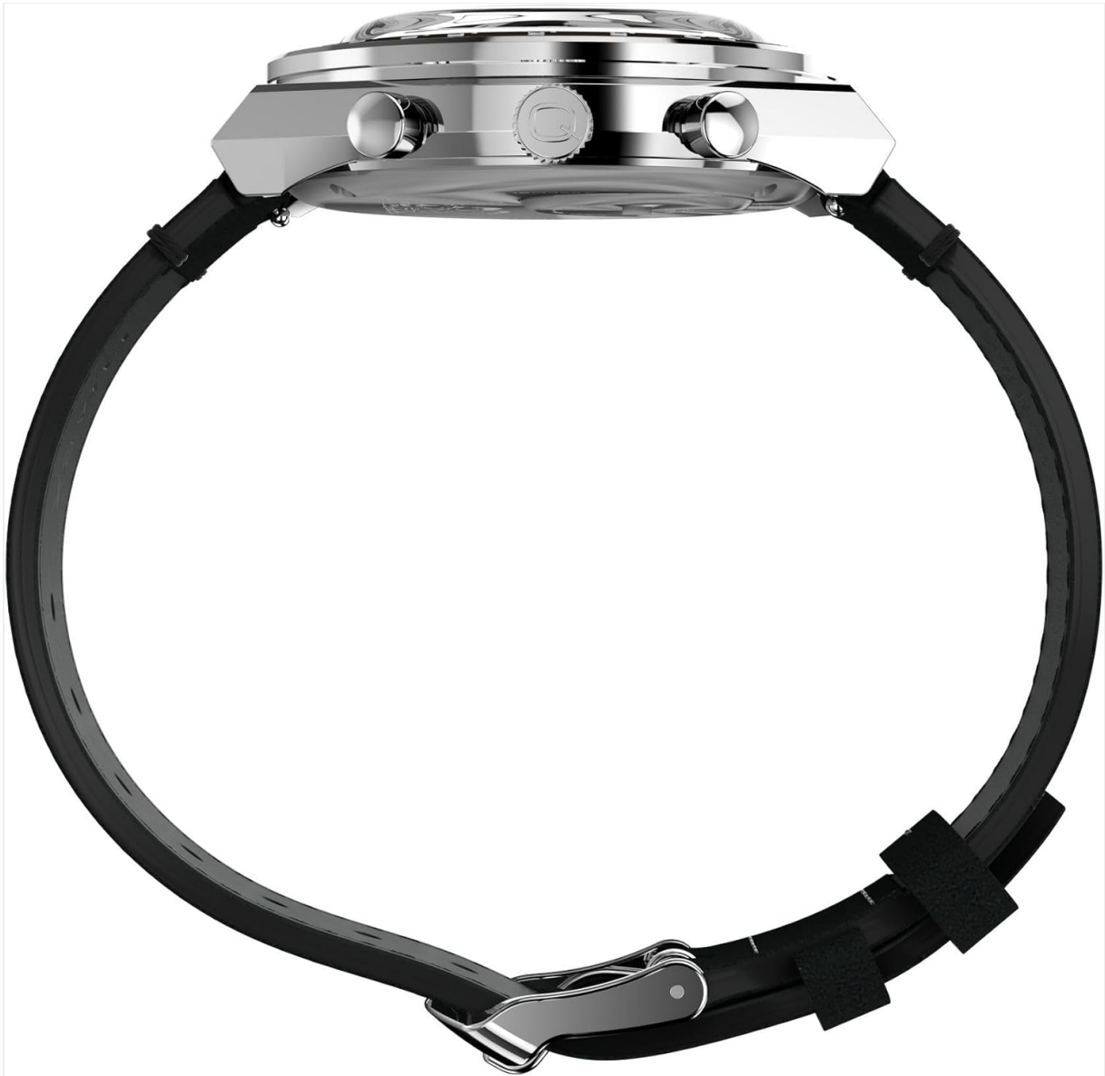
Figure 2.2: Side view of the watch, highlighting the crown for time adjustment and the chronograph pushers.