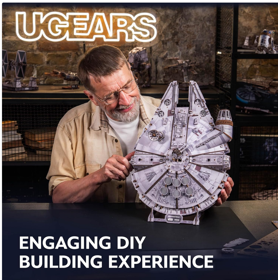
Image: A person engaged in the assembly of the UGEARS Millennium Falcon model, highlighting the detailed building experience.