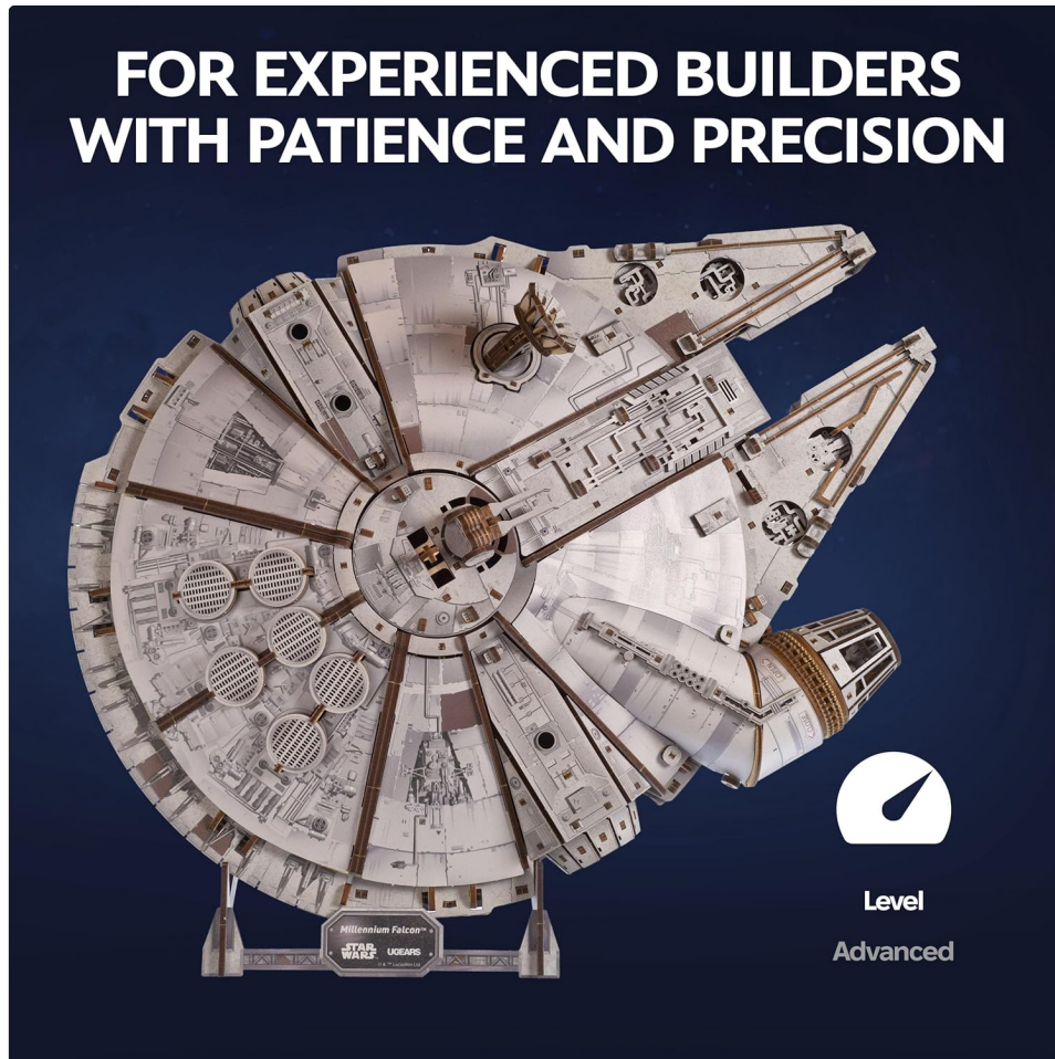
Image: The assembled Millennium Falcon model, emphasizing that the kit is designed for experienced builders who value patience and precision.

It is recommended to organize parts by number before starting. Some parts may be delicate; exercise caution when detaching them from the plywood sheets.