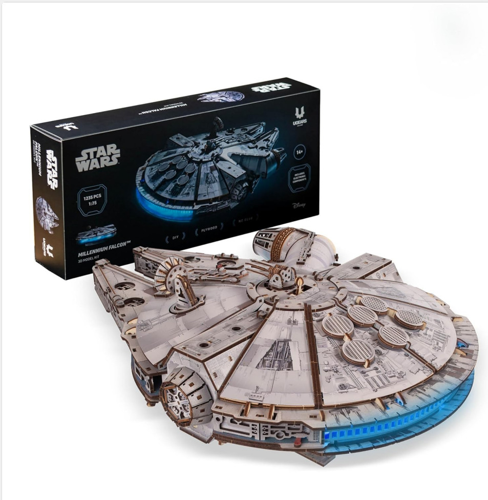
Image: The UGEARS Star Wars Millennium Falcon 3D Wooden Puzzle kit box alongside the fully assembled model, showcasing its intricate details and LED lighting.