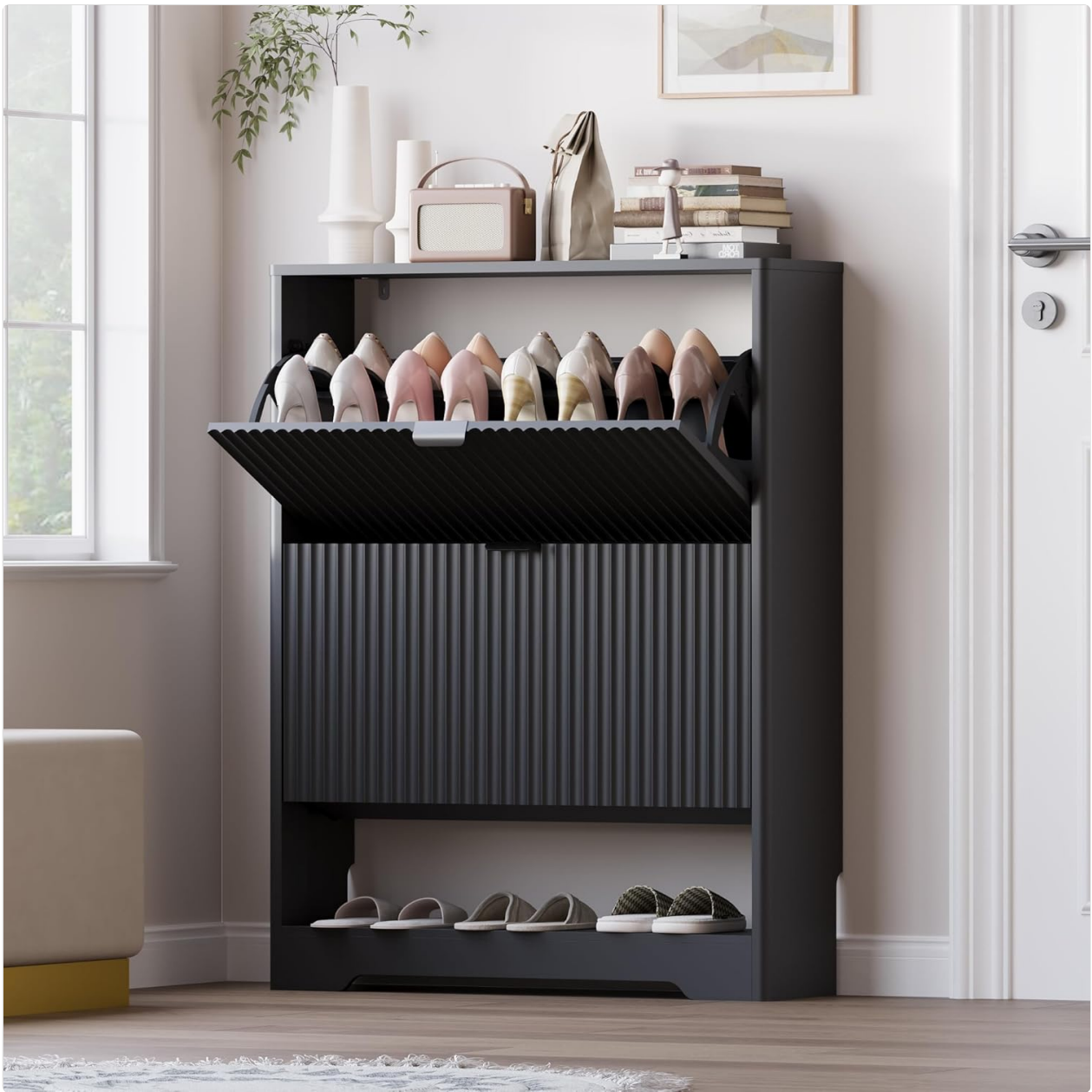
Image: The BORNOON Shoe Cabinet in an entryway, showcasing its two flip-down drawers filled with various shoes and its top surface used for decorative items.