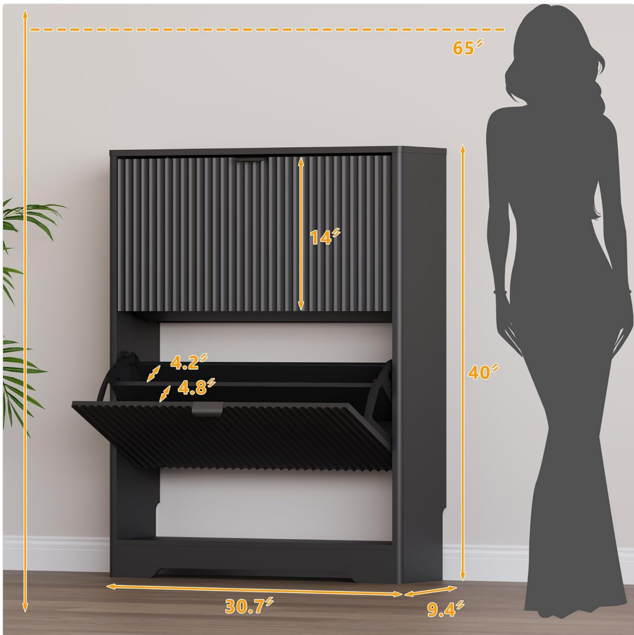
Image: Dimensional diagram of the shoe cabinet, indicating its width, depth, and height for accurate placement and planning.