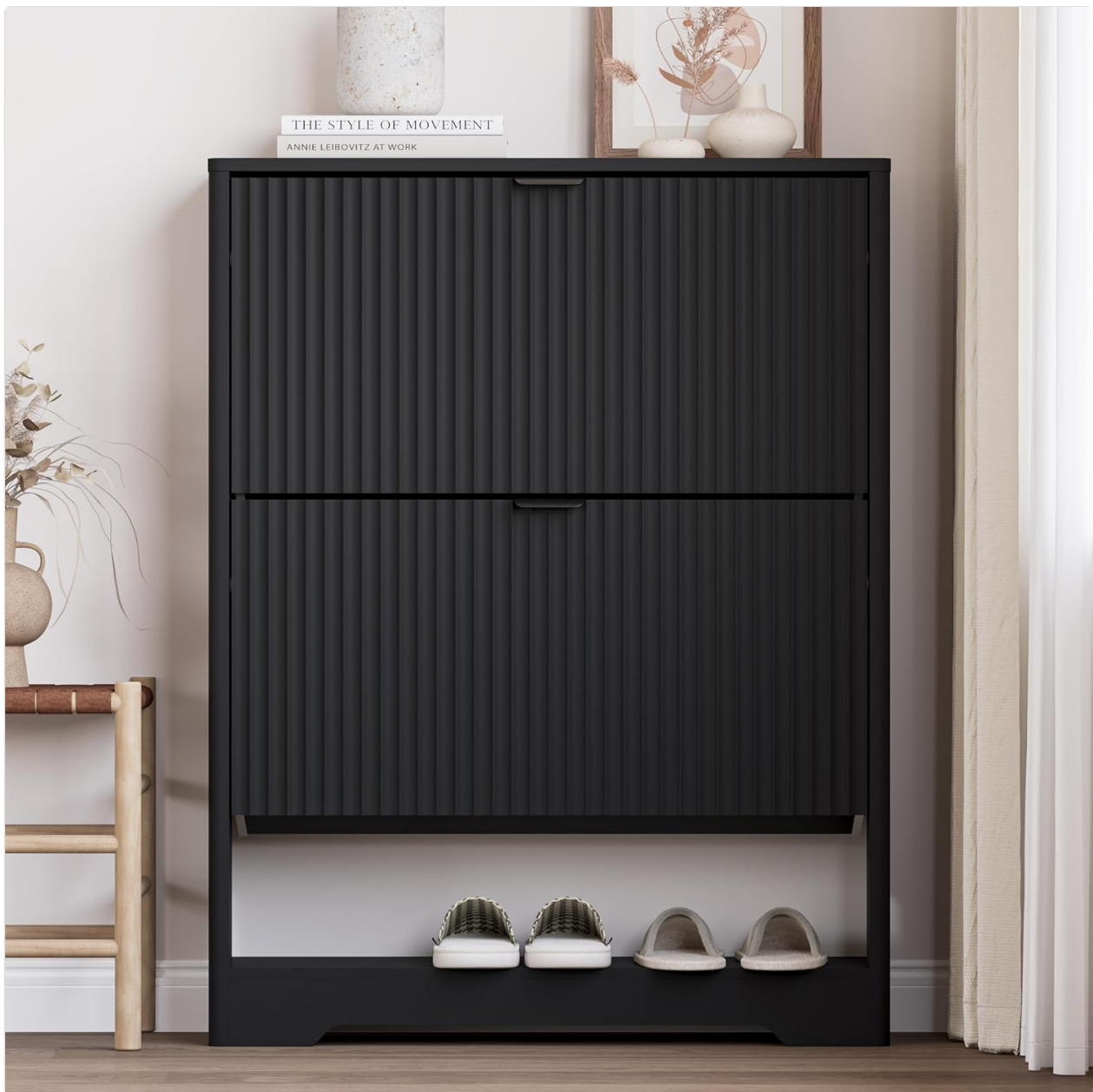
Image: The open bottom shelf of the shoe cabinet, providing convenient storage for slippers or other frequently accessed footwear.