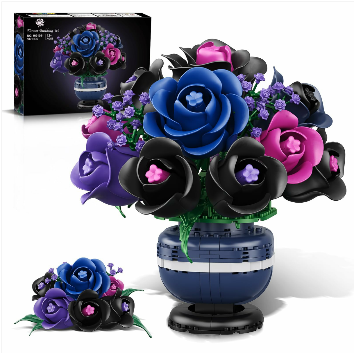
Image 1.1: The fully assembled HiWEEGO Flowers Botanicals Building Set.