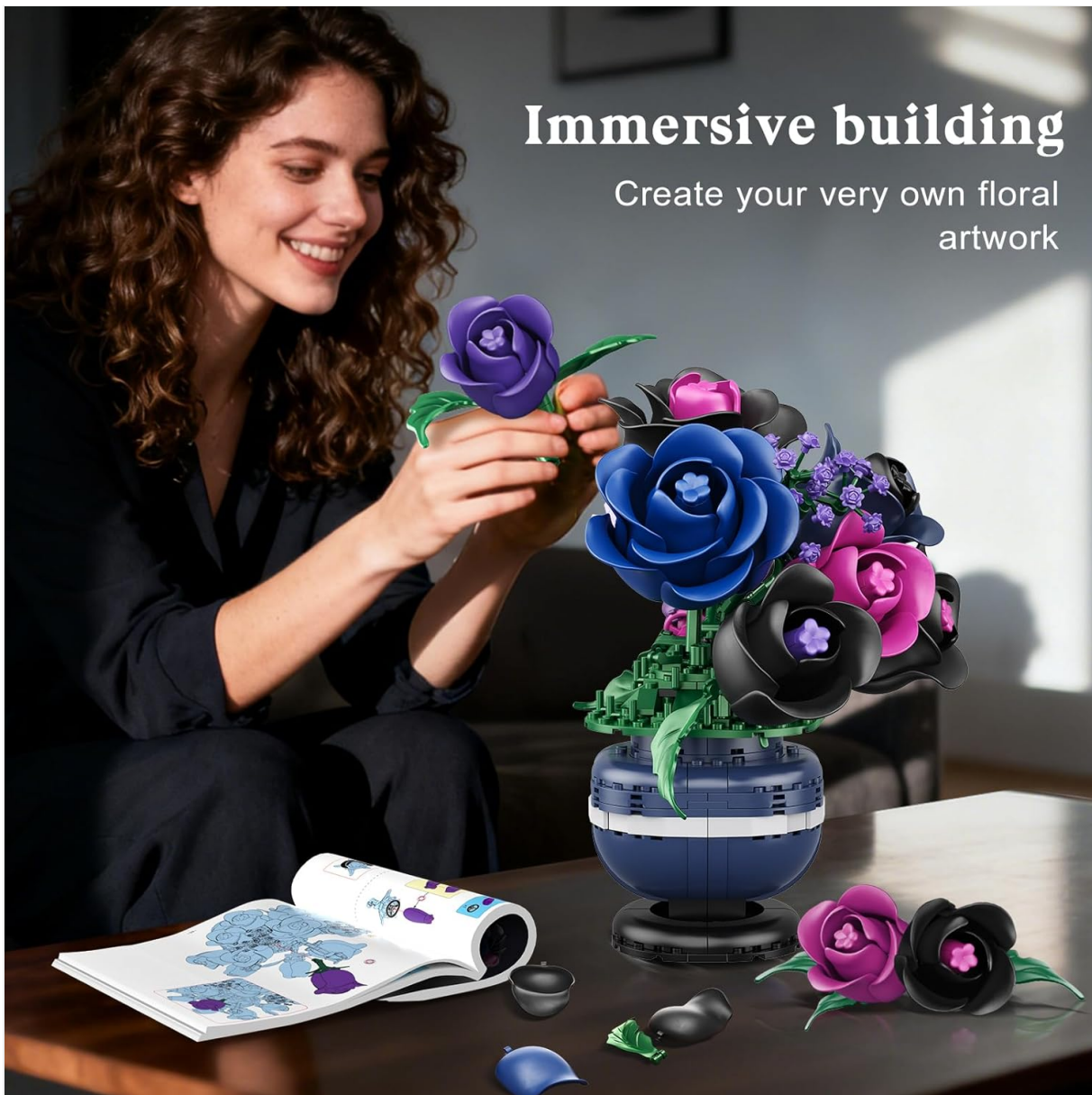
Image 4.2: A builder engaged in the assembly process of the botanical set.