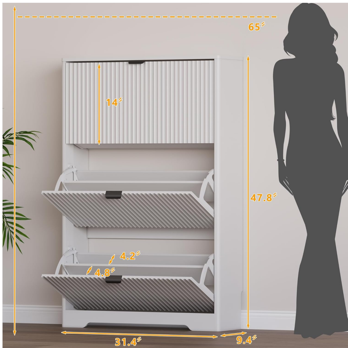
Figure 6: Product Dimensions. This diagram provides a visual representation of the shoe cabinet's measurements, including depth, width, and height.