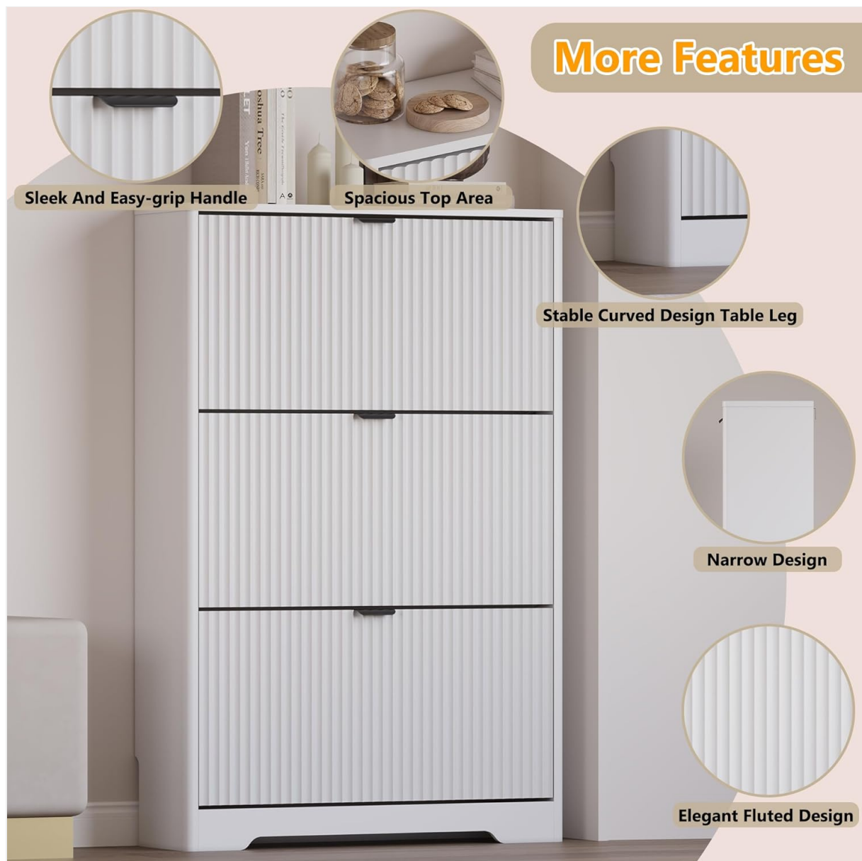
Figure 7: Key Design Features. This image points out specific design elements such as the sleek handle, spacious top, stable curved legs, narrow profile, and elegant fluted paneling.