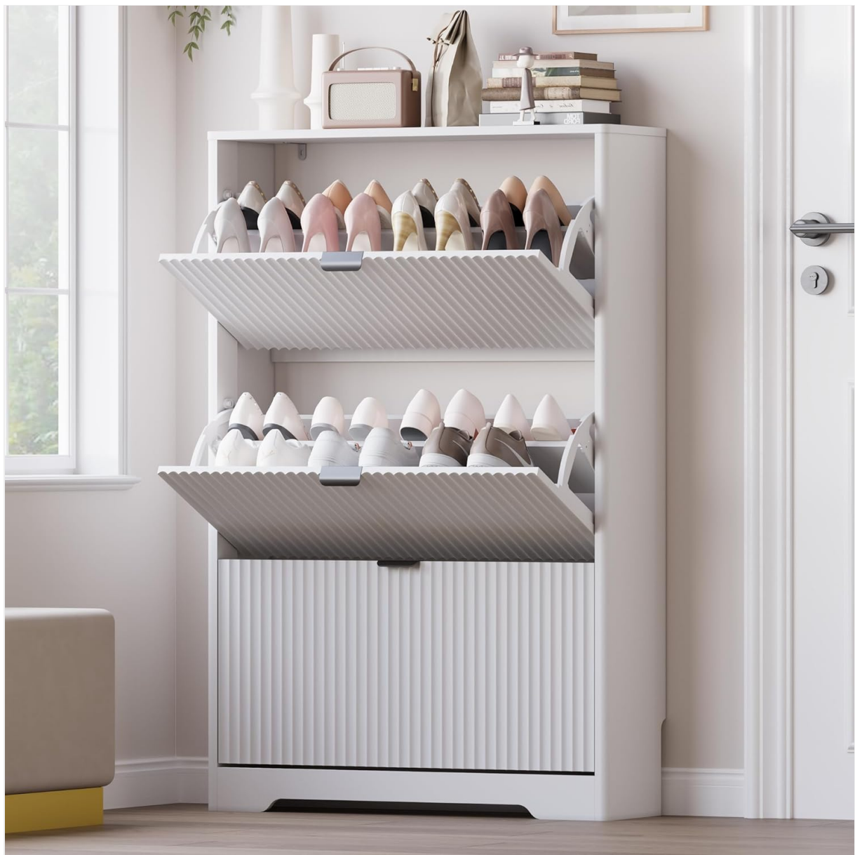
Figure 3: Assembled Shoe Cabinet with Open Drawers. This image displays the fully assembled BORNNOON shoe cabinet with its flip drawers open, showcasing its storage capacity and design.