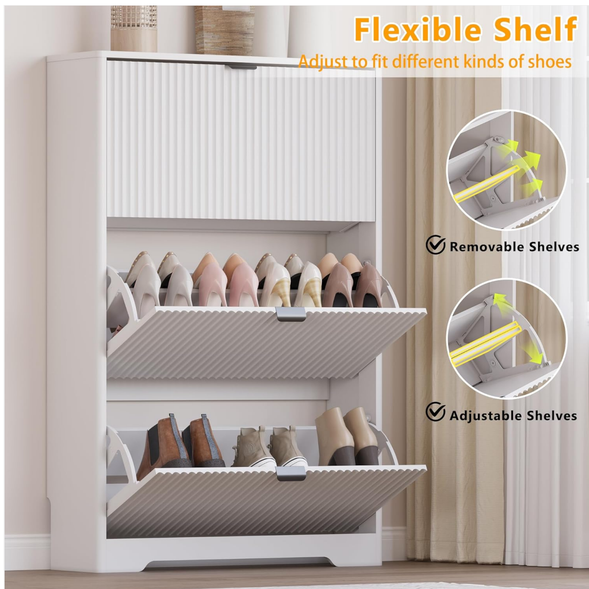
Figure 2: Flexible Shelf Configuration. This image demonstrates how the internal shelves within each flip drawer can be removed or adjusted to fit various shoe types and sizes.