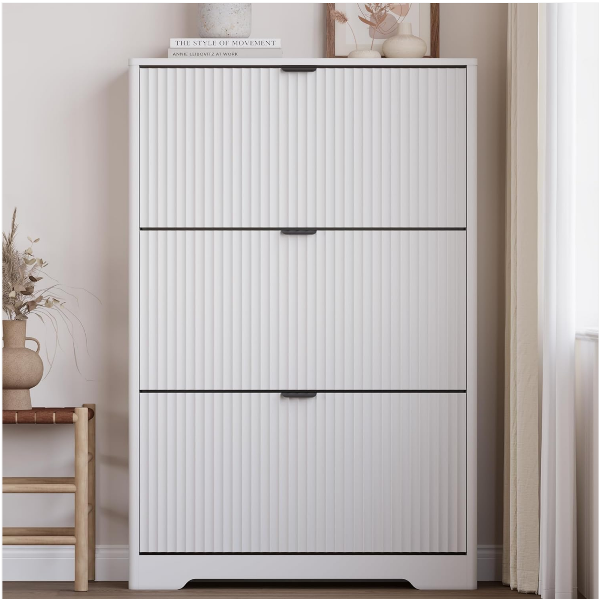
Figure 4: Assembled Shoe Cabinet with Closed Drawers. This image presents the BORNNOON shoe cabinet in its closed state, highlighting its compact and elegant appearance suitable for entryways.