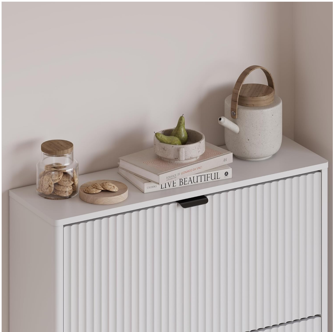
Figure 5: Top Surface Utilization. This image shows the cabinet's top surface being used for decorative items and small personal belongings, demonstrating its additional utility.