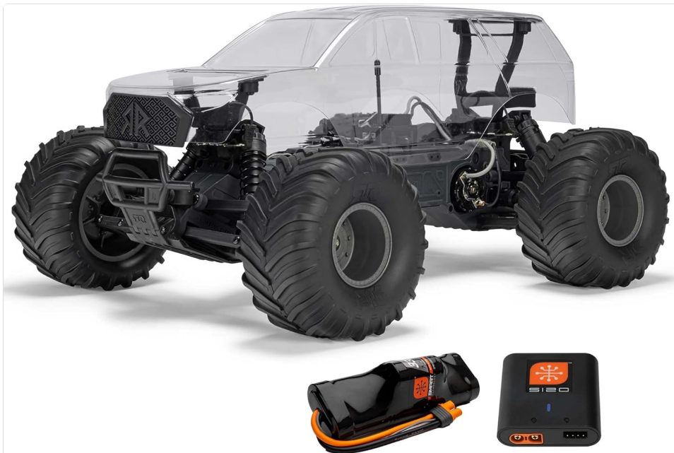
The ARRMA Gorgon 2WD RTA Kit Monster Truck with its clear body, ready for customization.