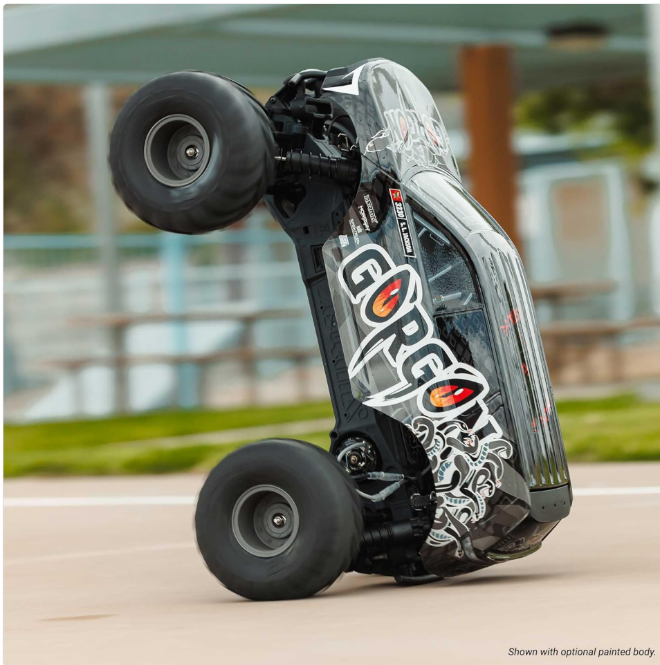
The ARRMA Gorgon Monster Truck resting on its side, showcasing its robust design.