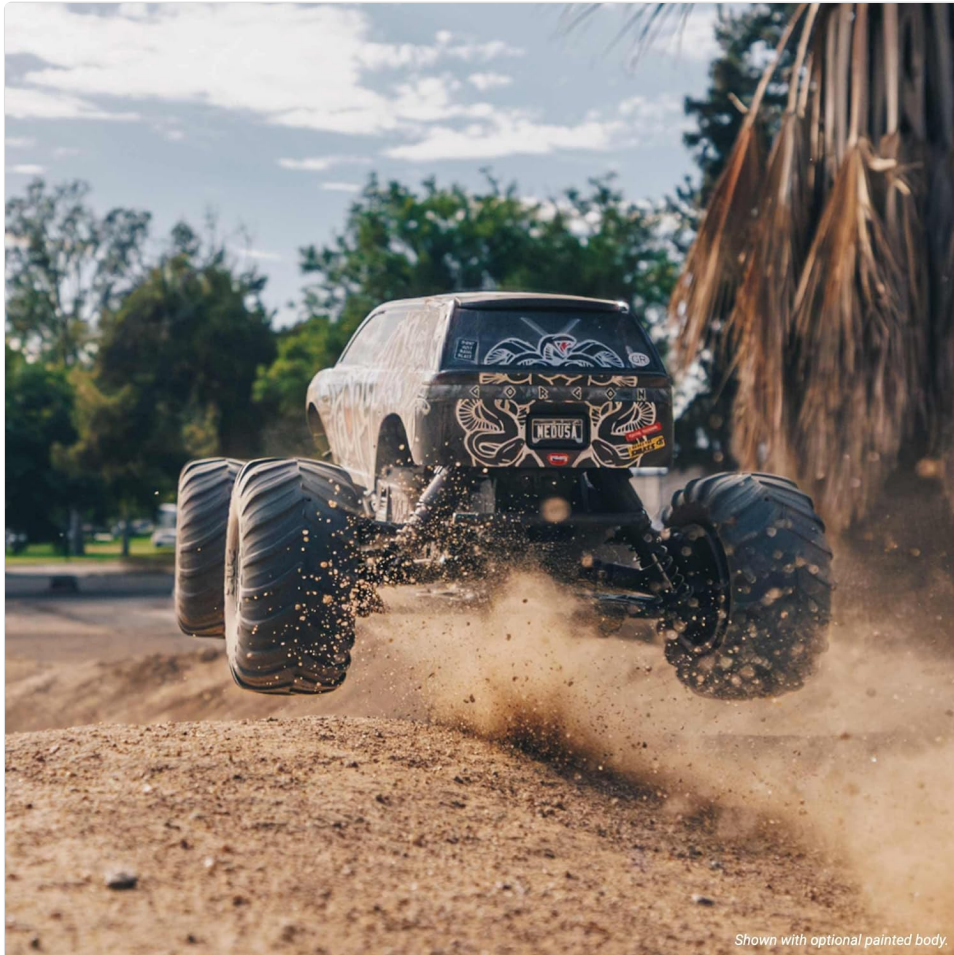
The ARRMA Gorgon Monster Truck in action, demonstrating its off-road capabilities.