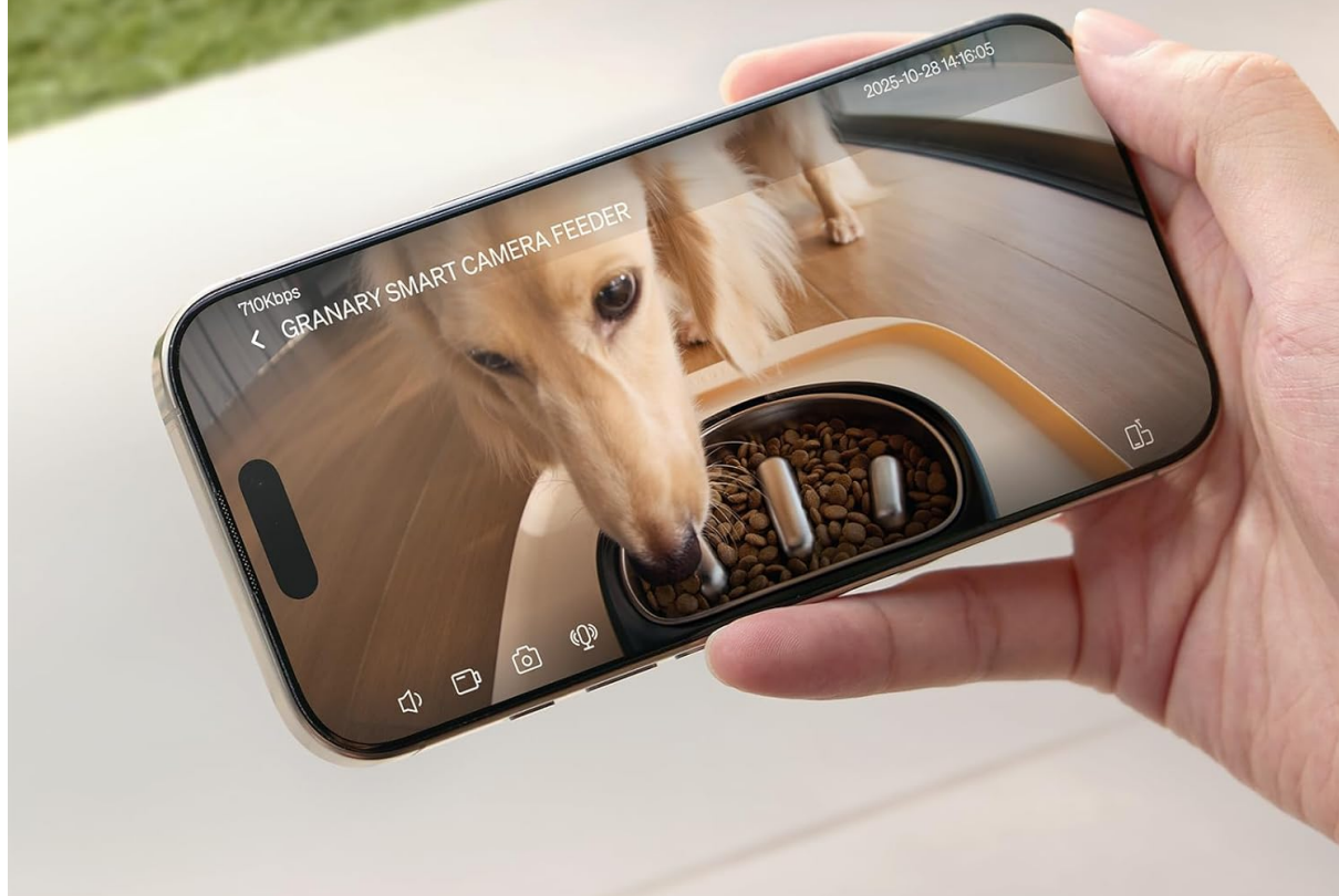
Figure 5: Slow Feeding in Action

See mealtimes in real time on your phone.