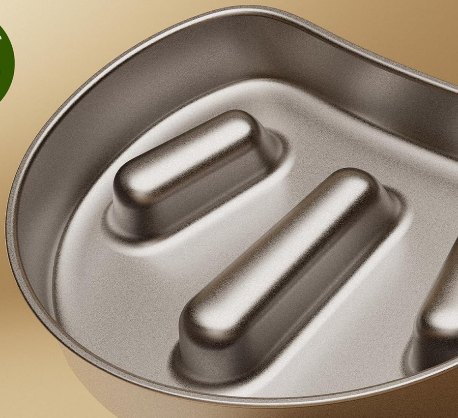
Figure 2: Stainless Steel Slow Food Bowl