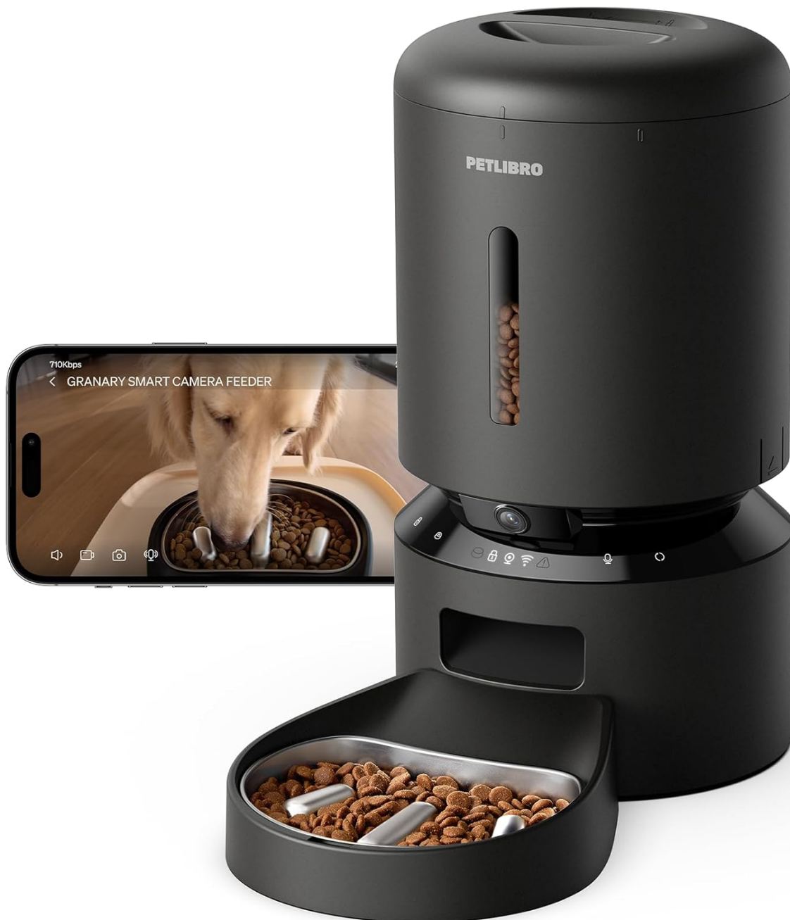
Figure 1: PETLIBRO Automatic Pet Feeder with Camera