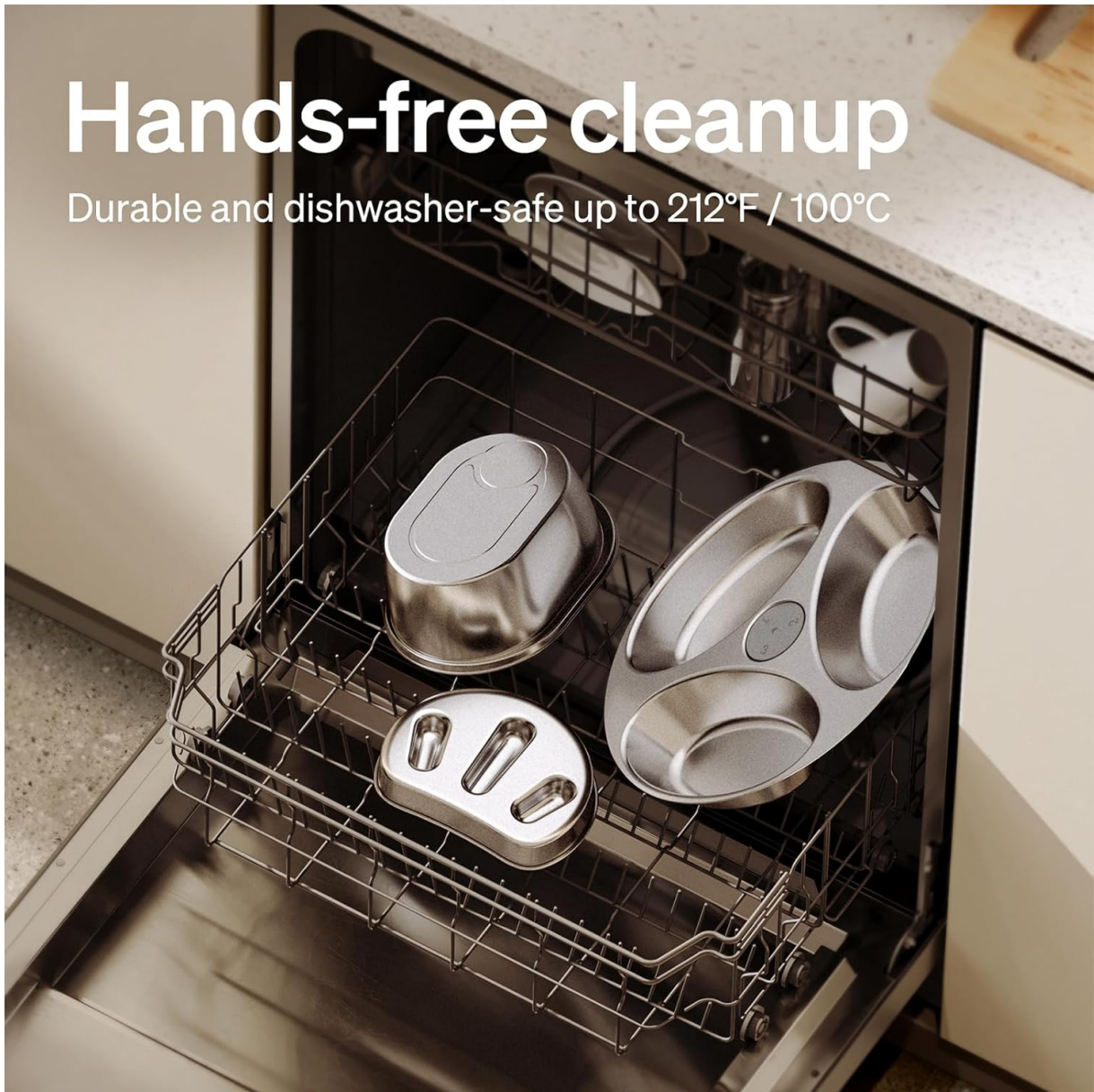
Figure 6: Dishwasher Safe Components

Durable and dishwasher-safe up to 212°F / 100°C