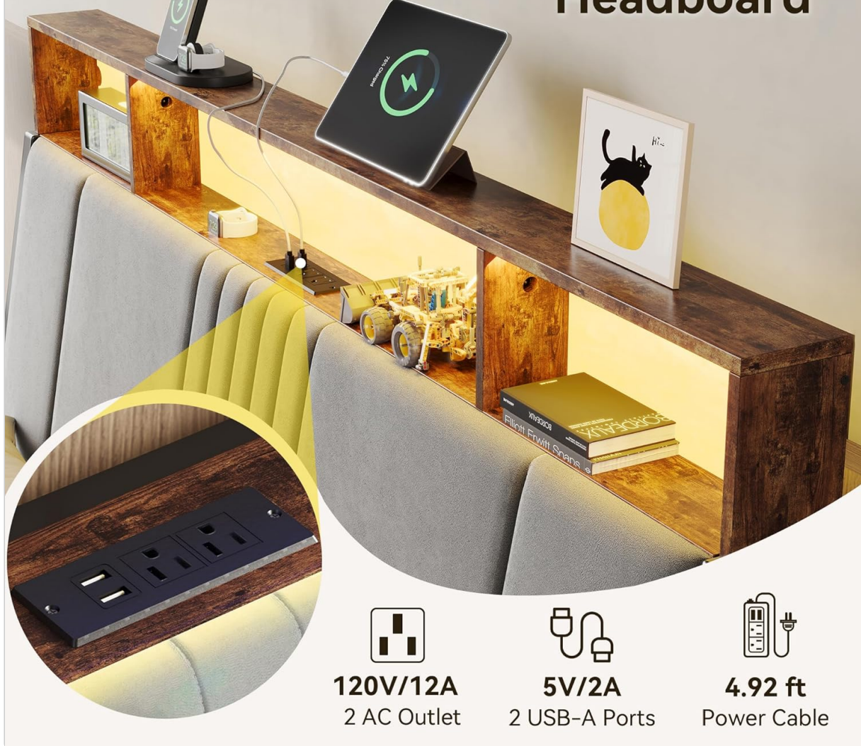
Figure 4: The 2-tier storage headboard with integrated charging station.