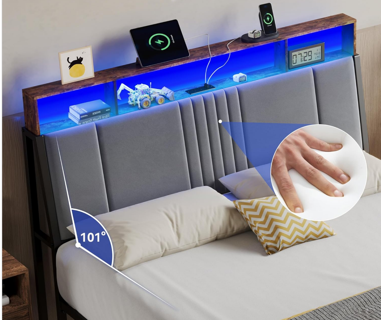
Figure 5: The 101° angled ergonomic headboard for enhanced comfort.