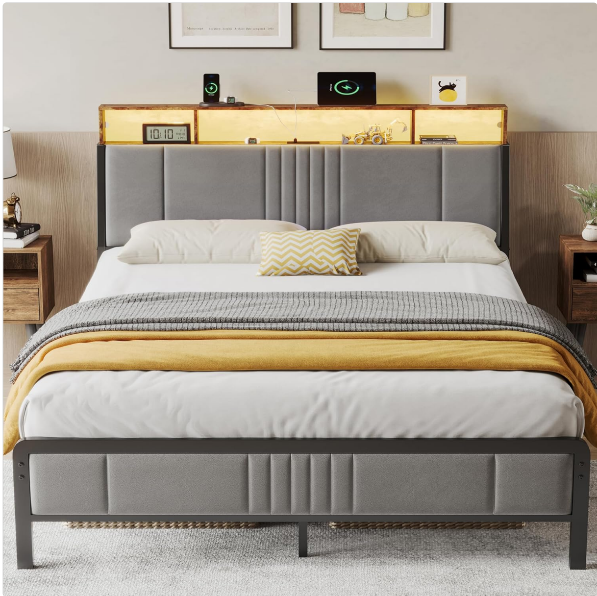
Figure 1: BedsPick Queen Bed Frame with Ergonomic Headboard, 2-Tier Storage, Charging Station, and Smart LED Lights.