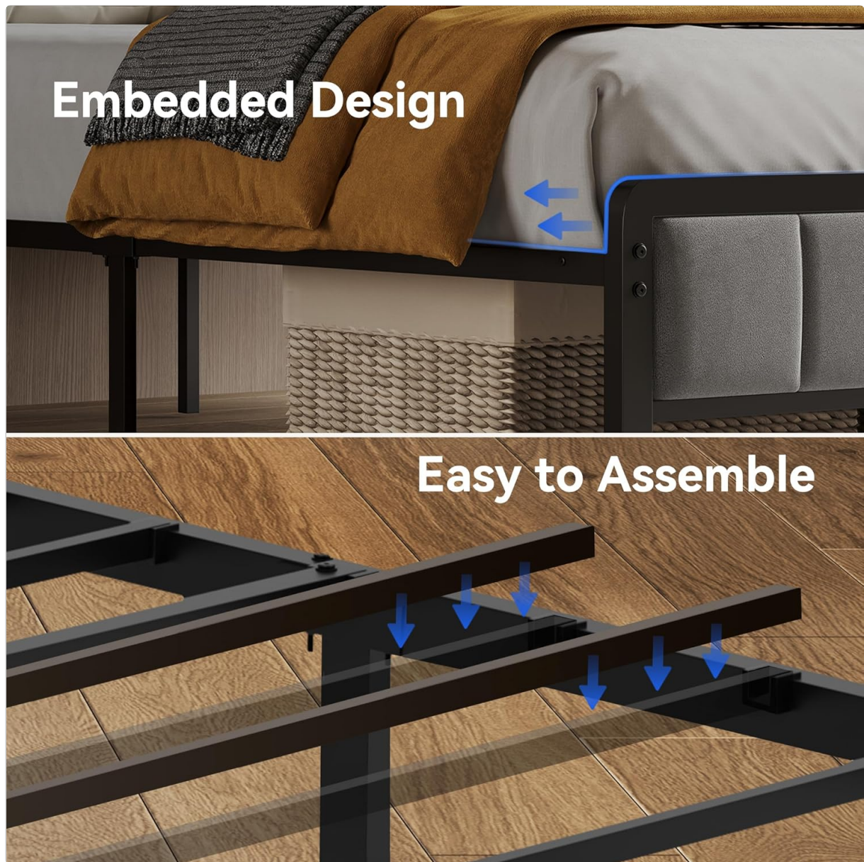
Figure 2: Illustration of the easy assembly process and embedded design for mattress stability.