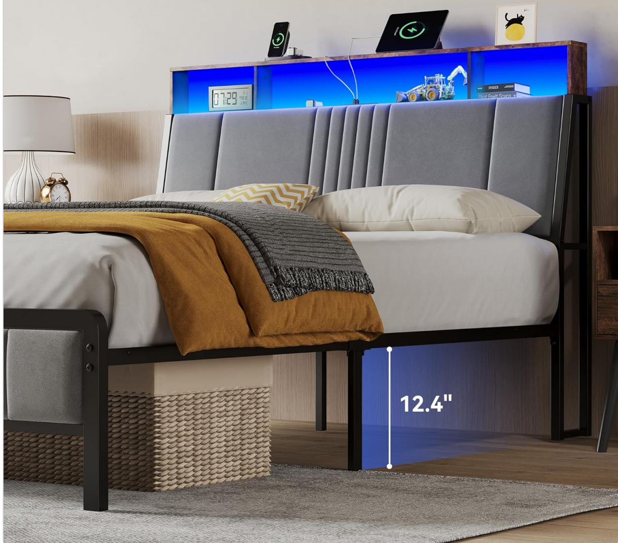
Figure 8: Illustration of the 12.4-inch ample underbed storage space.