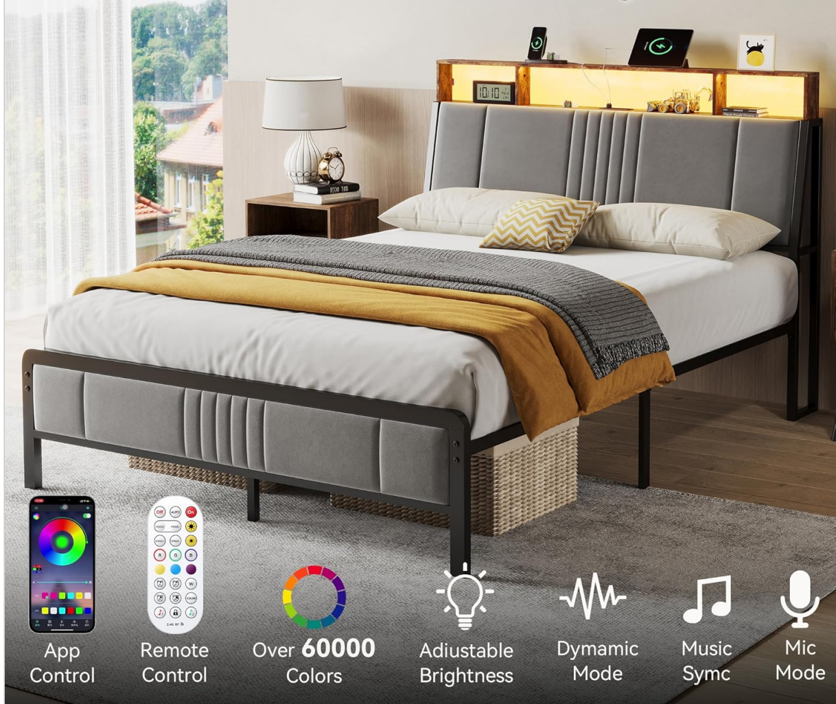
Figure 3: Remote and app control options for the adjustable RGB LED lights.