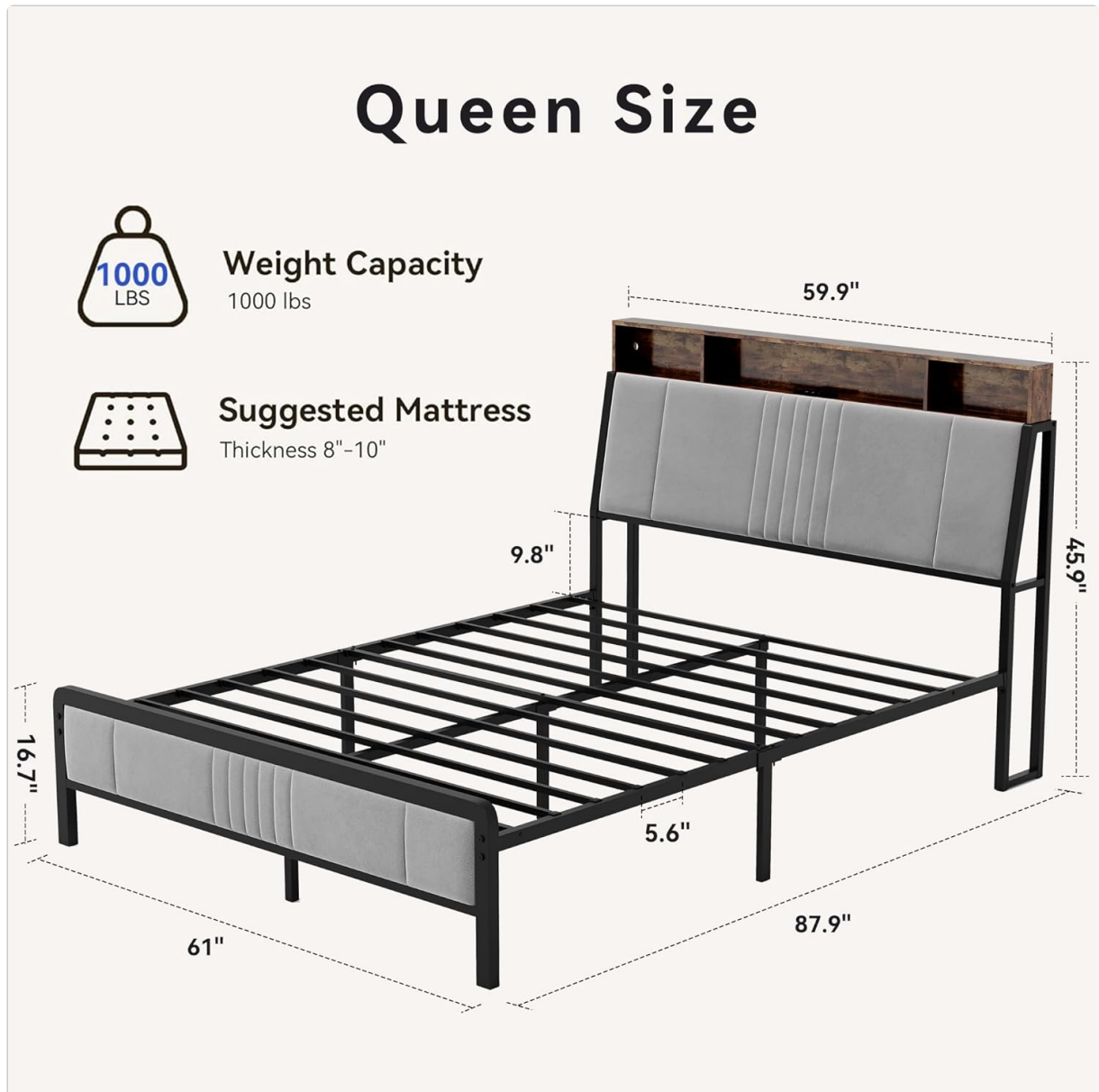
Figure 7: Key dimensions and weight capacity for the Queen size bed frame.