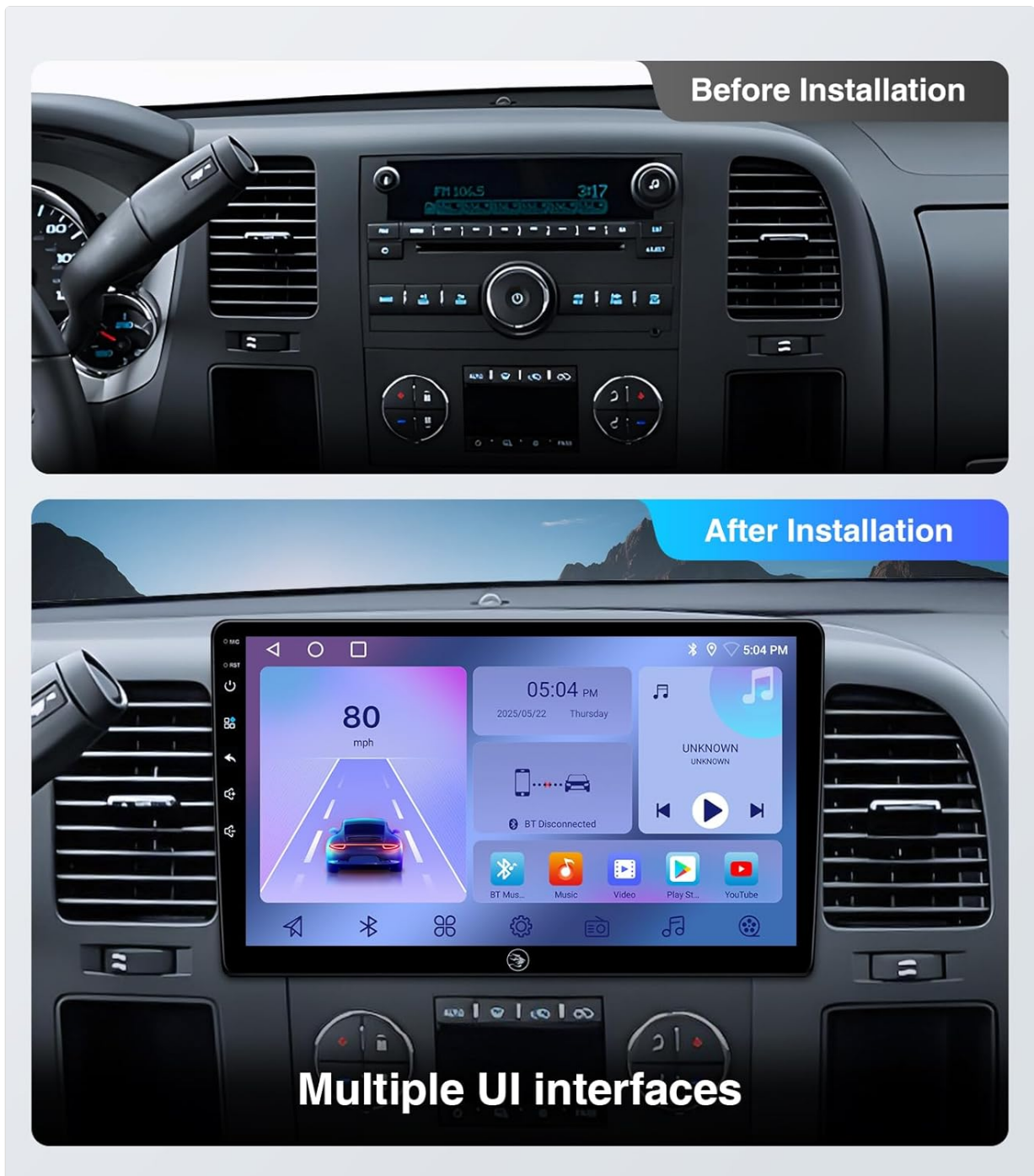
Figure 4.1: Before and After Installation. This image illustrates the visual transformation of the car's dashboard after installing the AINAVI stereo.

Your browser does not support the video tag.