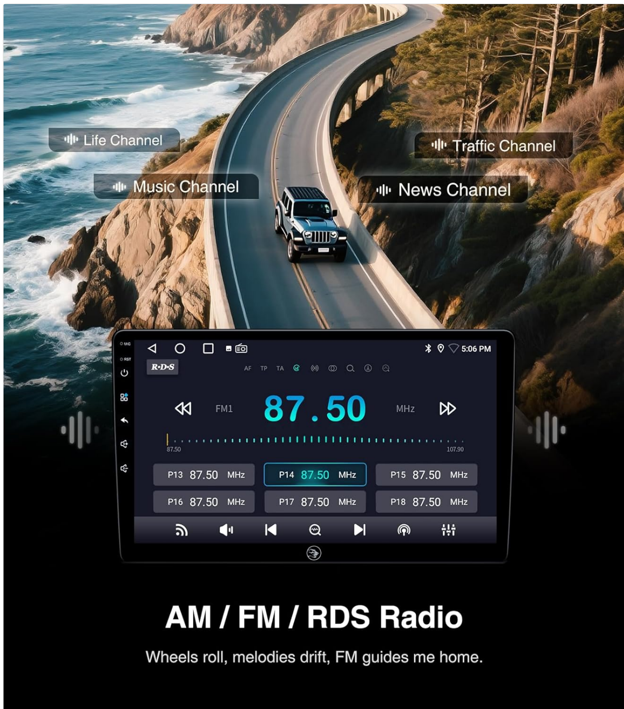
Figure 5.4: AM / FM / RDS Radio. This image shows the radio interface, allowing users to tune into various stations.