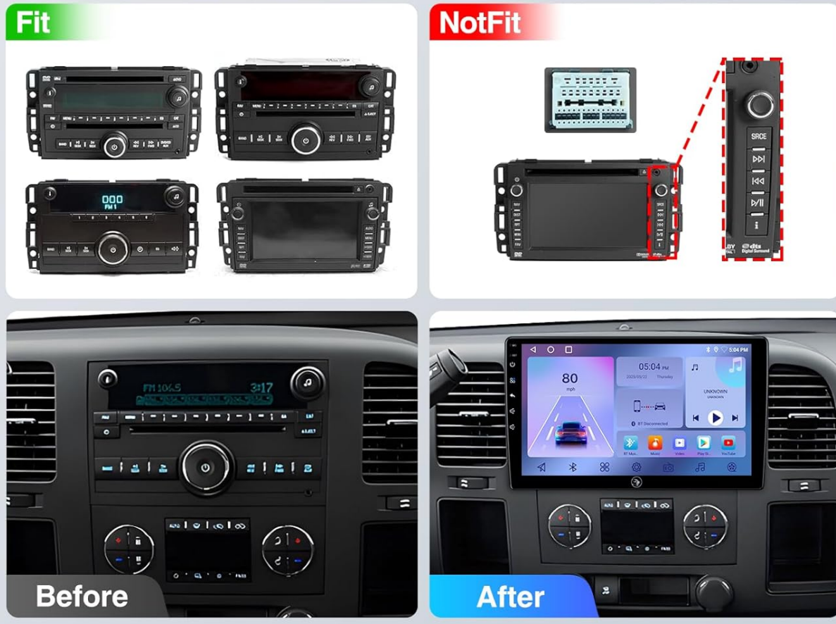
Figure 2.1: Applicable Car Models and Fitment Examples. This image illustrates various car models and their compatibility with the stereo, showing both fitting and non-fitting original radio units.