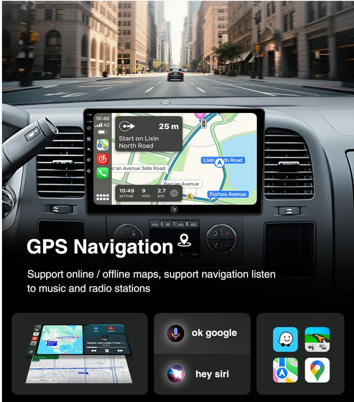
Figure 5.2: GPS Navigation. This image shows the GPS navigation interface with options for online/offline maps and voice commands.

The unit features built-in GPS navigation and supports online/offline maps. Connect to Wi-Fi for online map access. You can install or delete Android apps from the Application Store, similar to a smartphone.