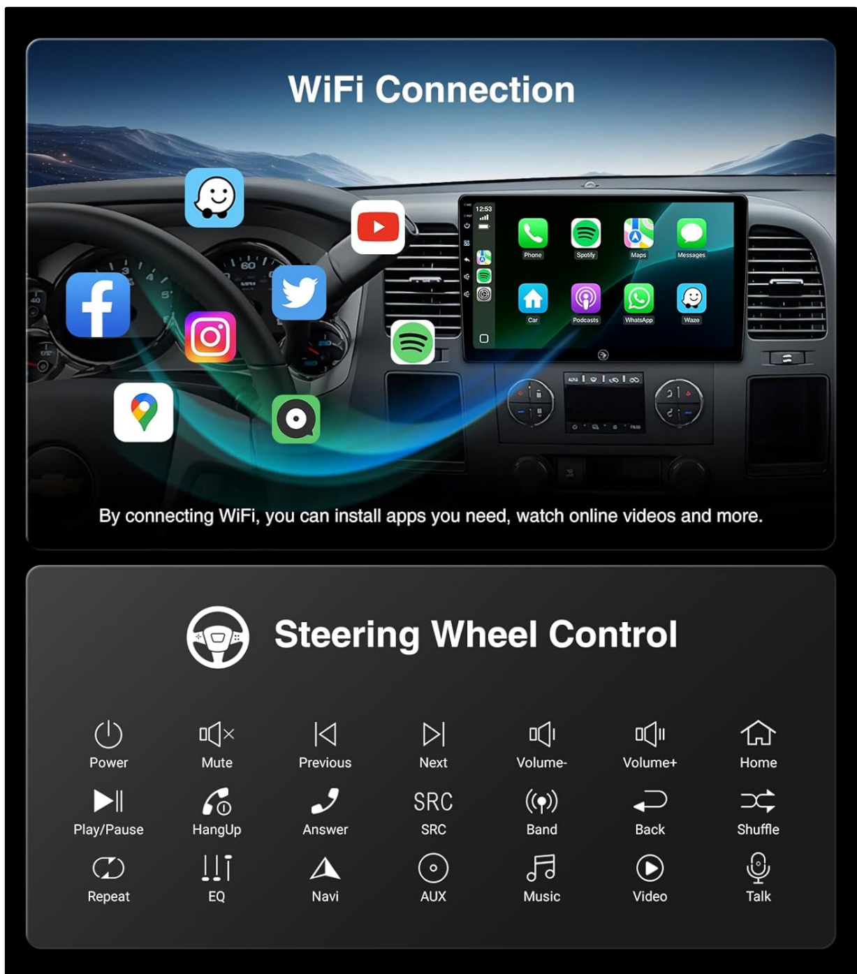
Figure 5.5: WiFi Connection and Steering Wheel Control. This image illustrates the convenience of controlling the stereo directly from the steering wheel.