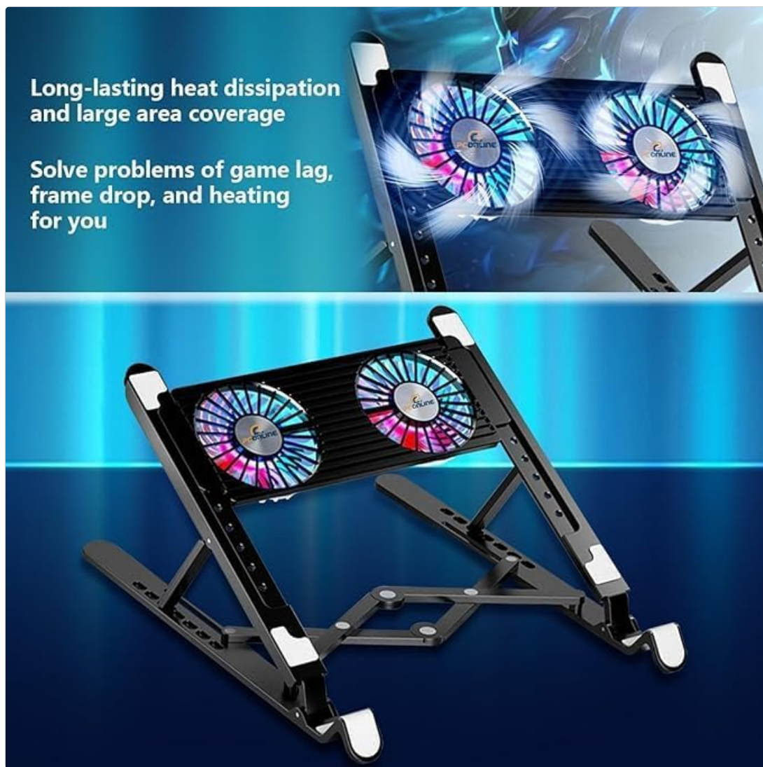
Image: The PCO Notebook Fold Radiator, Cooler, designed for long-lasting heat dissipation and large area coverage to prevent game lag, frame drop, and heating.