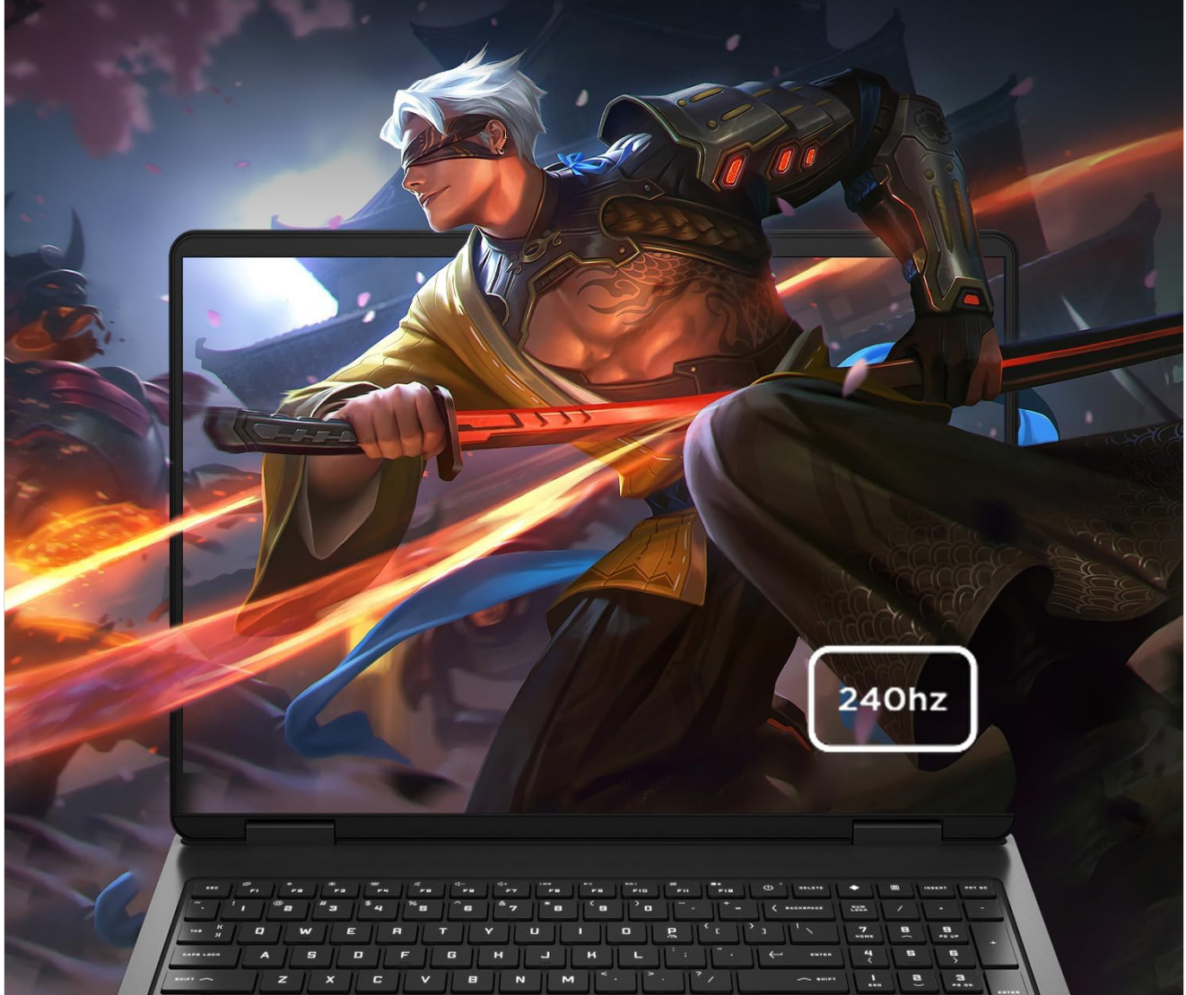
Image: Close-up of the 16-inch WQXGA display showcasing its 240Hz refresh rate.