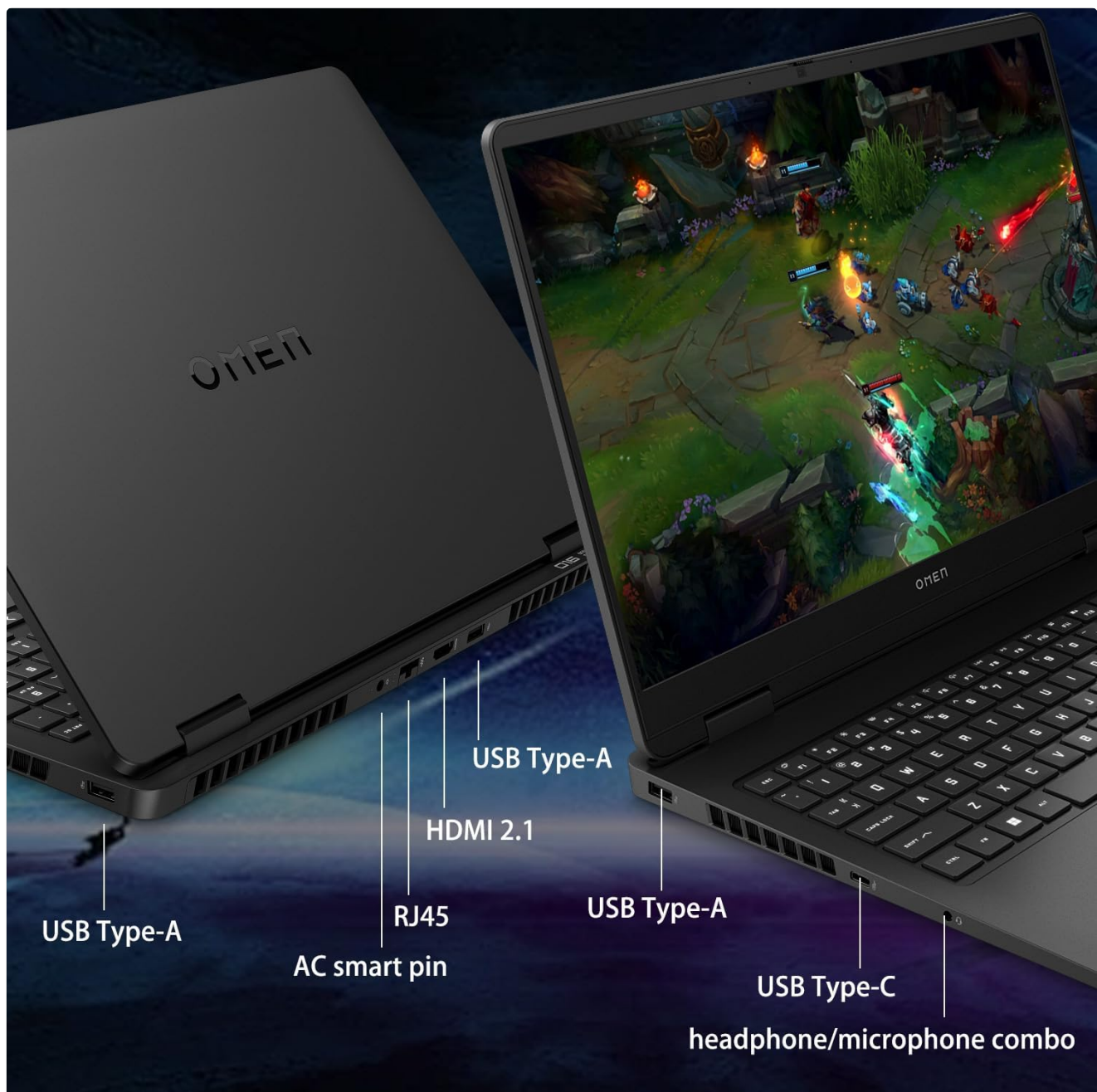
Image: Side view of the HP OMEN laptop highlighting the available ports.