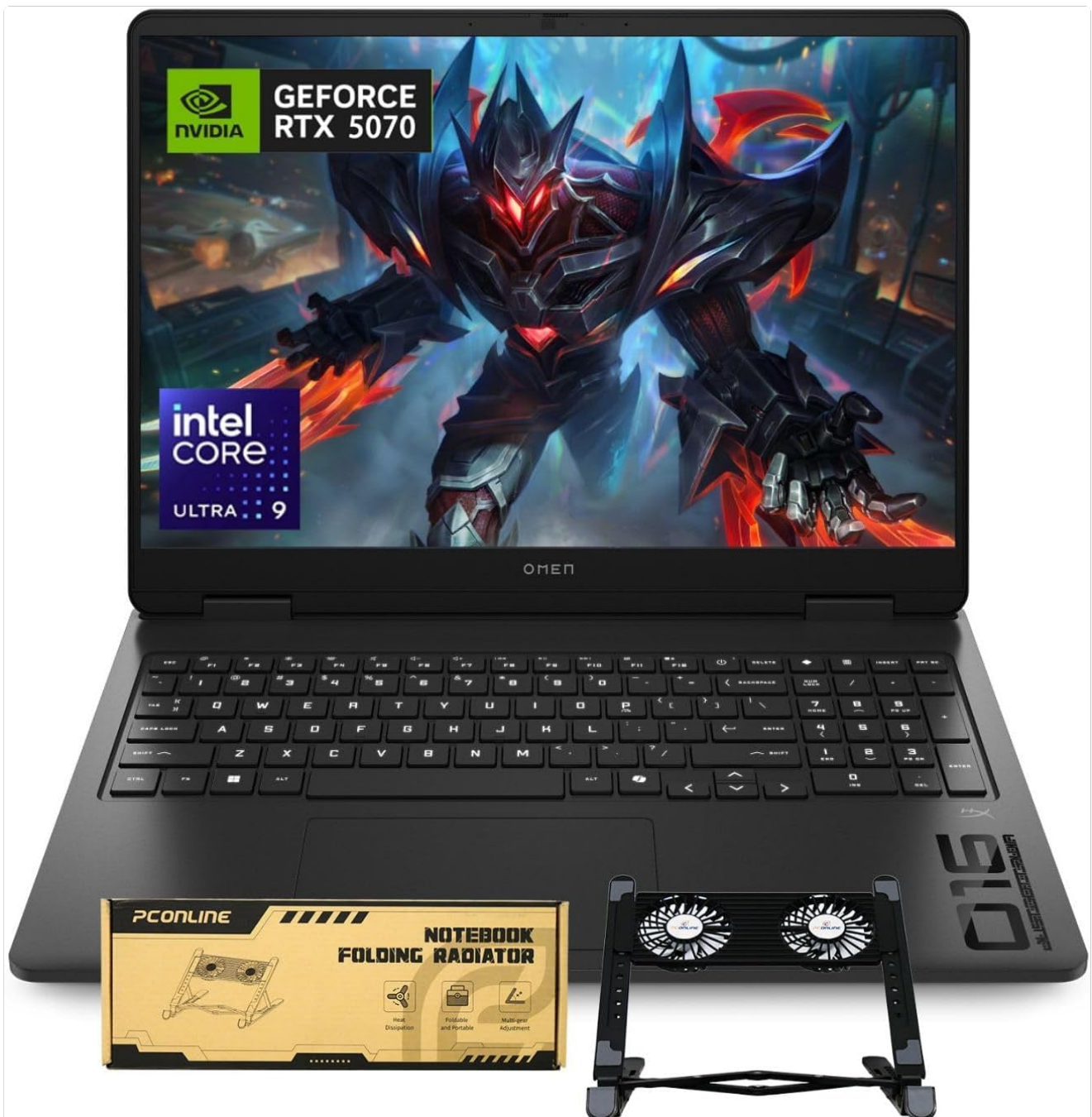
Image: HP OMEN Ultra Slim RTX 5070 Gaming Laptop with included PCO Notebook Fold Radiator, ready for initial setup.

Video: An overview of the HP OMEN Slim laptop, demonstrating its design and features relevant to initial setup and daily use.