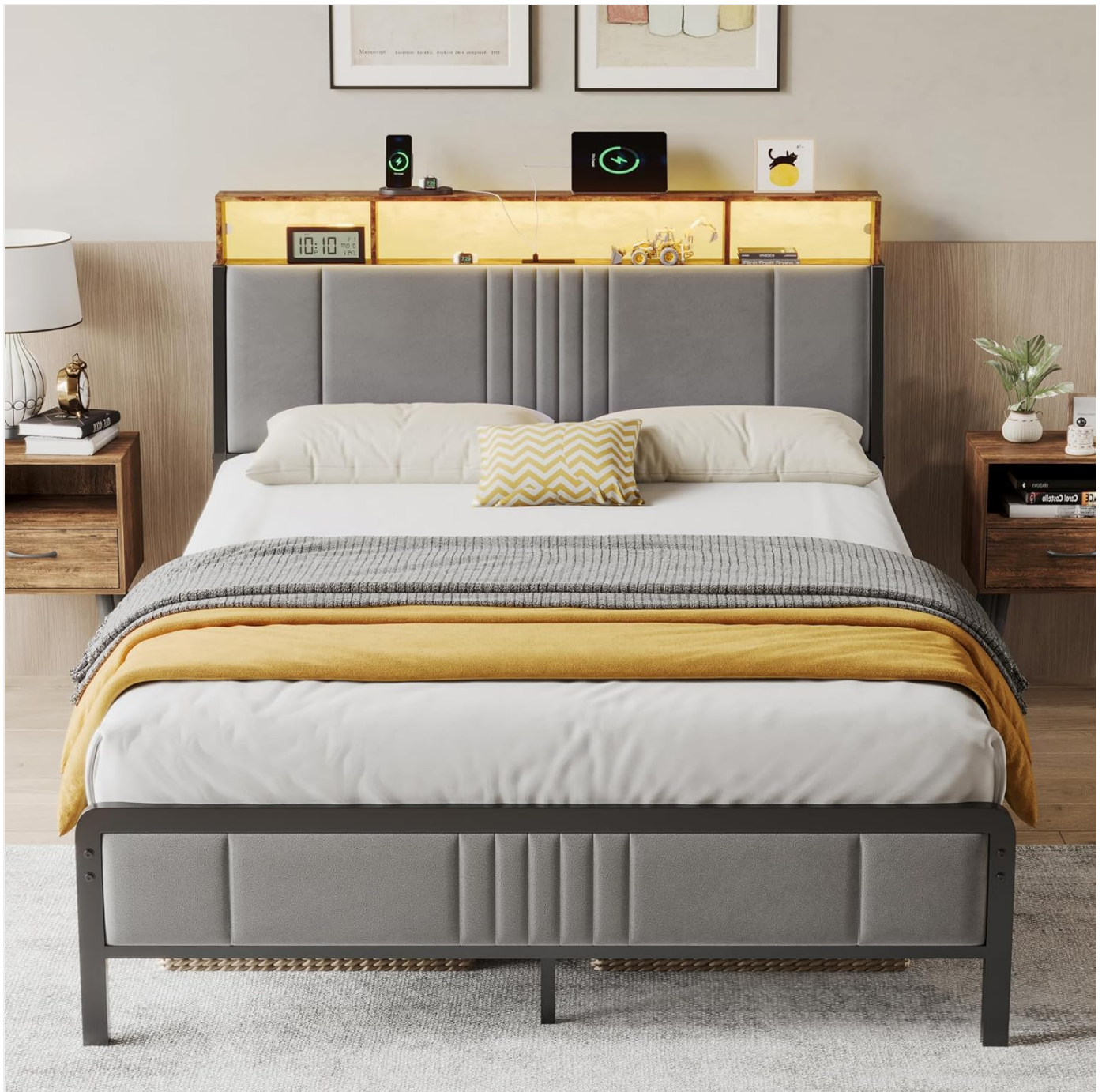
Image: BedsPick Full Size Bed Frame with Ergonomic Headboard, Storage, Charging Station, and Smart LED Lights. The bed frame features a grey upholstered headboard with a wooden shelf above it, equipped with LED lights and a charging station. The frame is black metal, and the bed is made with white and yellow bedding.