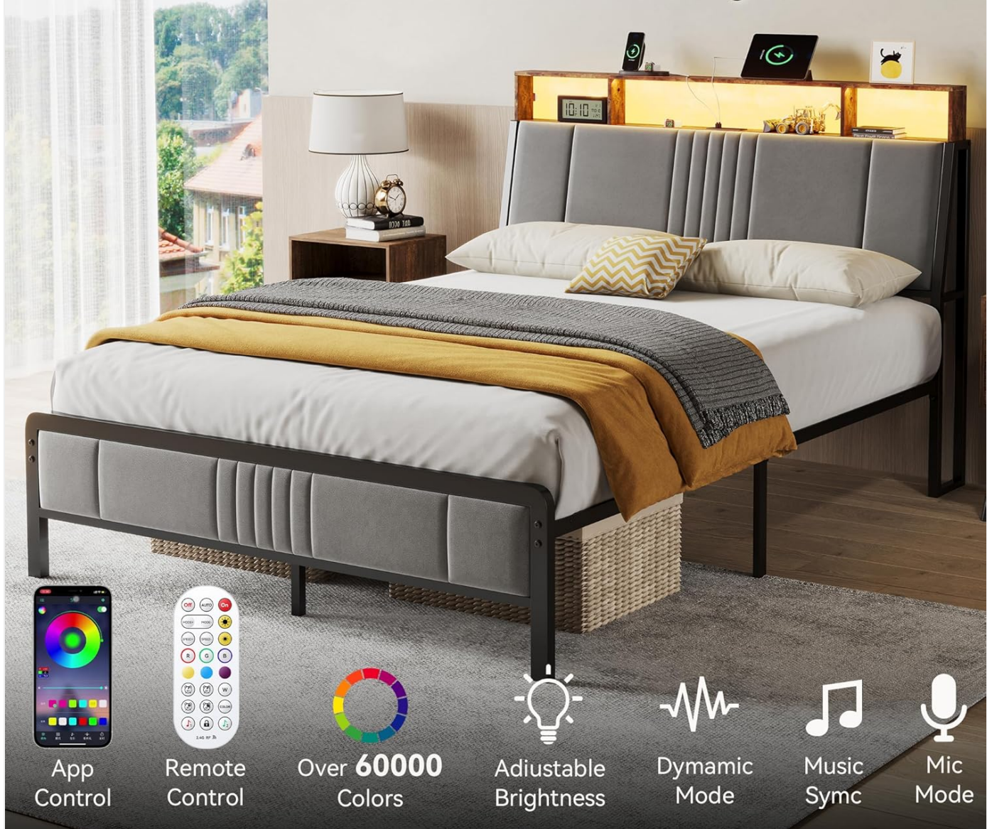
Image: A bedroom scene featuring the bed frame with its headboard LED lights illuminated in a warm yellow. An overlay shows the remote control and a mobile app interface for customizing light colors, brightness, and modes.