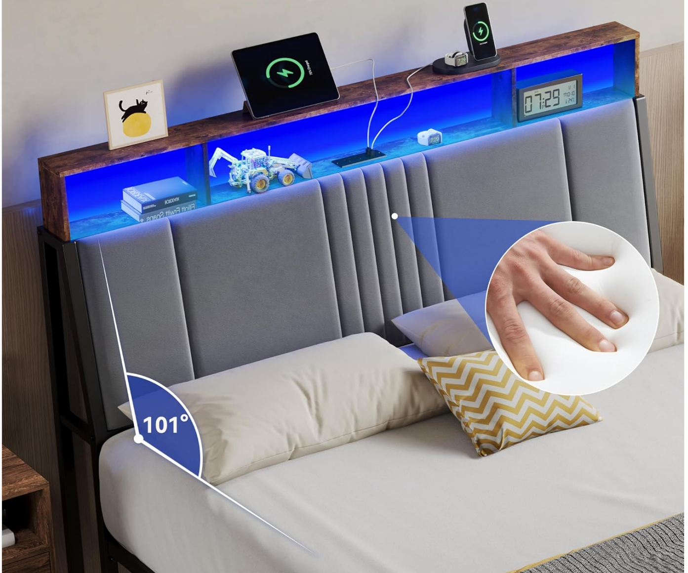
Image: A person sitting comfortably against the upholstered headboard, which is designed with a 101° ergonomic tilt angle for optimal back support. The headboard also features a wooden shelf with integrated LED lighting.