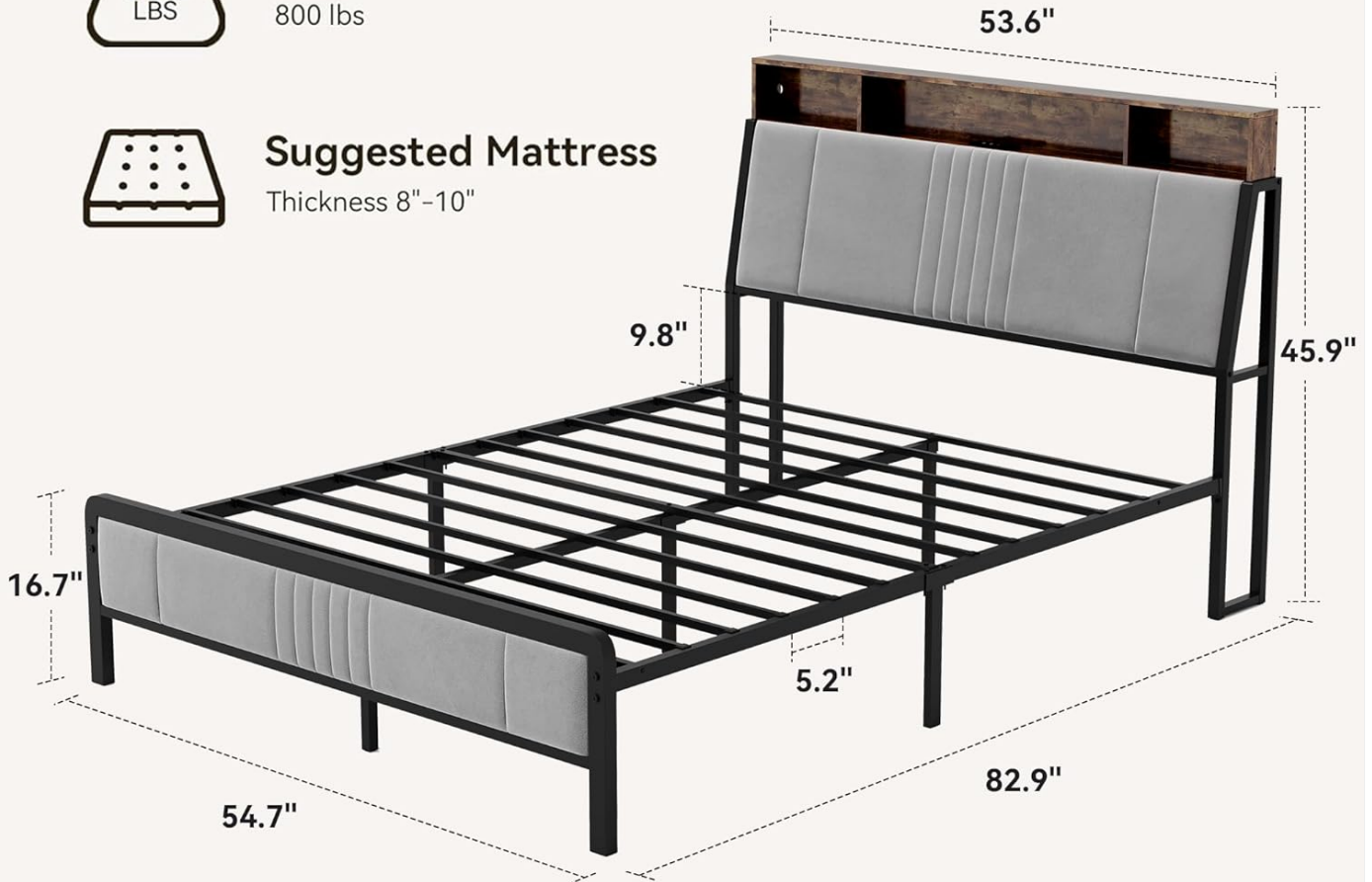
Image: Diagram showing the dimensions of the full-size bed frame (82.9"L x 54.7"W x 45.9"H) and its weight capacity of 800 lbs. It also suggests a mattress thickness of 8"-10".