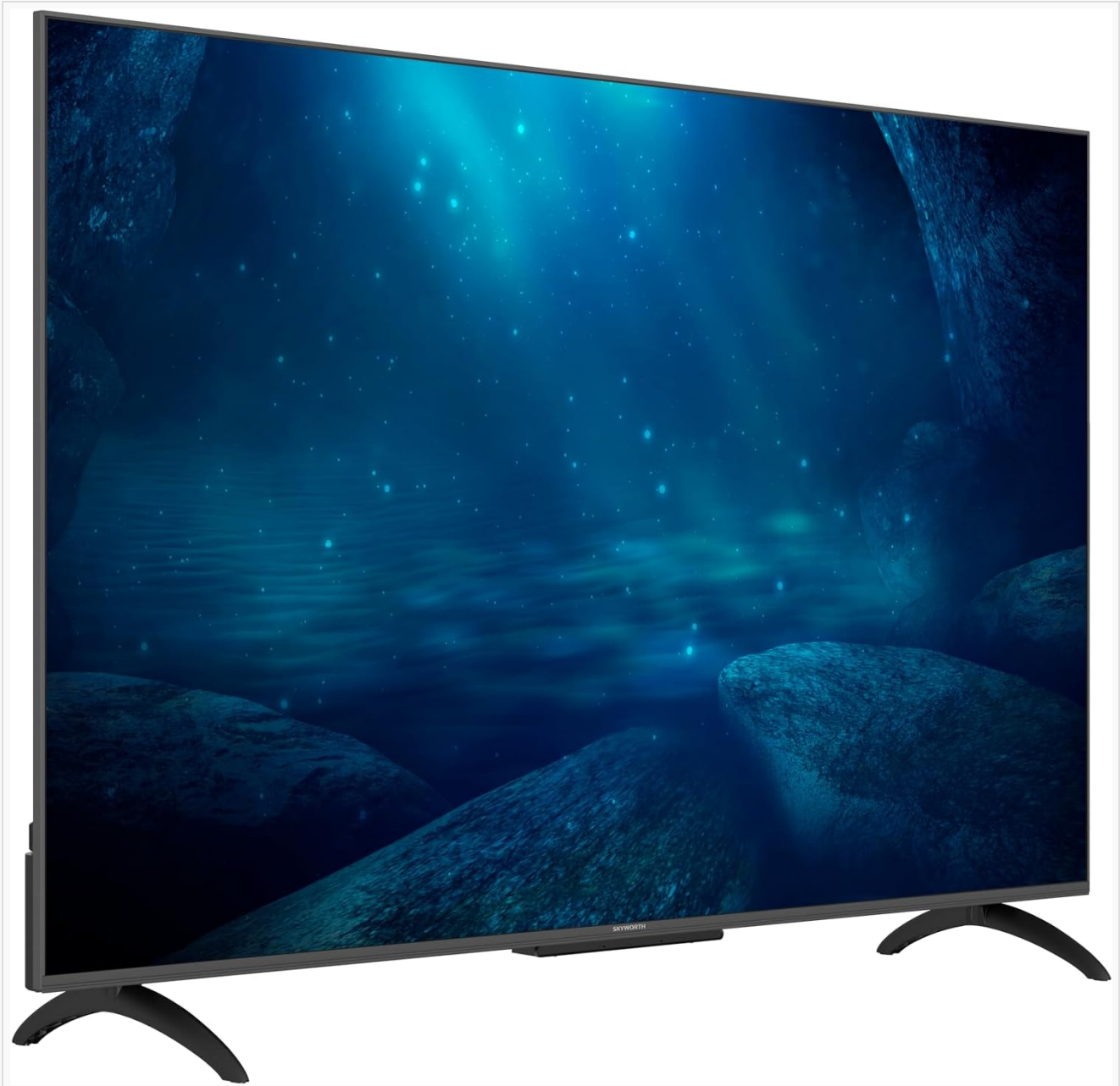
Image: Side profile of the Skyworth 60Q6820H television, illustrating the location of various input and output ports for external device connections.