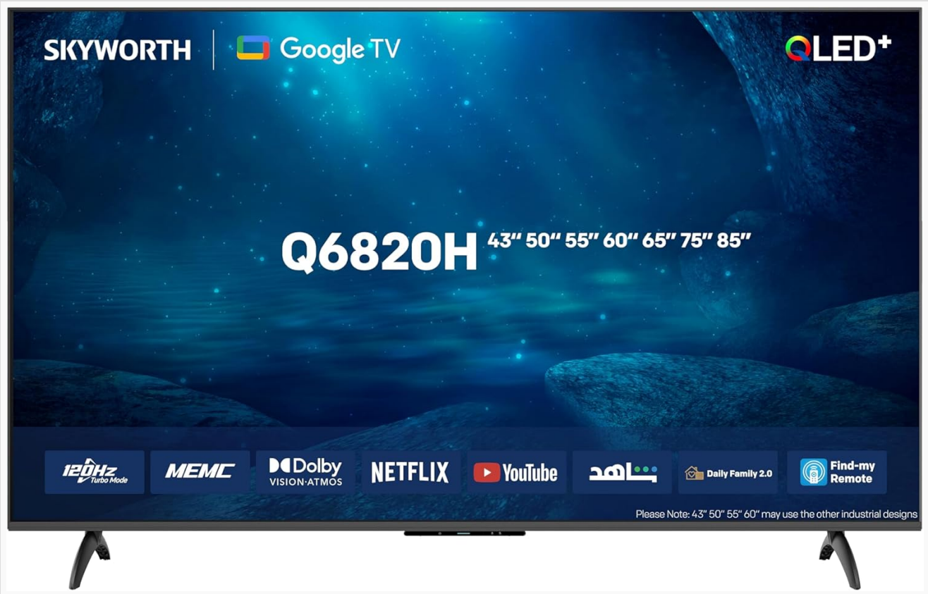
Image: Front view of the Skyworth 60Q6820H television with its two-pronged stand securely attached, ready for placement.