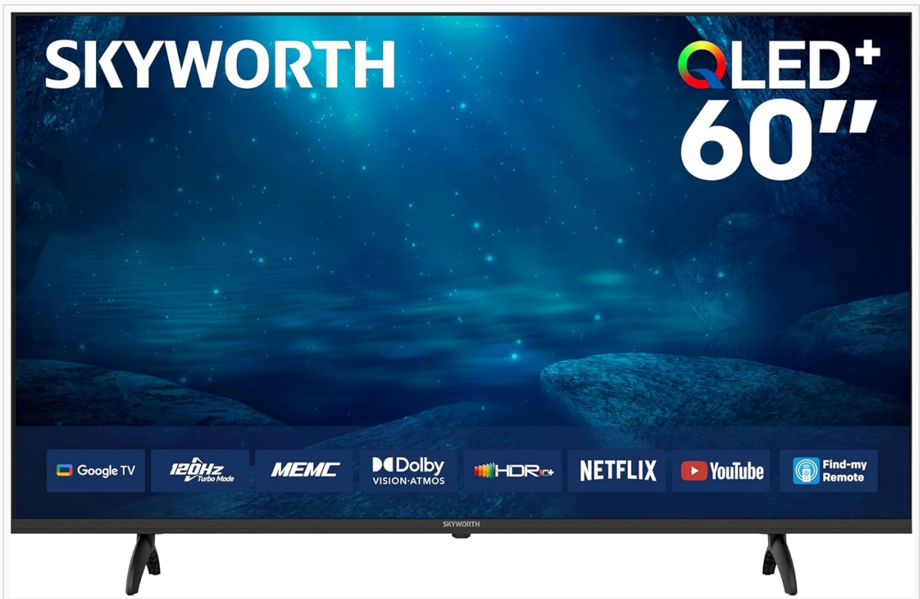
Image: Front view of the Skyworth 60Q6820H television, showcasing its slim bezels and the included remote control and power cord.