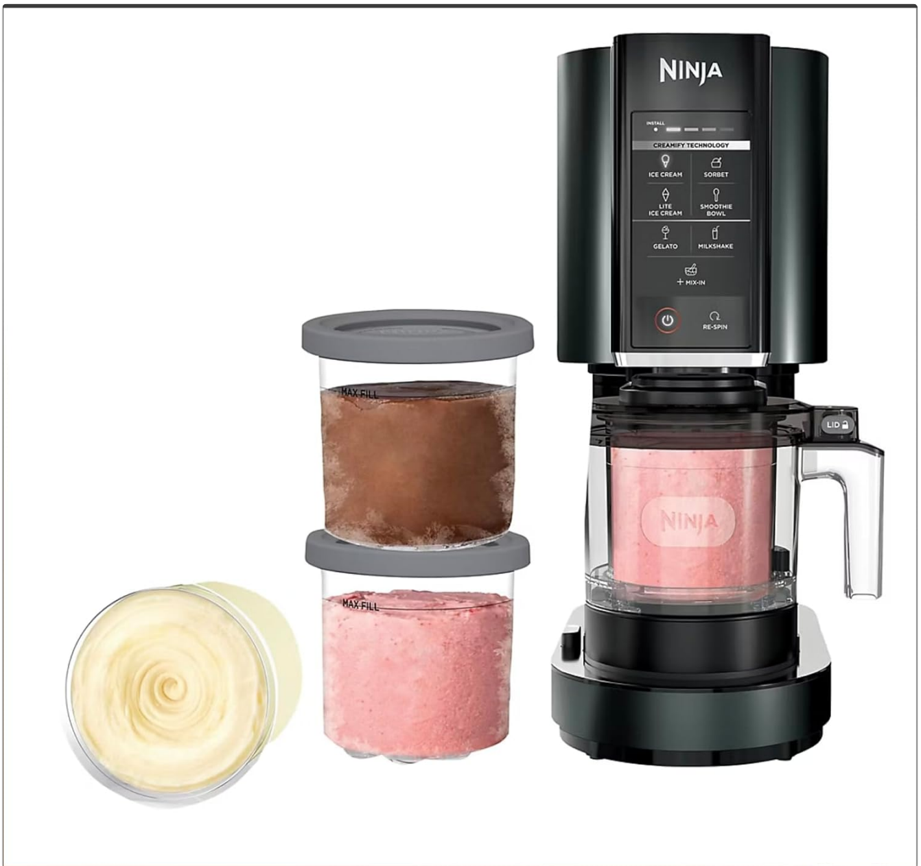
The Ninja CREAMi machine with included pints, ready for use.