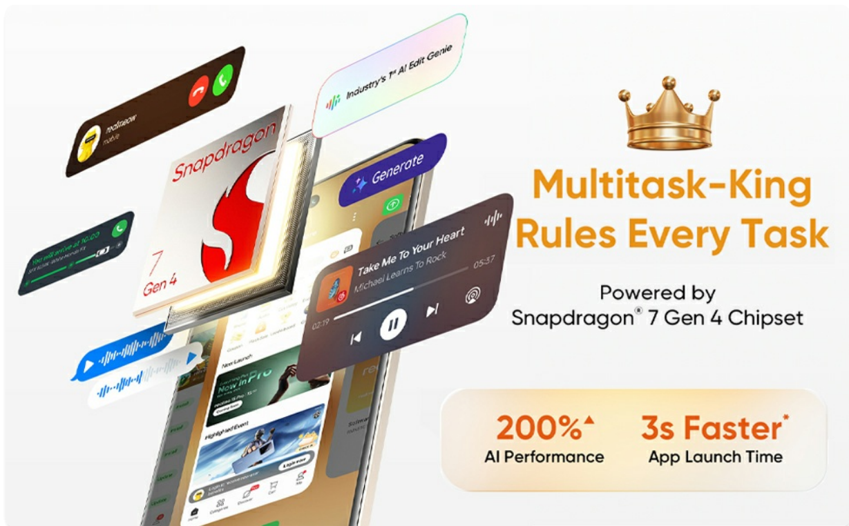
Image 4.6: Visual representation of the Snapdragon 7 Gen 4 processor powering the device.