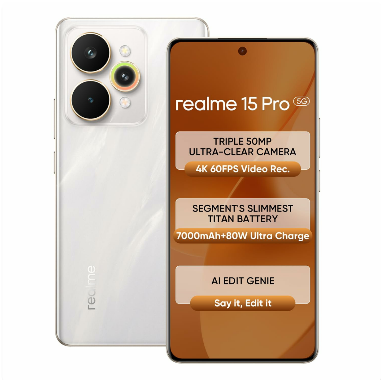
Image 1.1: realme 15 Pro 5G Smartphone, showcasing its design and key features.