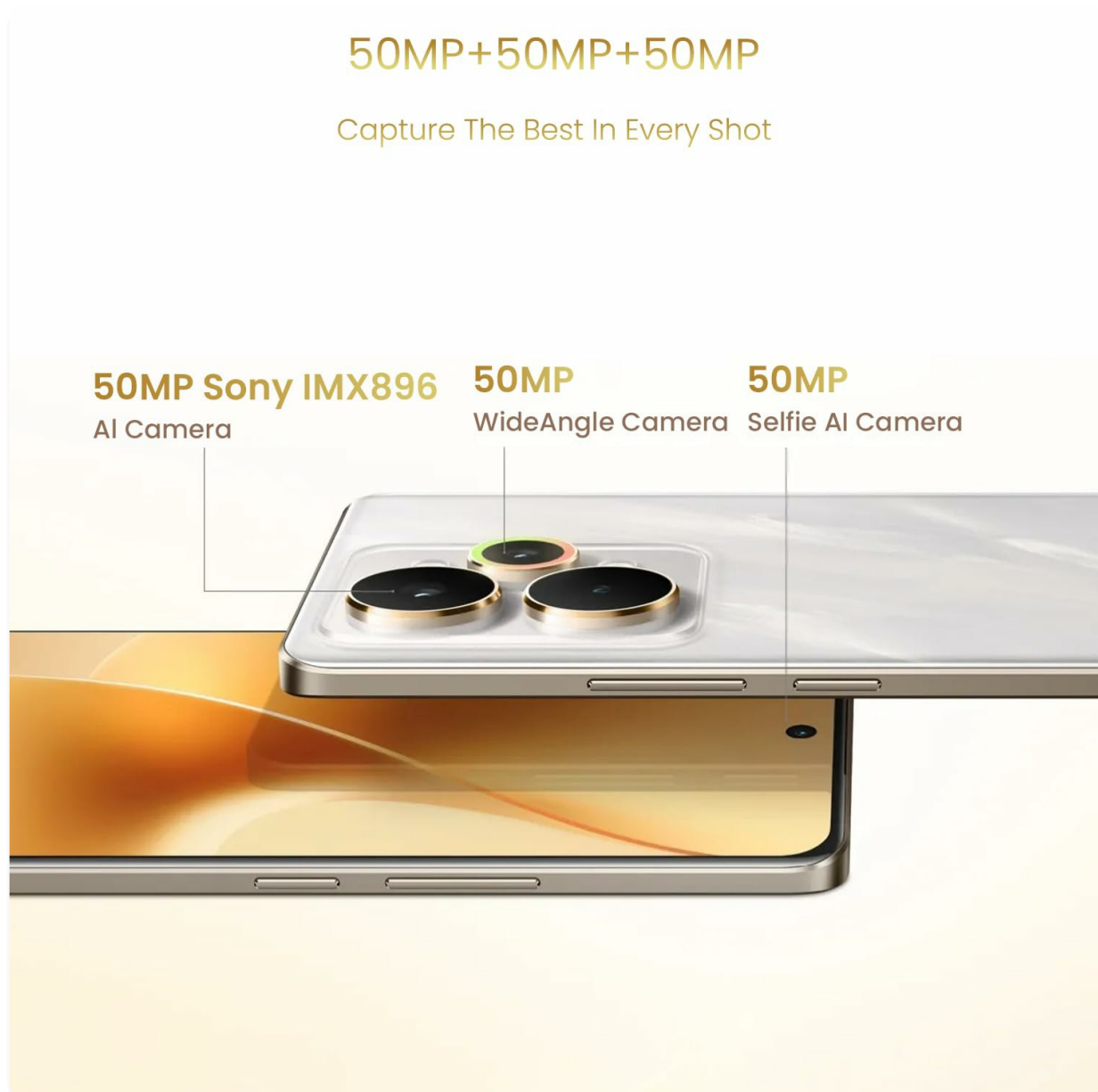
Image 4.3: Detailed view of the triple 50MP camera system on the realme 15 Pro 5G.