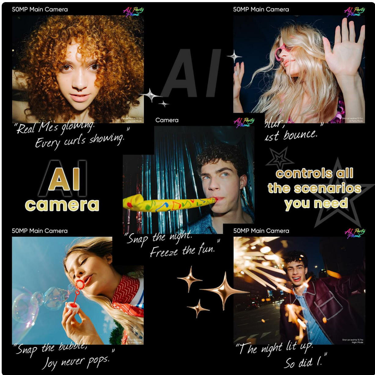
Image 4.4: Examples of photographic capabilities using the AI camera features.