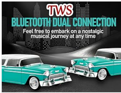
Image: The WSTER WS-1955 speaker showcasing its retro styling and dynamic LED light effects.