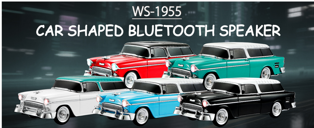
Image: The WSTER WS-1955 speaker emphasizing its classic design and seamless Bluetooth connectivity.