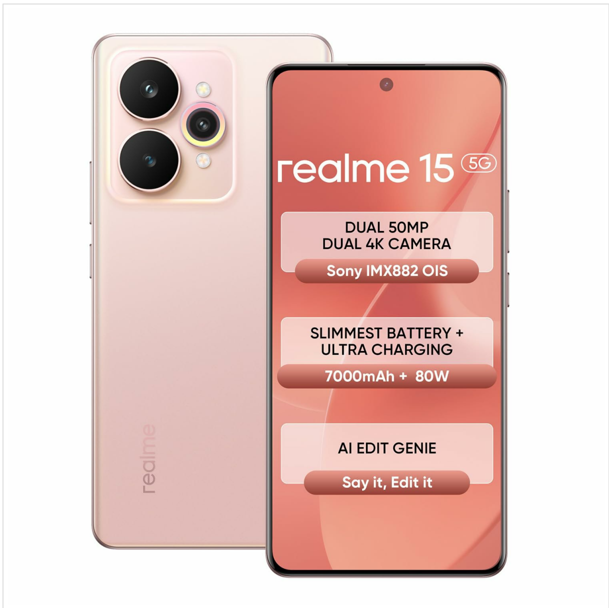
Image: Front and rear view of the realme 15 5G Smartphone, highlighting its camera module and curved display.