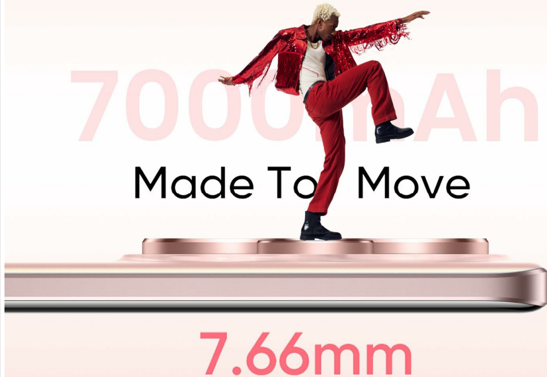
Image: Side profile of the realme 15 5G Smartphone, illustrating its slim 7.66mm design.