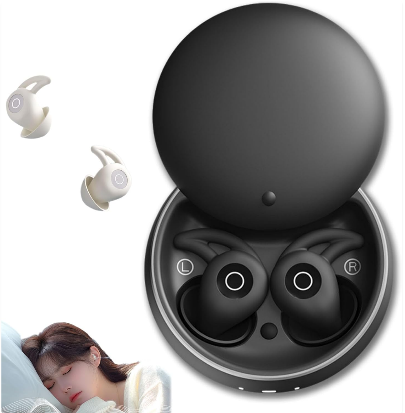
Image: The Noorasleep Snooze Pods Pro, showing the sleepbuds, their charging case, and additional ear tips. A person is shown sleeping comfortably with the earbuds in.