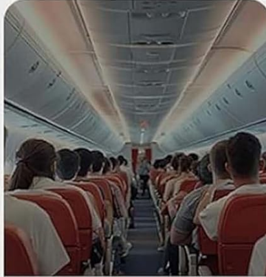
Traveling by plane