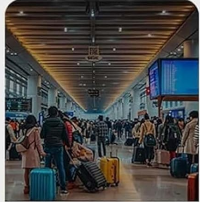
Train waiting room