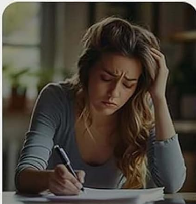
Can't work/study in peace